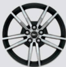
18" Magnetic-Painted Machined Aluminum Standard: EcoBoost®, EcoBoost Premium, GT, GT Premium