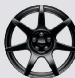
19" x 11" Front/19" x 11.5" Rear Ebony Black-Painted Carbon-Fiber Included: Shelby GT350R Package