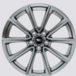
19" Premium Dark Stainless- Painted Aluminum Optional: GT Premium