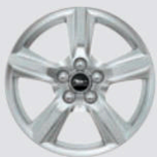
17" Sparkle Silver-Painted Aluminum Standard: V6