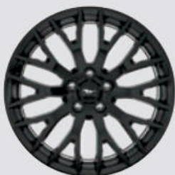
19" x 9" Front/19" x 9.5" Rear Ebony Black-Painted Aluminum Included: GT Performance Package