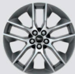
20" x 9" Foundry Black-Painted Machined Aluminum Optional: EcoBoost Premium, GT Premium