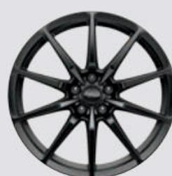
19" x 10.5" Front/19" x 11" Rear Ebony Black-Painted Aluminum Standard: Shelby GT350