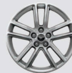
19" Polished Aluminum Included: EcoBoost Premium Pony Package