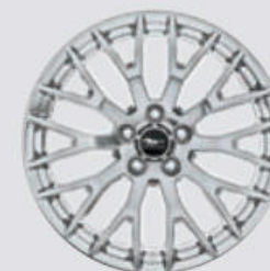
19" x 9" Front/19" x 9.5" Rear Luster Nickel-Painted Aluminum Optional: GT Performance Package