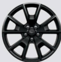
19" Ebony Black-Painted Aluminum Included: GT Black Accent Package