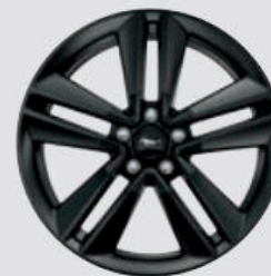
19" Ebony Black-Painted Aluminum Included: EcoBoost Performance Package