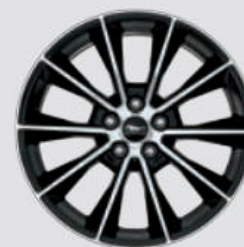
19" Low-Gloss Black-Painted Machined Aluminum Included: EcoBoost Interior & Wheel Package, Wheel & Stripe Package, GT Interior & Wheel Package