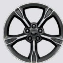
19" Ebony Black-Painted Machined Aluminum Included: GT Premium California Special