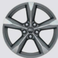
18" Foundry Black-Painted Machined Aluminum Included: V6 051A Optional: EcoBoost, EcoBoost Premium, GT, GT Premium