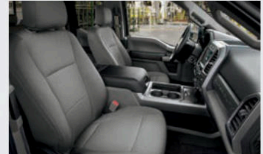
XLT SuperCab cloth-trimmed interior in Medium Earth Gray with 40/console/40 front bucket seats and available equipment.