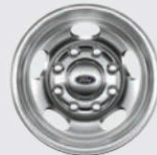
17" Polished Forged-Aluminum with Bright Center Cap Optional: XL & XLT F-350 DRW Standard: LARIAT F-350 DRW