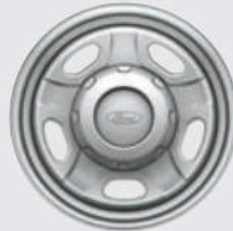
18" Argent-Painted Steel with Painted Center Cap Optional: XL F-350 SRW