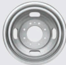
17" Argent-Painted Steel with Center Cap Standard: XL & XLT F-350 DRW