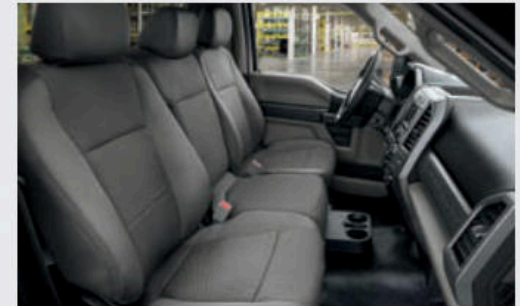
XL Regular Cab cloth-trimmed interior in Dark Earth Gray with XL Value Package, 40/20/40 split front seat and available equipment.