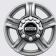
17" Cast-Aluminum with Bright Center Cap Optional: XL F-350 SRW Standard: XLT F-350 SRW