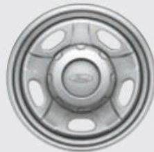
17" Argent-Painted Steel with Painted Center Cap Standard: XL F-350 SRW Optional: XLT F-350 SRW (Fleet Only)