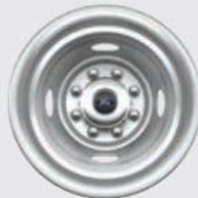
17" Argent-Painted Steel with Stainless Steel Covers Optional: XL & XLT F-350 DRW