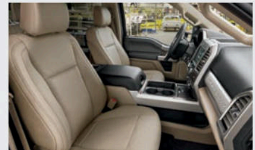
LARIAT Crew Cab leather-trimmed interior in Medium Light Camel with 40/console/40 front bucket seats and available equipment.