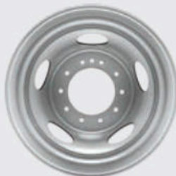
19.5" Argent-Painted Steel Standard: XL & XLT F-450/F-550