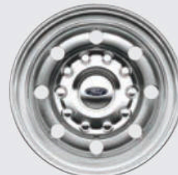
19.5" Polished Forged-Aluminum with Bright Center Cap Optional: XLT F-450/F-550 Standard: LARIAT F-450/F-550

New Vehicle Limited Warranty. We want your Ford F-Series Super Duty® Chassis Cab ownership experience to be the best it can be. Under this warranty, your new vehicle comes with 3-year/36,000-mile bumper-to-bumper coverage, 5-year/60,000-mile Powertrain Warranty coverage, 5-year/60,000-mile safety restraint coverage, and 5-year/unlimited-mile corrosion (perforation) coverage – all with no deductible. The Ford 6.7L Power Stroke® diesel engine gets 5-year/100,000-mile warranty coverage. Please ask your Ford Dealer for a copy of this limited warranty.