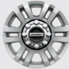
18" Cast-Aluminum with Bright Center Cap Optional: XLT F-350 SRW