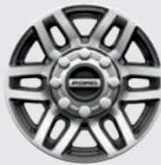
18" Bright-Machined Cast-Aluminum with Bright Center Cap Standard: LARIAT F-350 SRW