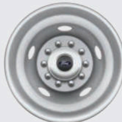
19.5" Argent-Painted Steel with Stainless Steel Covers Optional: XL & XLT F-450/F-550