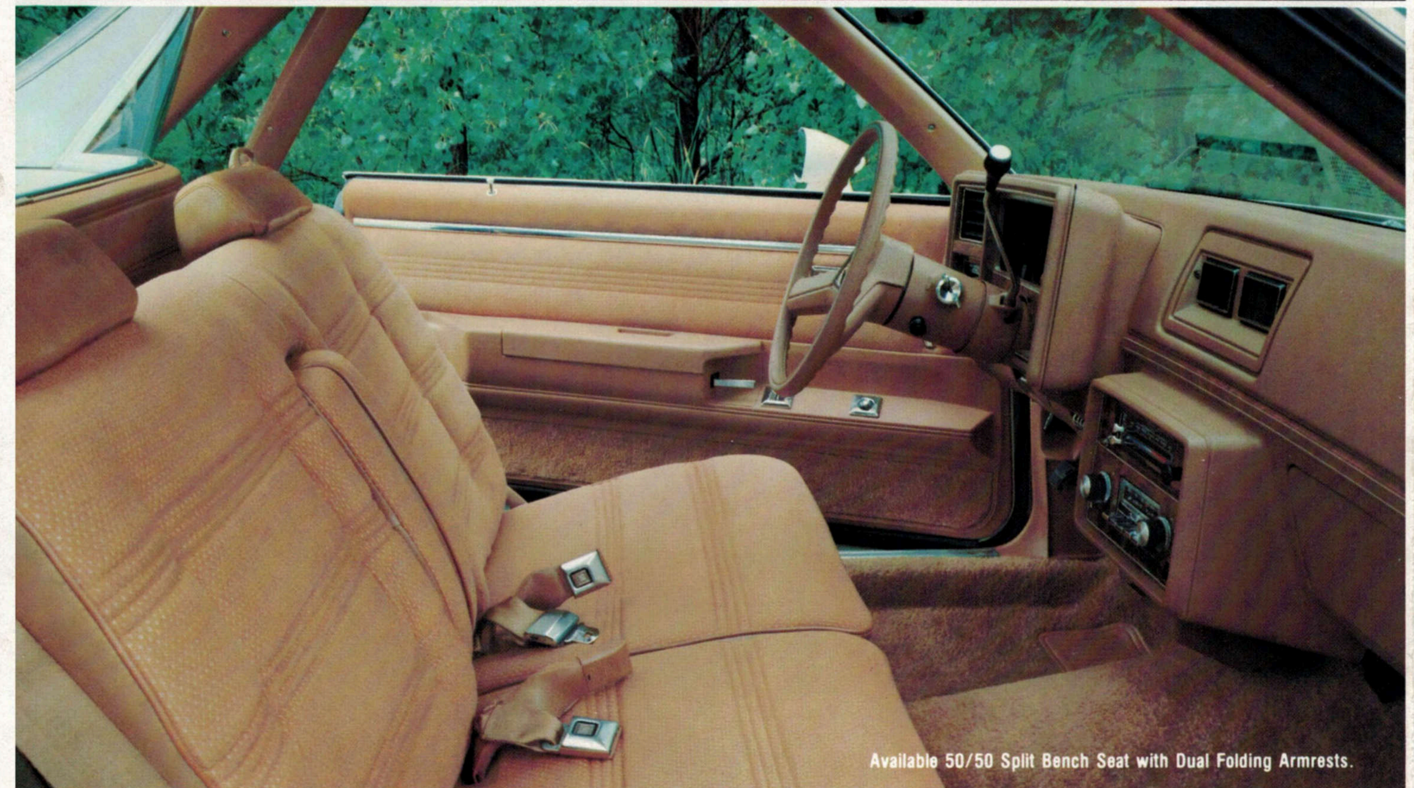
Available 50/50 Split Bench Seat with Dual Folding Armrests.