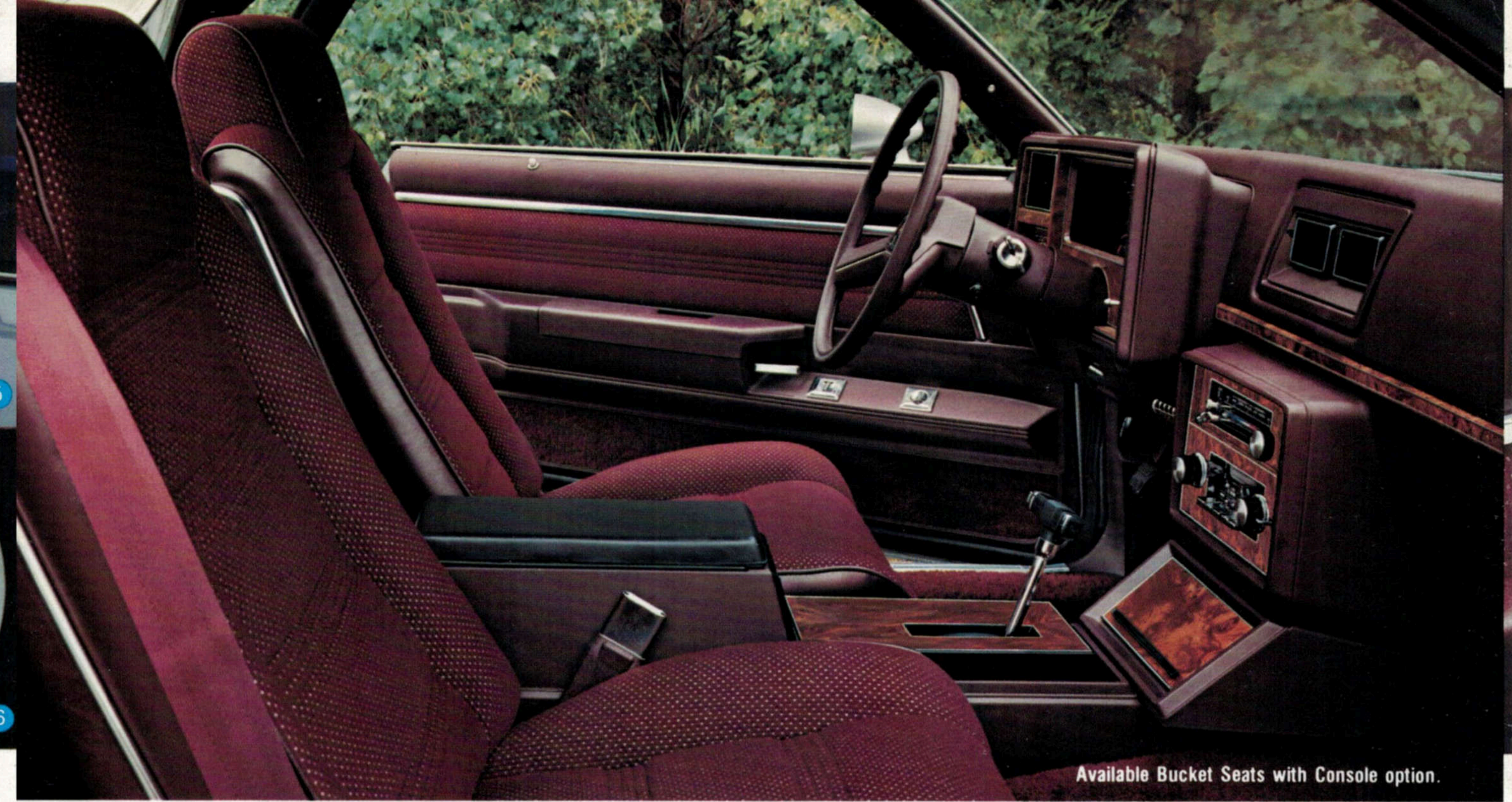
Available Bucket Seats with Console option.