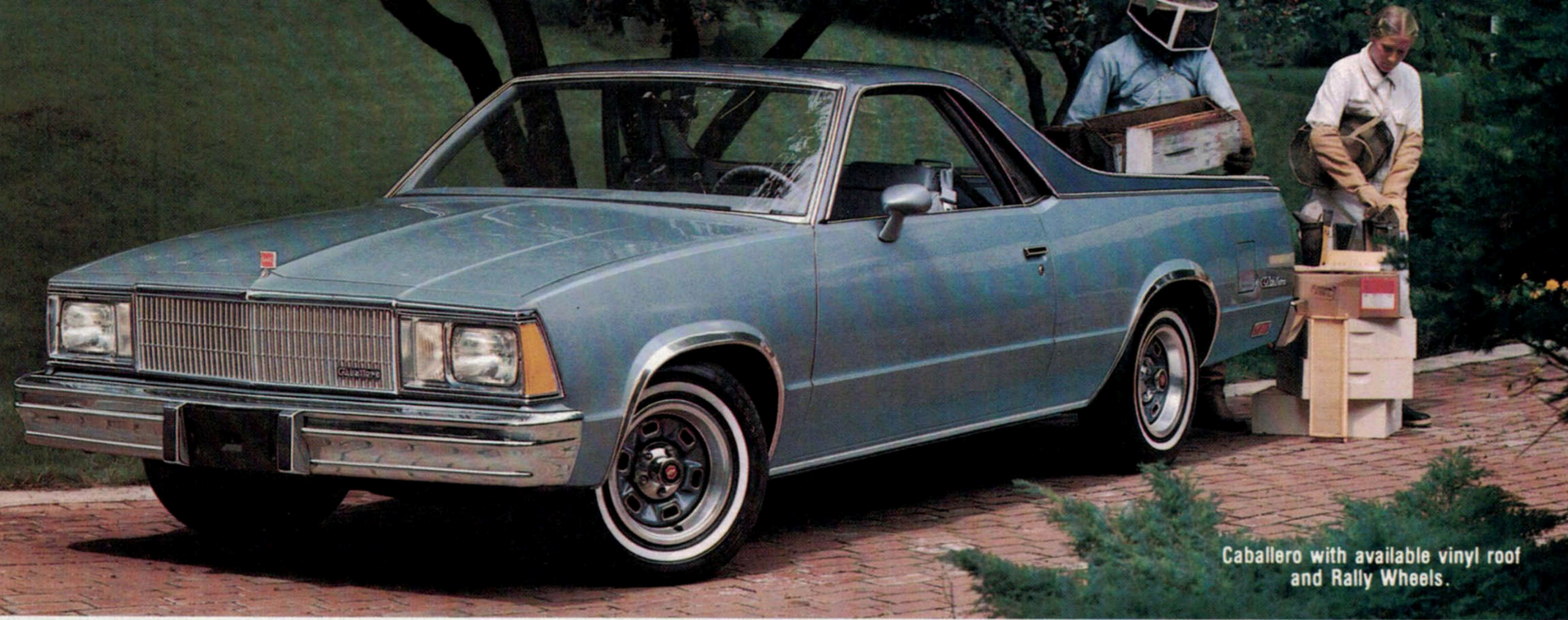
Caballero with available vinyl roof and Rally Wheels.