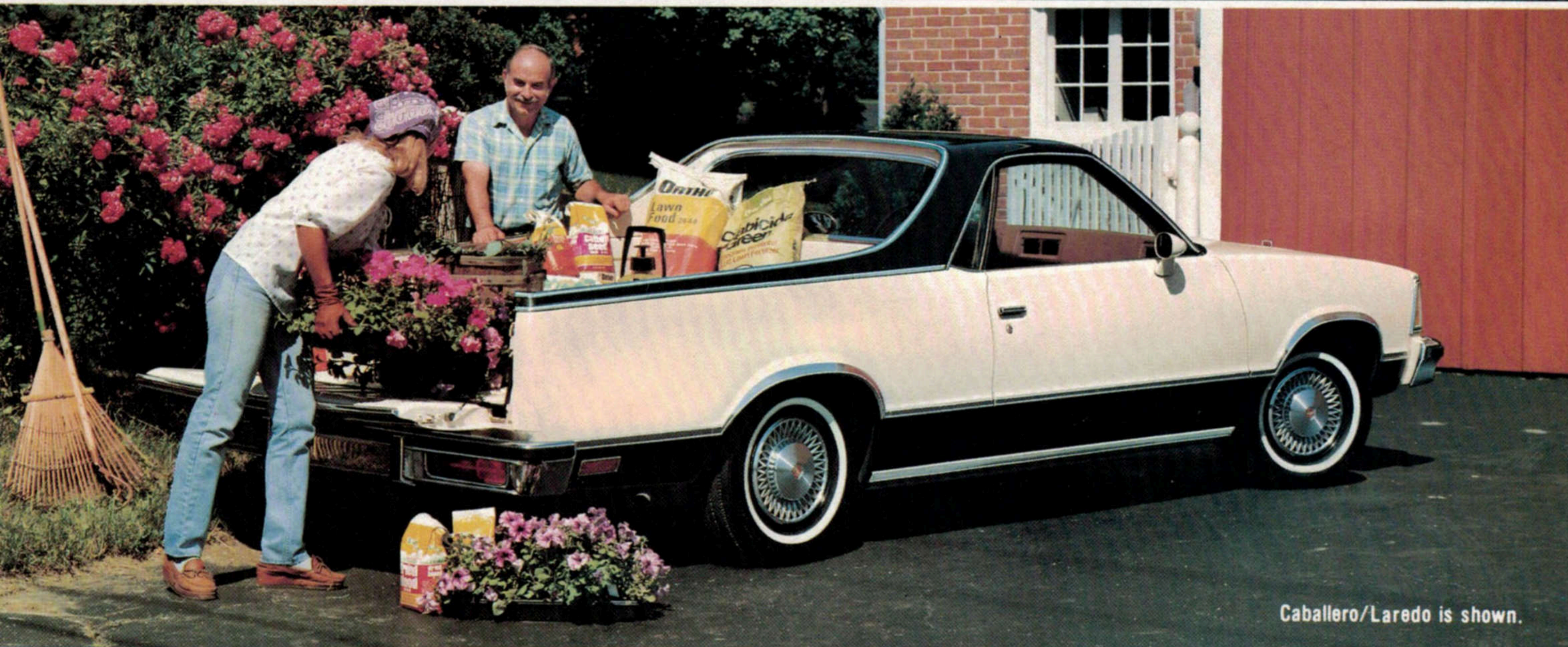
Caballero/Laredo is shown.