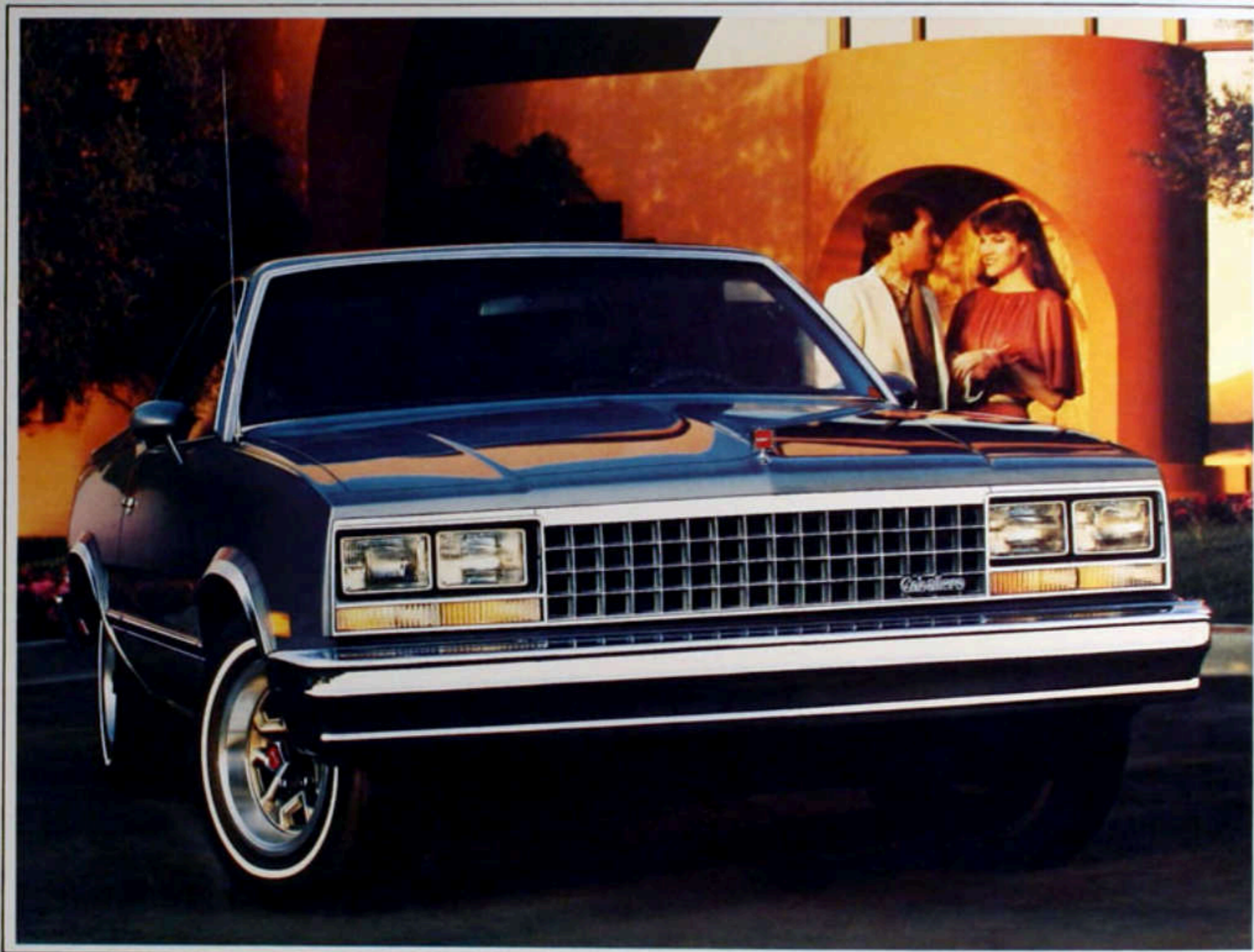
Caballero—dramatic truck decor.

All Caballeros have rugged coil-spring suspension front and rear together with a front stabilizer bar. Standard air-adjustable rear shock absorbers can be boosted with service-station air pressure to level the vehicle when carrying heavy loads. The air valve is located inside the fuel filler door. An optional Sport Suspension is available which includes higher-rate springs and upper control arm rear bushings,