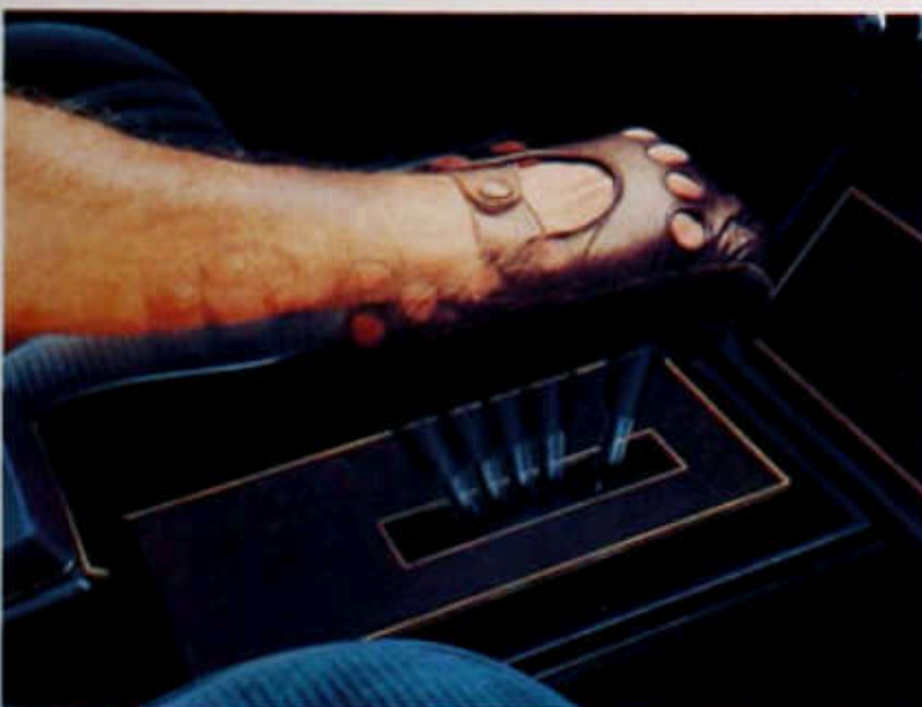
Available floor mounted center console with shift lever, stowage compartment and ash tray