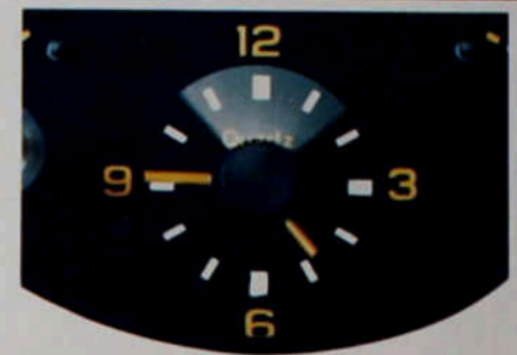
Quartz electric clock