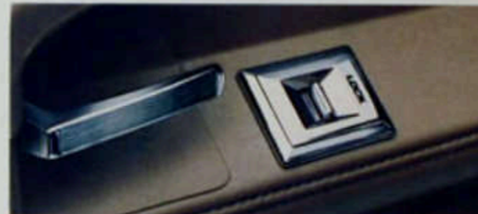
Power door locks