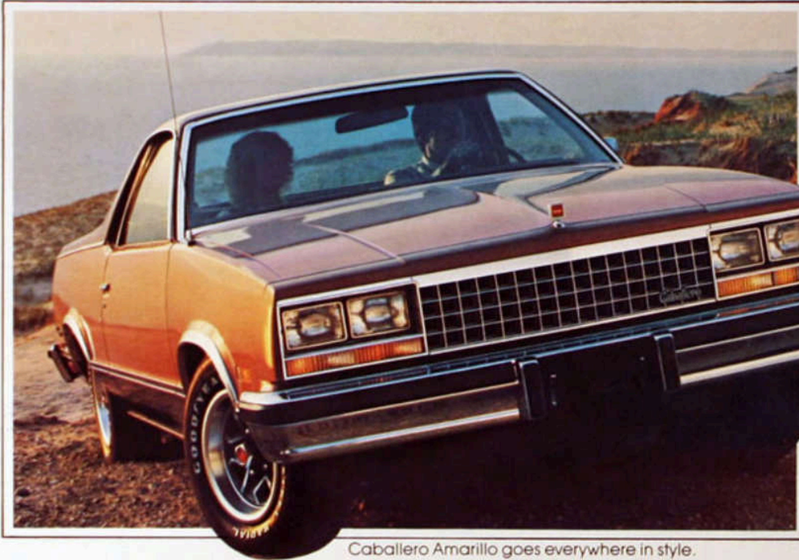
Caballero Amarillo goes everywhere in style.