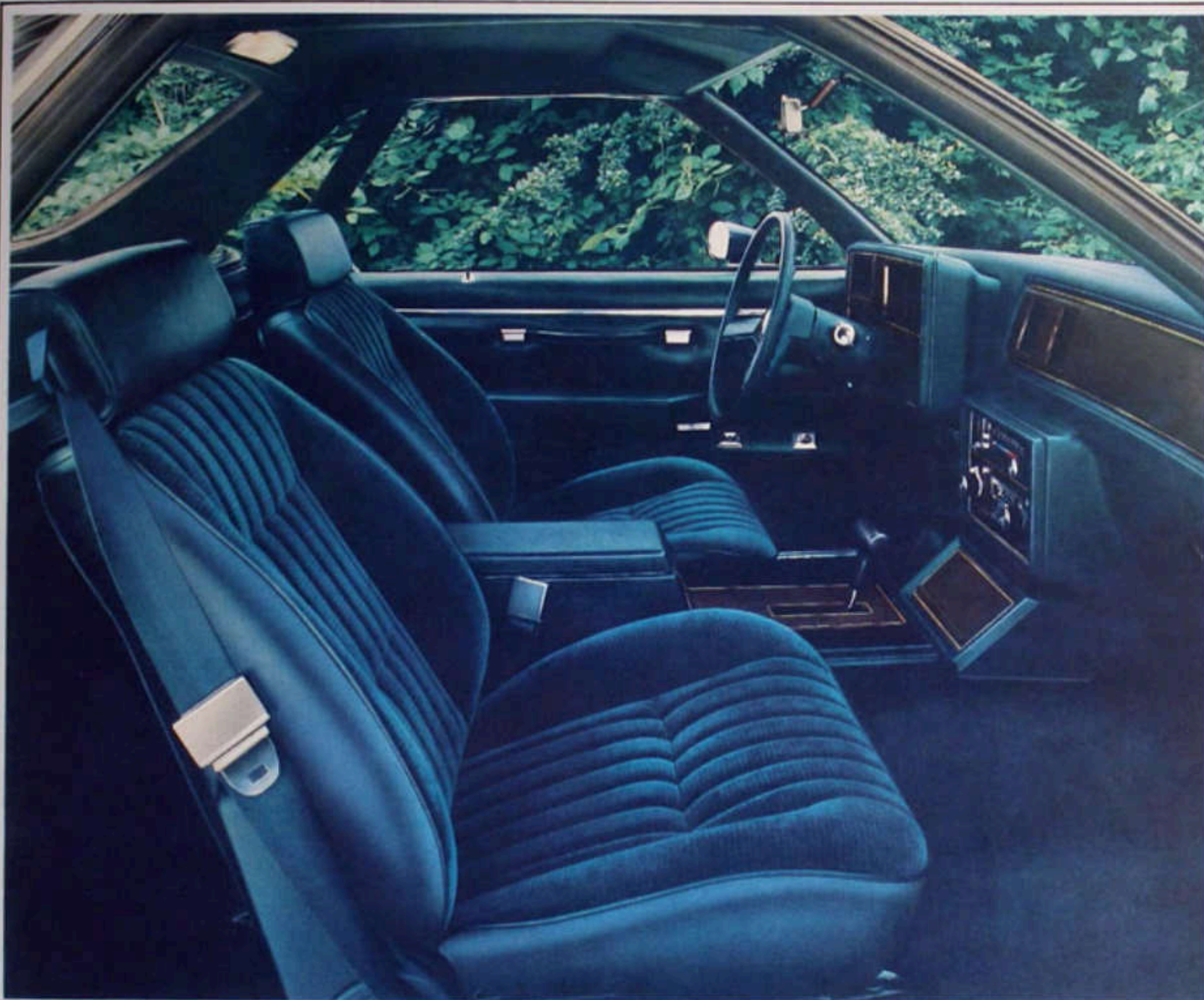
Available high-back bucket seats with cloth upholstery