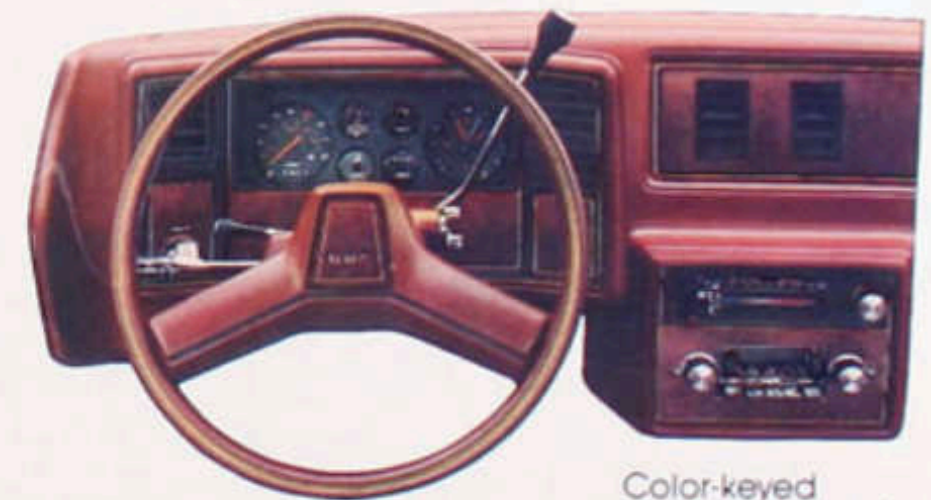
Color-keyed instrument panel

Ask your GMC Dealer for a Demonstration Drive.