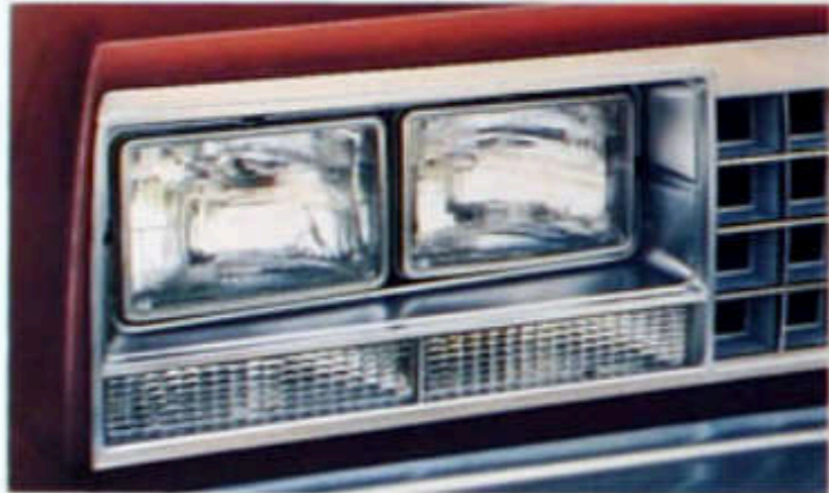
New hi-lo beam halogen headlamps