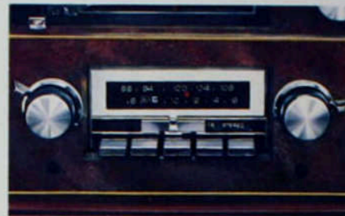
AM/FM stereo radio with cassette player