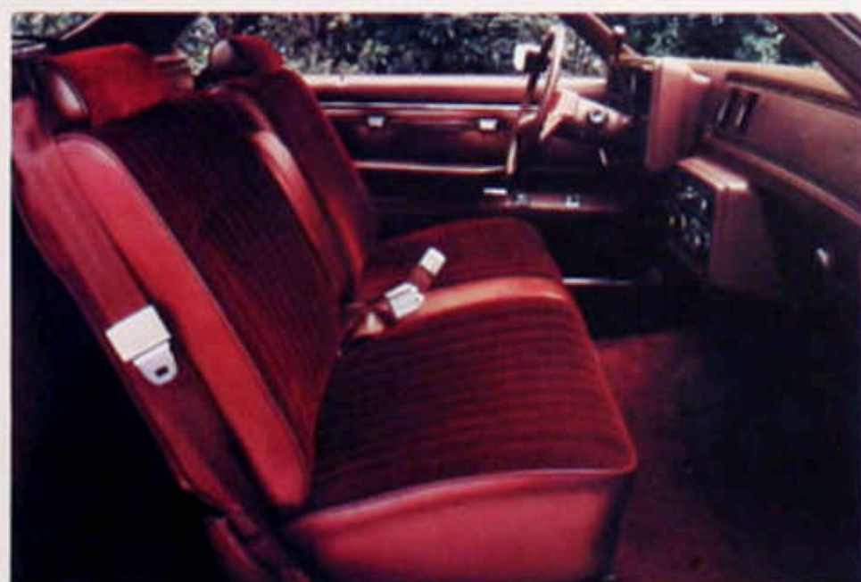
Available 55/45-split bench seat with new-design cloth trim