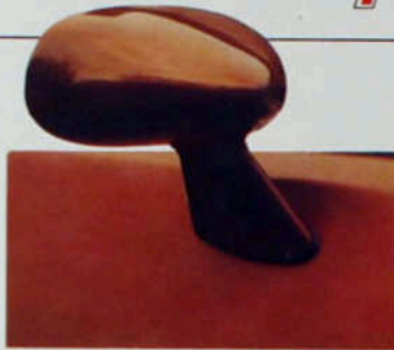
Sport mirrors LH remote, RH convex manual