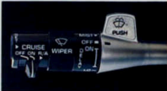
Automatic speed control with resume speed feature