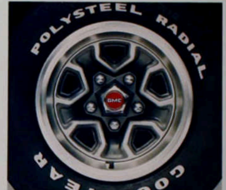
Rally wheel with trim ring