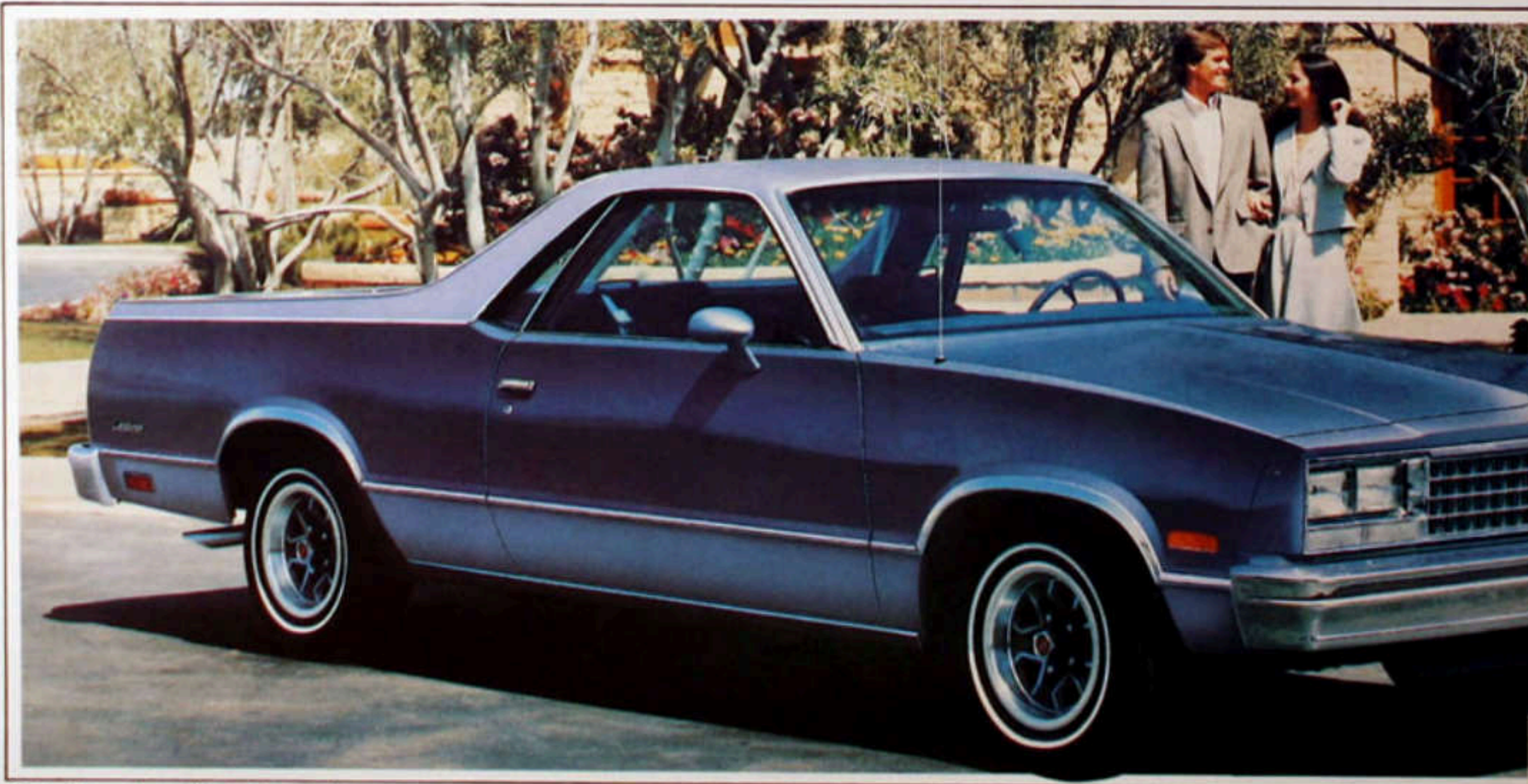
Caballero Amarillo is shown. Tires are supplied by various manufacturers.

Whatever Caballero model you choose, it can be equipped with a variety of available options and dealer-installed accessories. See page 4 for details.