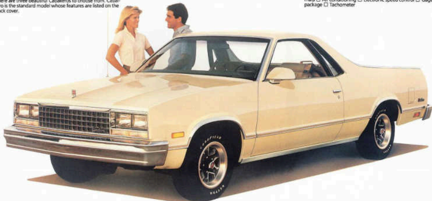
Diablo... harmonious blend of style and practicality. Tires are supplied by various manufacturers.

All Caballero models have rugged truck construction, extensive anti-corrosion treatment, coil-spring suspension, air-adjustable rear shock absorbers, and the built-in quality that's the hallmark of GMC Trucks.