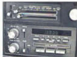
Air conditioning Delco radios