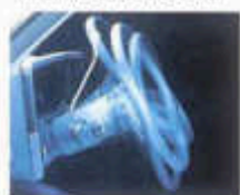
Comfortilt steering wheel