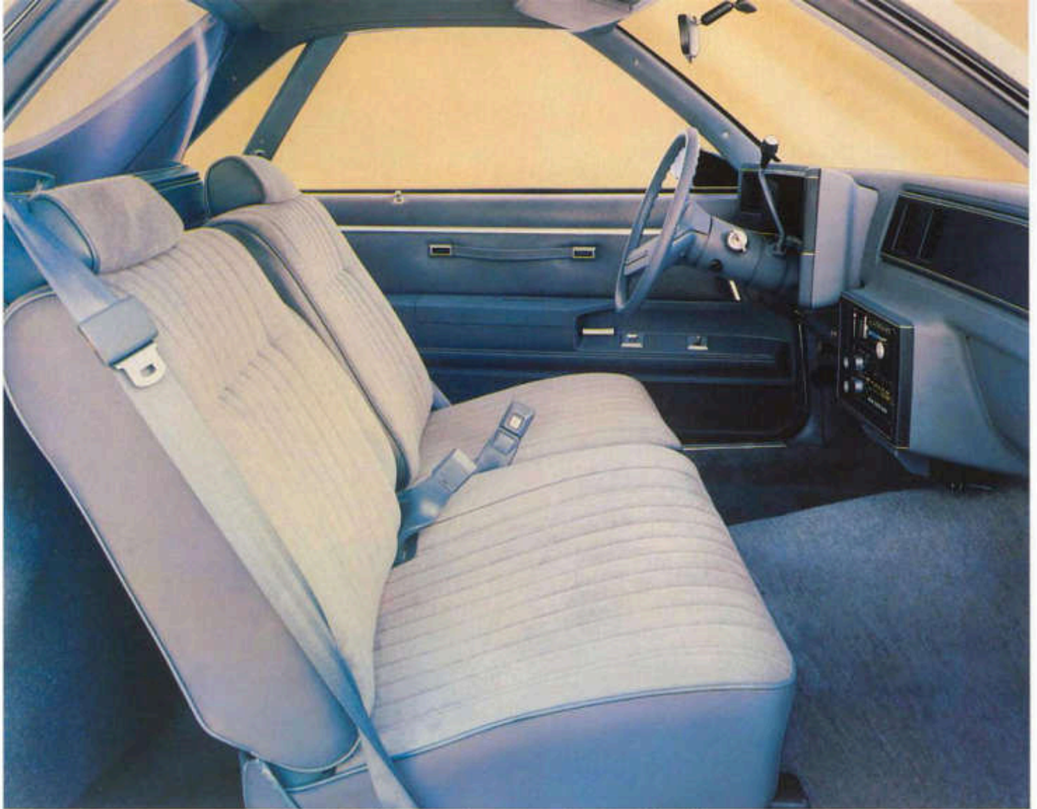
Available 55/45-split bench seat with new knit velour cloth upholstery