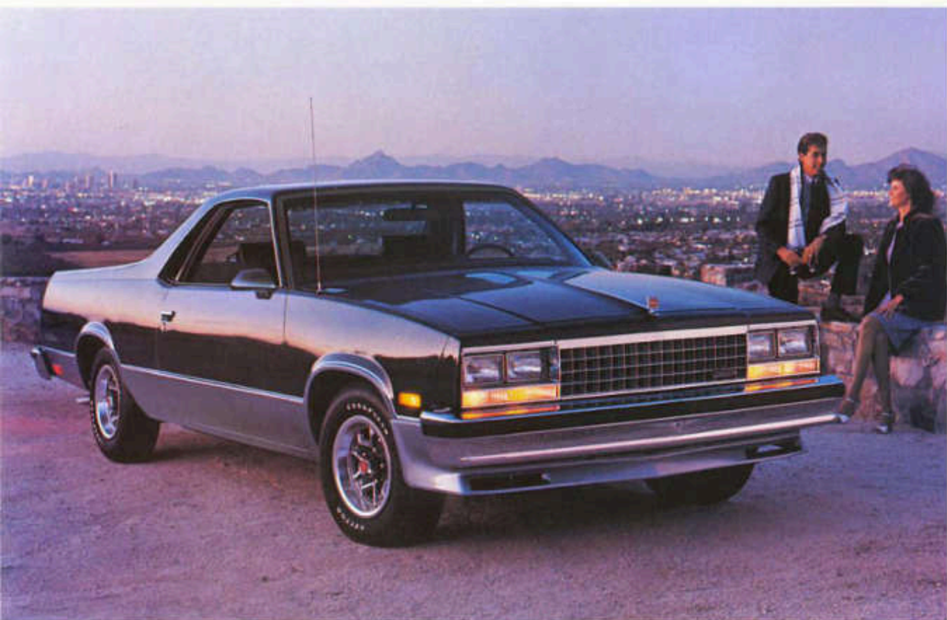
Diablo...dashing, sporty pickup. Tires are supplied by various manufacturers.