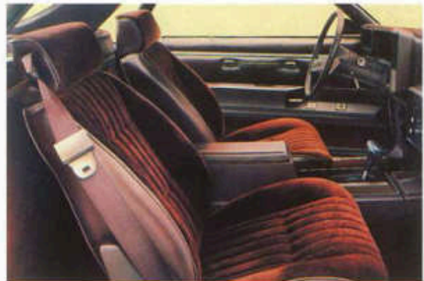
Available high-back bucket seats with new cloth trim. Shown with available new-style center console.

See page 4 for available trim and accessories and back cover for more standard features for Caballero.