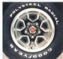
Rally wheels. Tires are supplied by various manufacturers.

New Experience in Sound New Electronically Tuned Receiver (ETR) radios for 1986 have channelized tuning that electronically locks onto the frequency for clear, crisp sound. Some ETR radios include a digital clock which replaces the quartz electric clock formerly available separately. 1986 radios are: AM radio (with or without clock) ETR AM/FM stereo radio with seek/scan (with or without clock) ETR AM/FM stereo radio with seek/scan, stereo cassette tape, and clock (AM stereo/FM stereo unit also available with these features plus search/repeat and graphic equalizer).