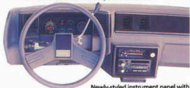
Newly-styled instrument panel with new color-keyed steering wheel