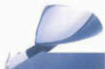
New aerodynamically styled sport mirror with LH remote control

Interior: Cloth-trimmed 55/45-split bench seats Cloth-trimmed high-back bucket seats Bucket seat floor console Power door locks Power windows Color-keyed floor mats Air conditioning Electronic speed control Gage package Tachometer