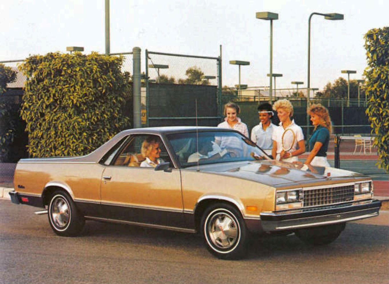
Available Amarillo trim with distinctive two-tone paint