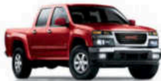
MERLOT JEWEL METALLIC