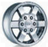
R02 = 16" = CHROME CLAD