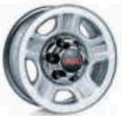
PP3 = 16" = STEEL