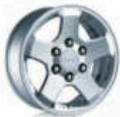
PP2 = 16" = ALUMINUM