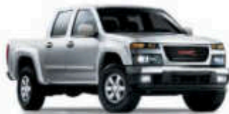
PURE SILVER METALLIC*