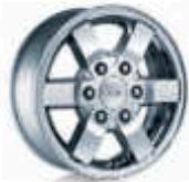
RP1 = 16" = CHROME CLAD