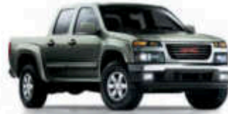
GRAY GREEN METALLIC