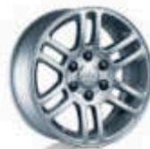
P67 = 18" = ALUMINUM WITH BRIGHT FINISH