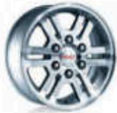
PP1 = 16" = ALUMINUM