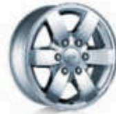
R03 = 17" = CHROME CLAD