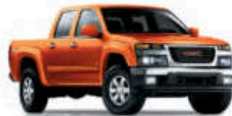
RED-ORANGE METALLIC EXTRA-DUST COLOR