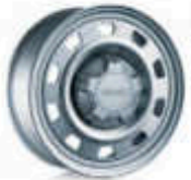
PP4 = 16" = STEEL