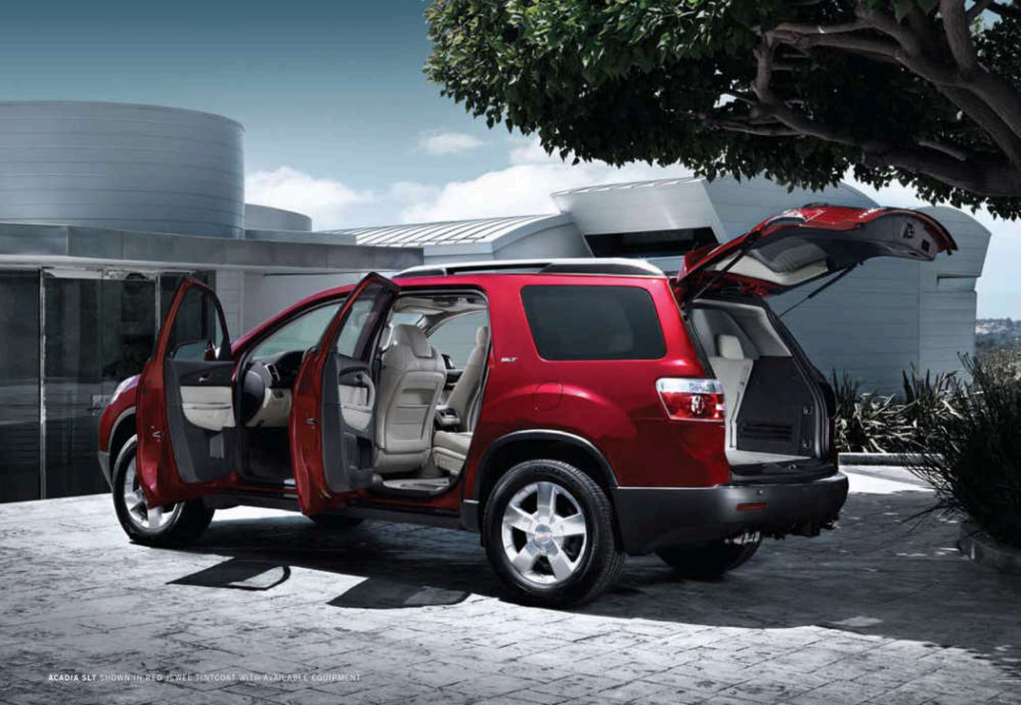
ACADIA SLT SHOWN IN RED JEWEL TINTCOAT WITH AVAILABLE EQUIPMENT