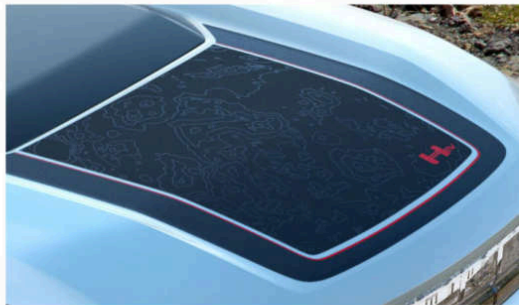
LUNAR MAP HOOD DECAL IN TECH BRONZE [SF8]