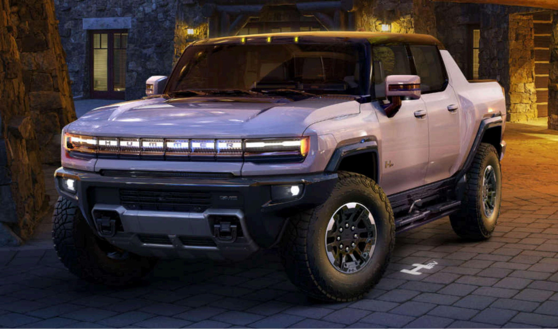
| OUTSIDE REARVIEW MIRROR PROJECTION LIGHTS WITH HUMMER EV LOGO [S30]