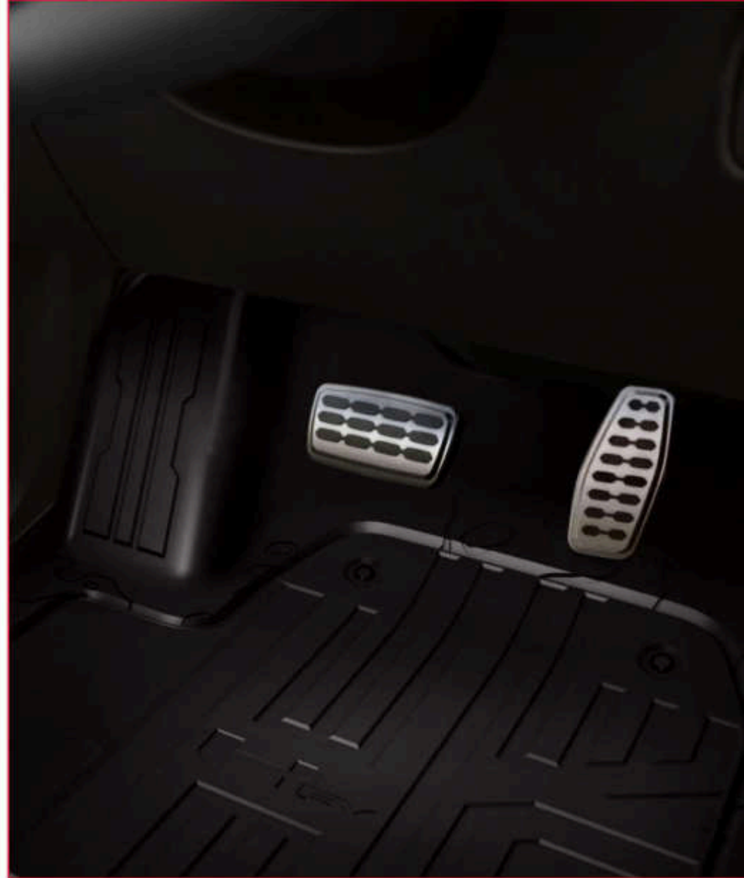
| SPORT PEDAL COVER PACKAGE [SBZ]