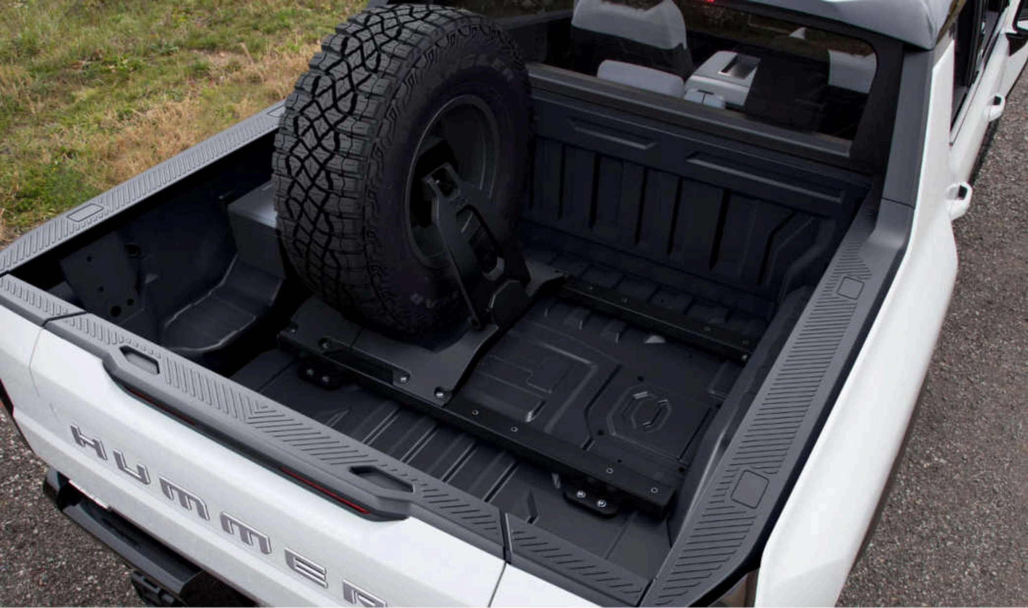
■ BED-MOUNTED VERTICAL SPARE TIRE CARRIER [SEP]