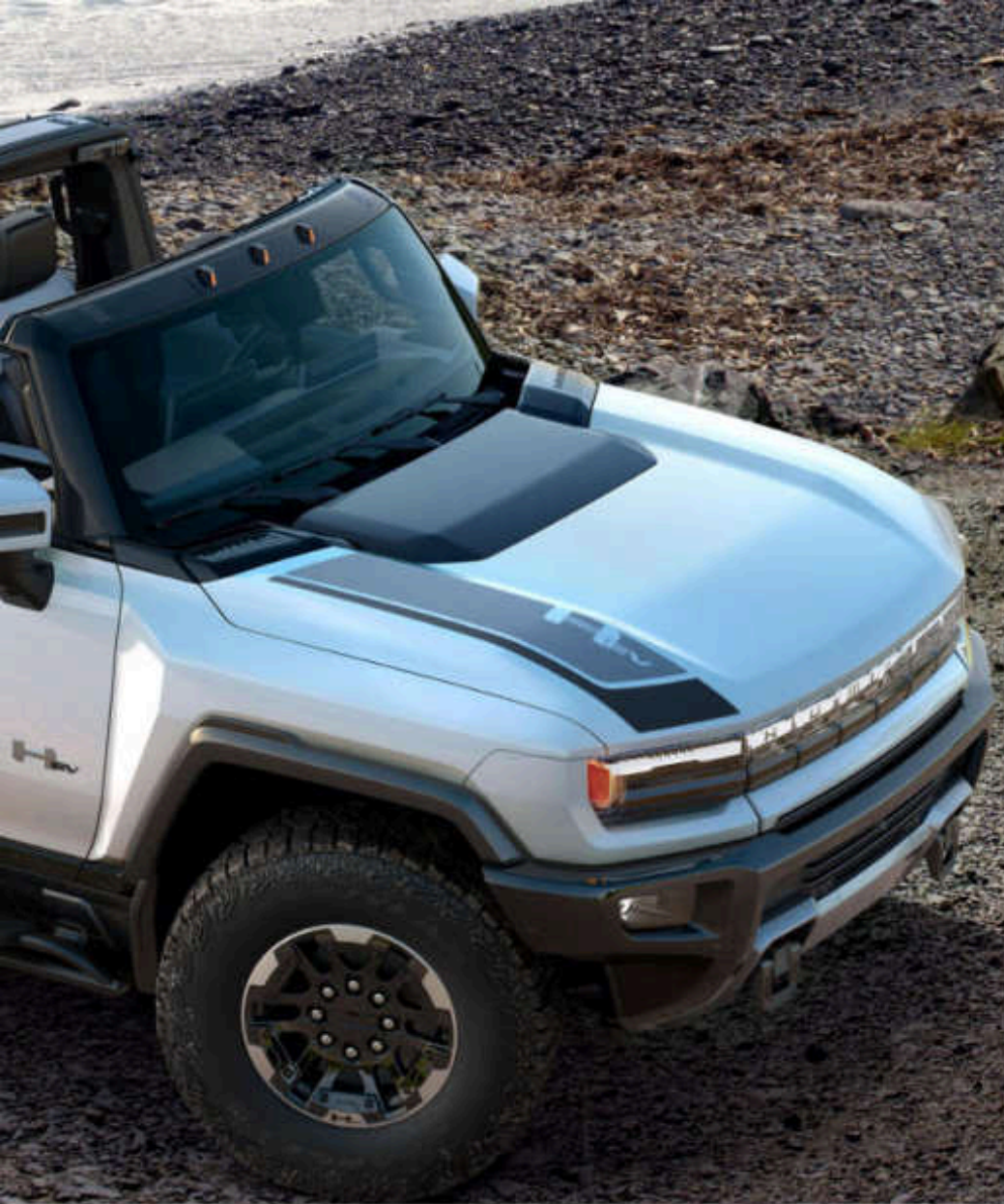
HOOD DECAL IN BLACK WITH HUMMER EV LOGO [SB9]