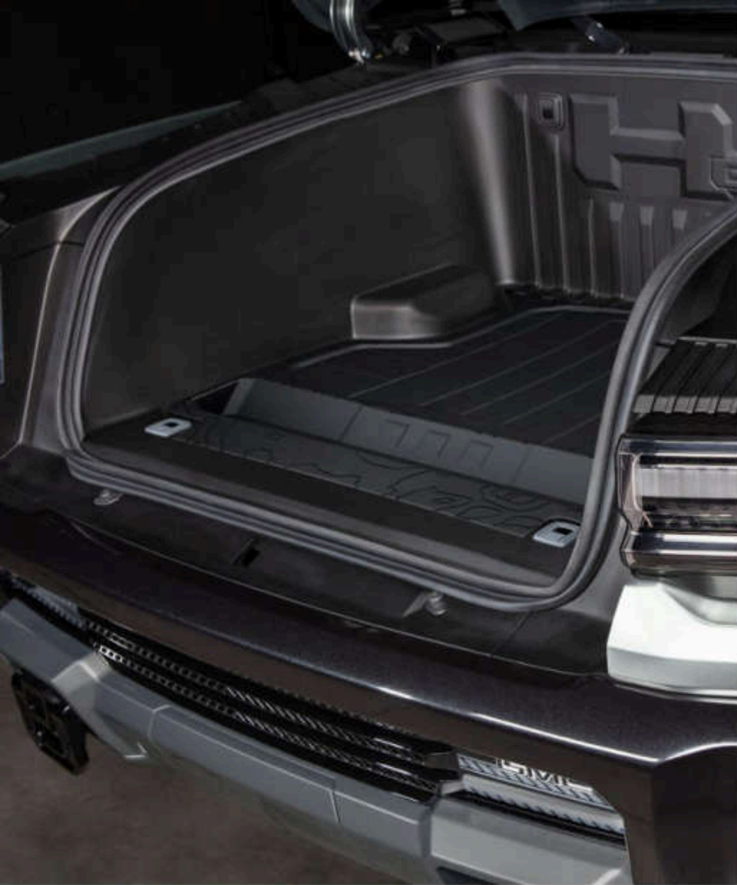
| ALL-WEATHER eTRUNK™ MAT WITH LOGO [VLI]