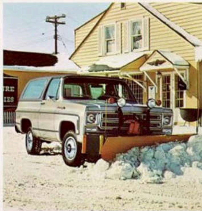
Power take-off with either full-time or conventional four-wheel-drive provides power for utility accessories including rotary brooms and snowplows.

The Jimmy is as wide as a GMC Pickup and the effective load length behind the driver's seat with available rear passenger seat removed is 76.6 inches. Remove the roof (as shown above) and there's room for bulky objects. Your effective load length can be extended by dropping the tailgate which is supported by reel-type cables. Beyond mere cubic capacity, the Jimmy may be ordered with an interior that matches most of your occasions. The single front driver's seat is PLAID patterned vinyl in BLUE, SADDLE, RED or GREEN; an additional matching front passenger bucket seat and a three-passenger rear seat are also available. Deluxe front bucket seats with special all-vinyl trim and center console are also available. High Sierra interiors include color-keyed front compartment carpeting as well as Deluxe bucket seats with console, molded door trim panels with simulated wood grain inserts and stretch vinyl storage pockets. High Sierra also includes a gauge-type instrument cluster with simulated wood grain trim.