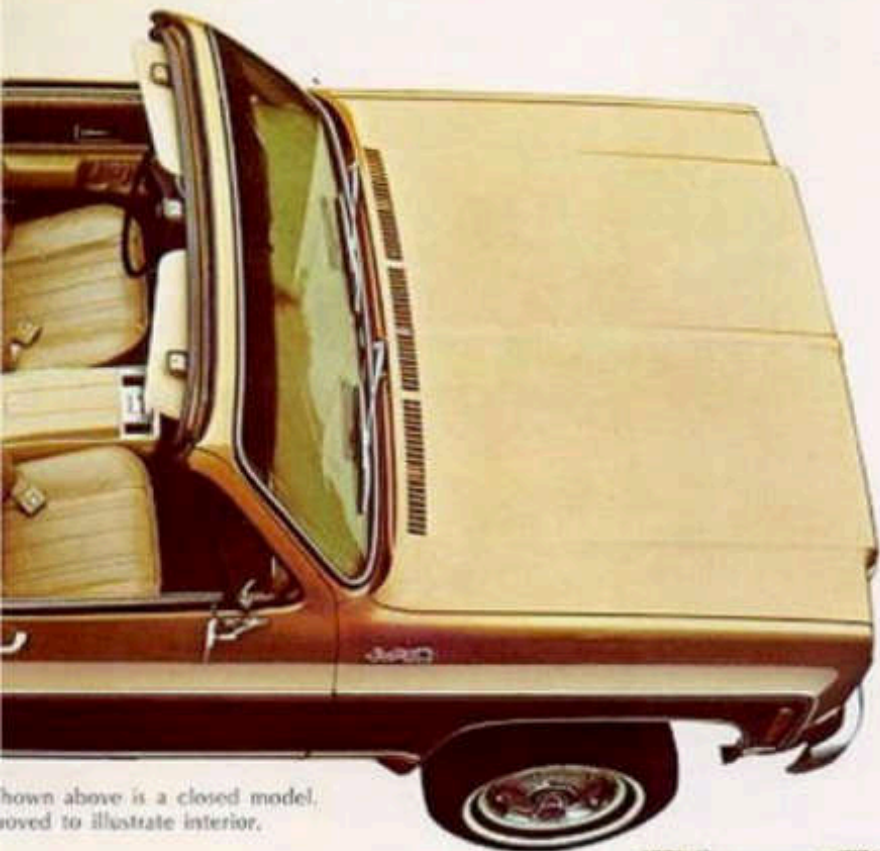
Shown above is a closed model. Moved to illustrate interior.