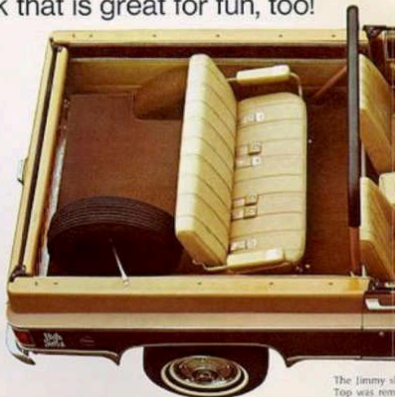
The Jimmy's Top was removed

Jimmy models from GMC, either two- or four-wheel-drive, have a lot of outstanding features to offer a prospective owner. There's a model with a hard top and a model without a top—to fit your need or mood. All with a robust big truck heritage from the Truck People from General Motors and the ability to be many things like a small wrecker, snow plow pusher or roustabout utility vehicle while still being Jimmy.