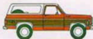
Available Wood-grain Trim