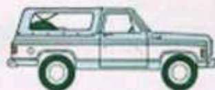
Two-Tone Paint with Available Soft Top

All 1978 Jimmy models include the following General Motors Safety Items as standard equipment. FOR OCCUPANT PROTECTION: Seat belts with push-button buckles at all passenger positions, combination seat and inertia-reel shoulder belts for driver and right front passenger (with reminder light and buzzer), energy absorbing steering column, passenger guard door locks, safety door latches and stamped