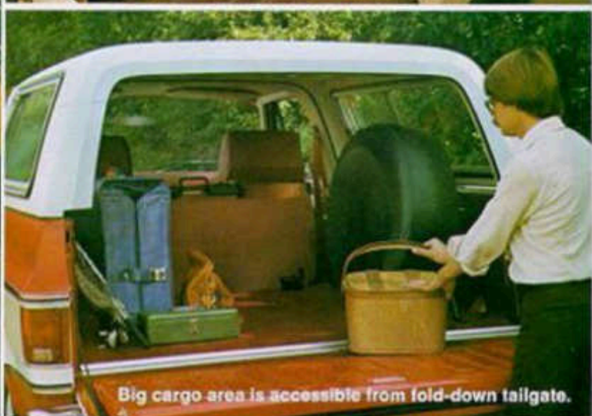
Big cargo area is accessible from fold-down tailgate.

After all sheet metal parts are cleaned and dried, they are primed by immersing the entire body, along with doors and tailgate, in a prime paint emulsion that is electrically charged opposite to the body which coats the metal evenly and completely as it is electromagnetically drawn into the corners and seams of the metal surfaces inside and out. Potentially vulnerable joints are sealed against gathering moisture through the use of sealing compounds. A long-lasting acrylic enamel is used for finish painting. For added protection in certain enclosed areas, an alumi-