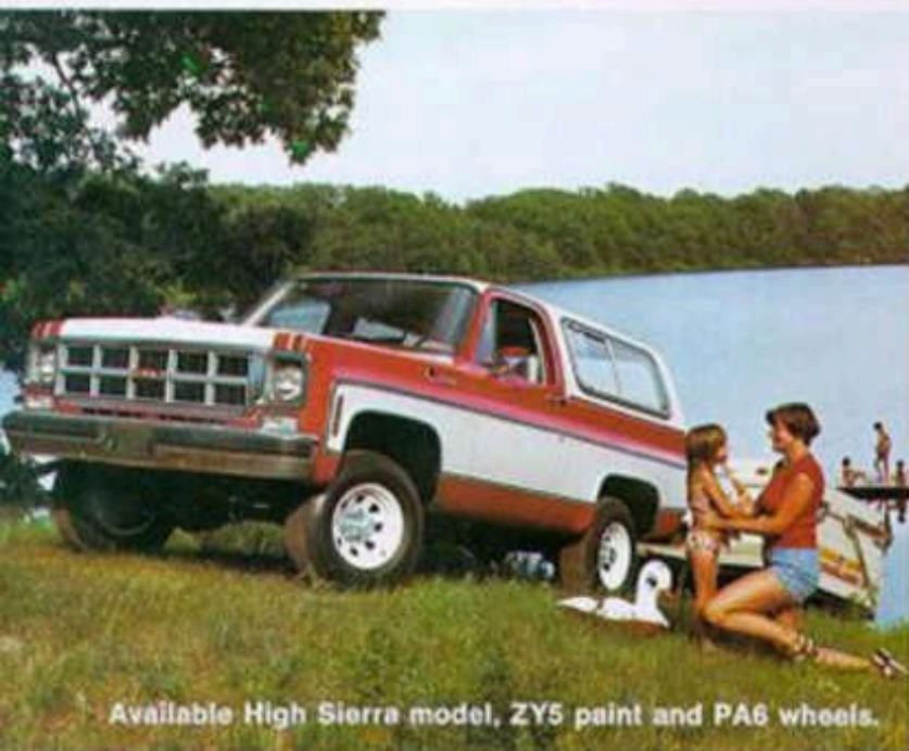
Available High Sierra model, ZY5 paint and PA6 wheels.

interior, shown below, includes new high back bucket-type seats in handsome Saddle custom cloth and vinyl trim. (All-vinyl open high-grain trim also is available.) Both custom cloth and vinyl and all-vinyl seats come in Blue, Buckskin and Red colors with Red being a new offering for the cloth and vinyl trim. Mandarin Orange is also available for the all-vinyl trim. The wall-to-wall floor covering is color keyed and extends to the rear, including wheelhousings, when the new available fold-up rear passenger seat is ordered.