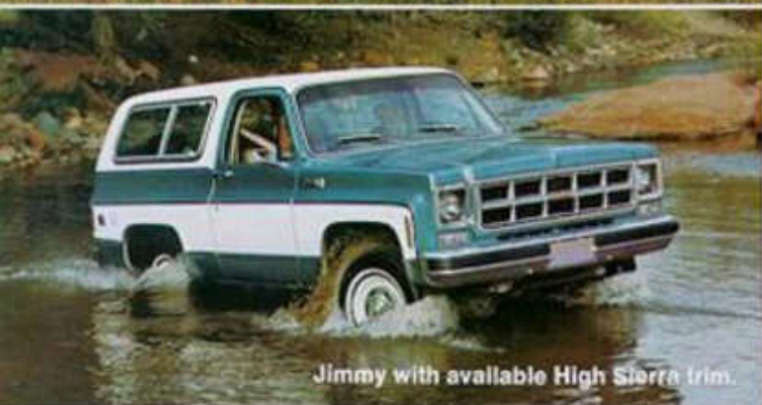
Jimmy with available High Sierra trim.