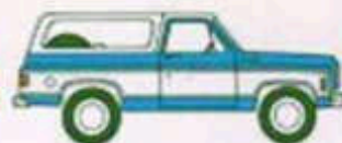
Two-Tone Paint with White Hardtop