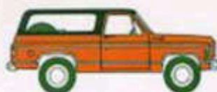
Solid Paint with Black Hardtop