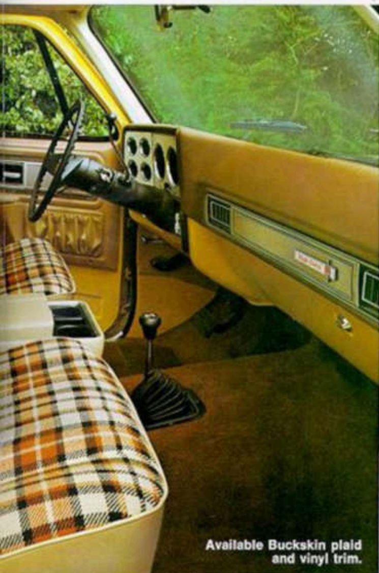
Available Buckskin plaid and vinyl trim.

driving conditions change. All 4-wheel drive controls are conveniently located inside the cab. With Jimmy's full-time system there's a combination of balanced traction and driving power delivered to both axles that lets you operate on paved and unpaved roads under varying conditions and off road as well — all without having to change back and forth between 2-wheel and 4-wheel drive.