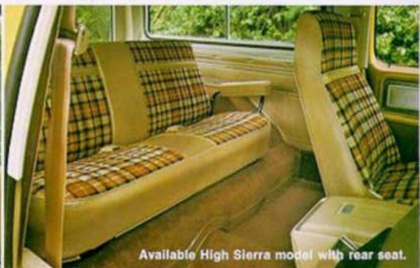
Available High Sierra model with rear seat.