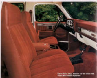
Sierra Classic with vinyl trim with full leather interior trim with plastic trim