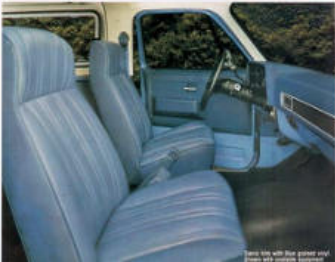
Sierra Classic with full leather interior trim with plastic trim