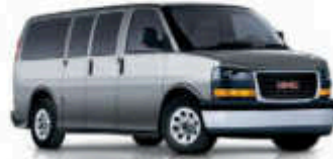
STEEL GRAY METALLIC EXTRA-COST COLOR