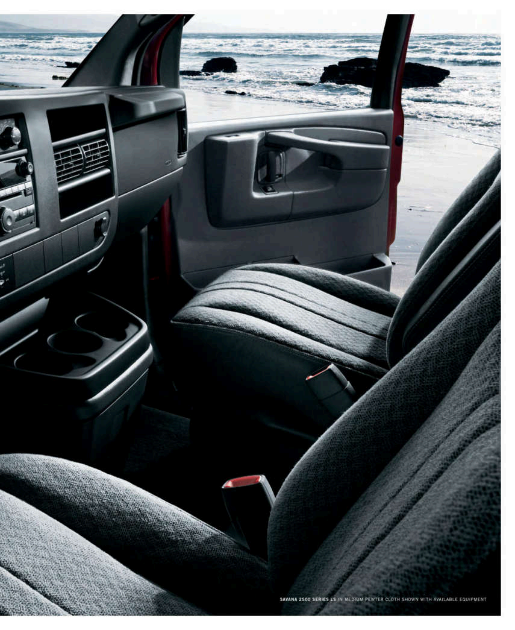
SAVANA 2500 SERIES LS IN MEDIUM PEWTER CLOTH SHOWN WITH AVAILABLE EQUIPMENT