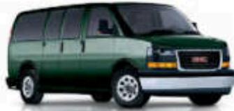
POLO GREEN METALLIC EXTRA-COST COLOR