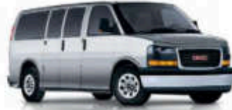
PURE SILVER METALLIC EXTRA-COST COLOR