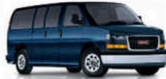
DEEP BLUE METALLIC EXTRA-COST COLOR