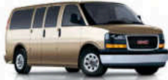
SAND BEIGE METALLIC EXTRA-COST COLOR