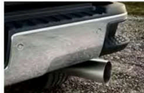
CORNERSTEP REAR BUMPER