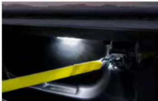
AVAILABLE UNDER-RAIL BOX LIGHTS