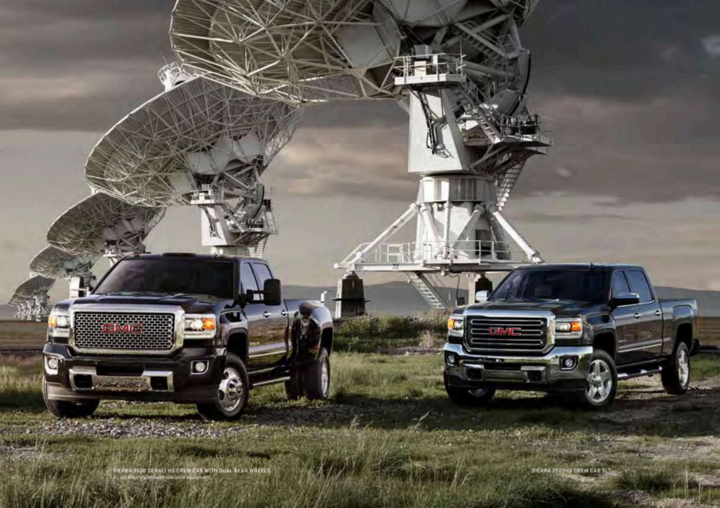
SIERRA 3500 DENALI HD CREW CAB WITH DUAL REAR WHEELS All vehicles shown with available equipment.