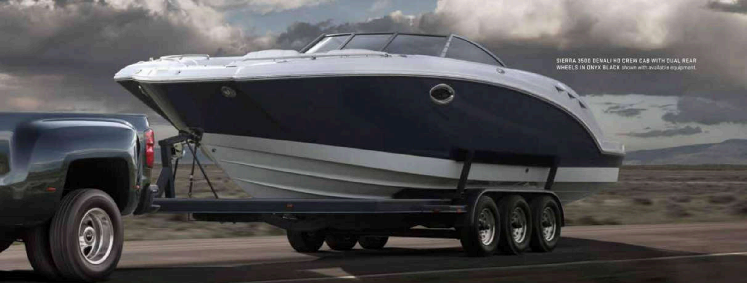
SIERRA 3500 DENALI HD CREW CAB WITH DUAL REAR WHEELS IN ONYX BLACK shown with available equipment.