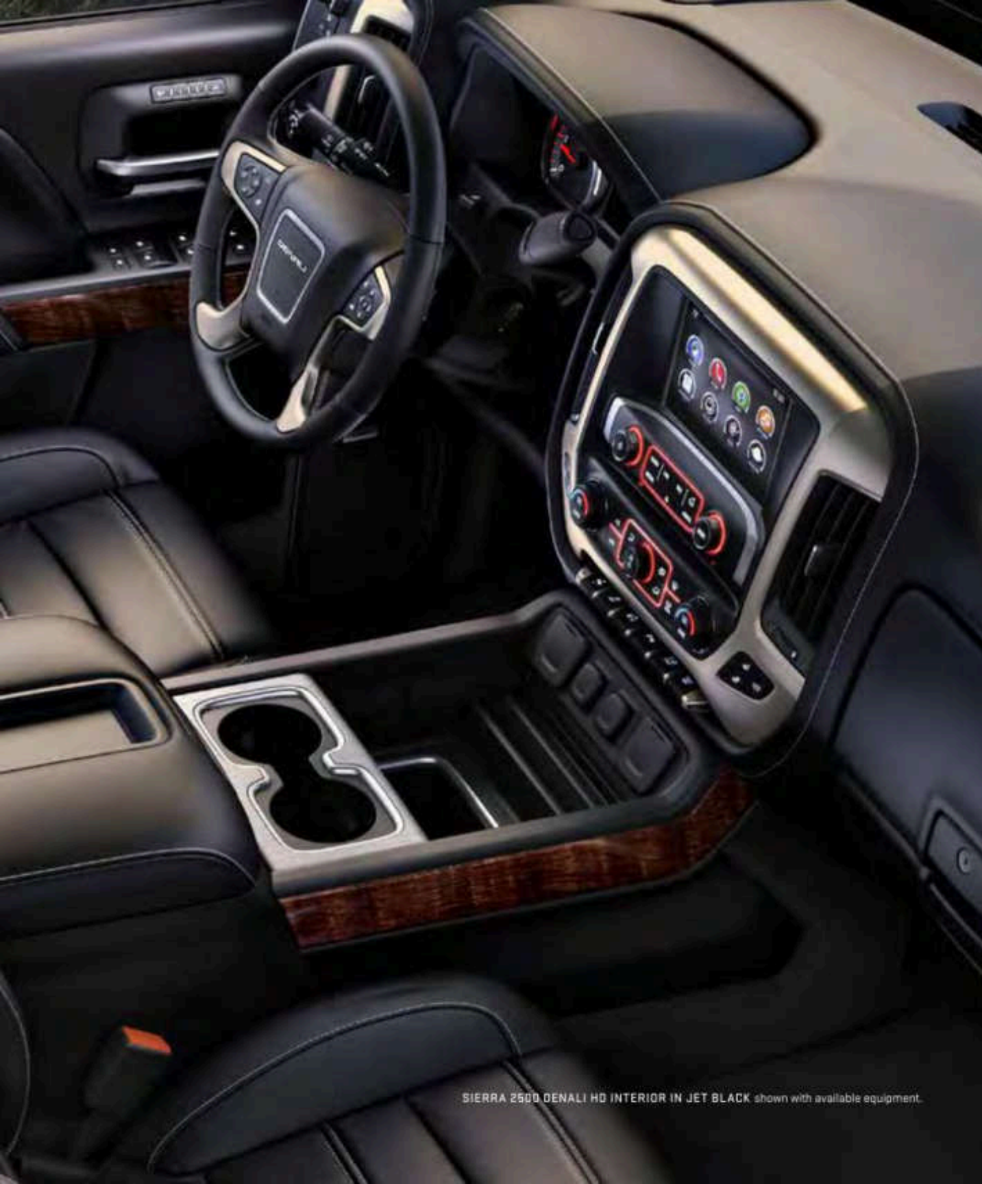
SIERRA 2500 DENALI HD INTERIOR IN JET BLACK shown with available equipment.