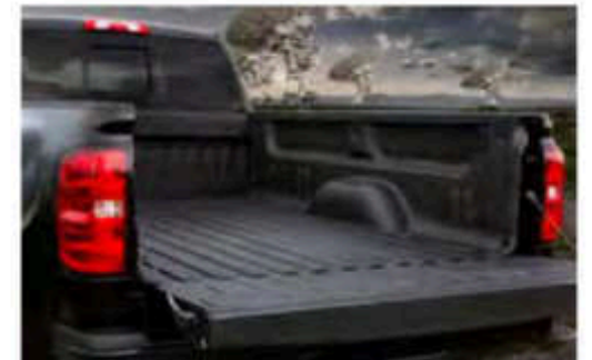
AVAILABLE EZ-LIFT AND LOWER TAILGATE