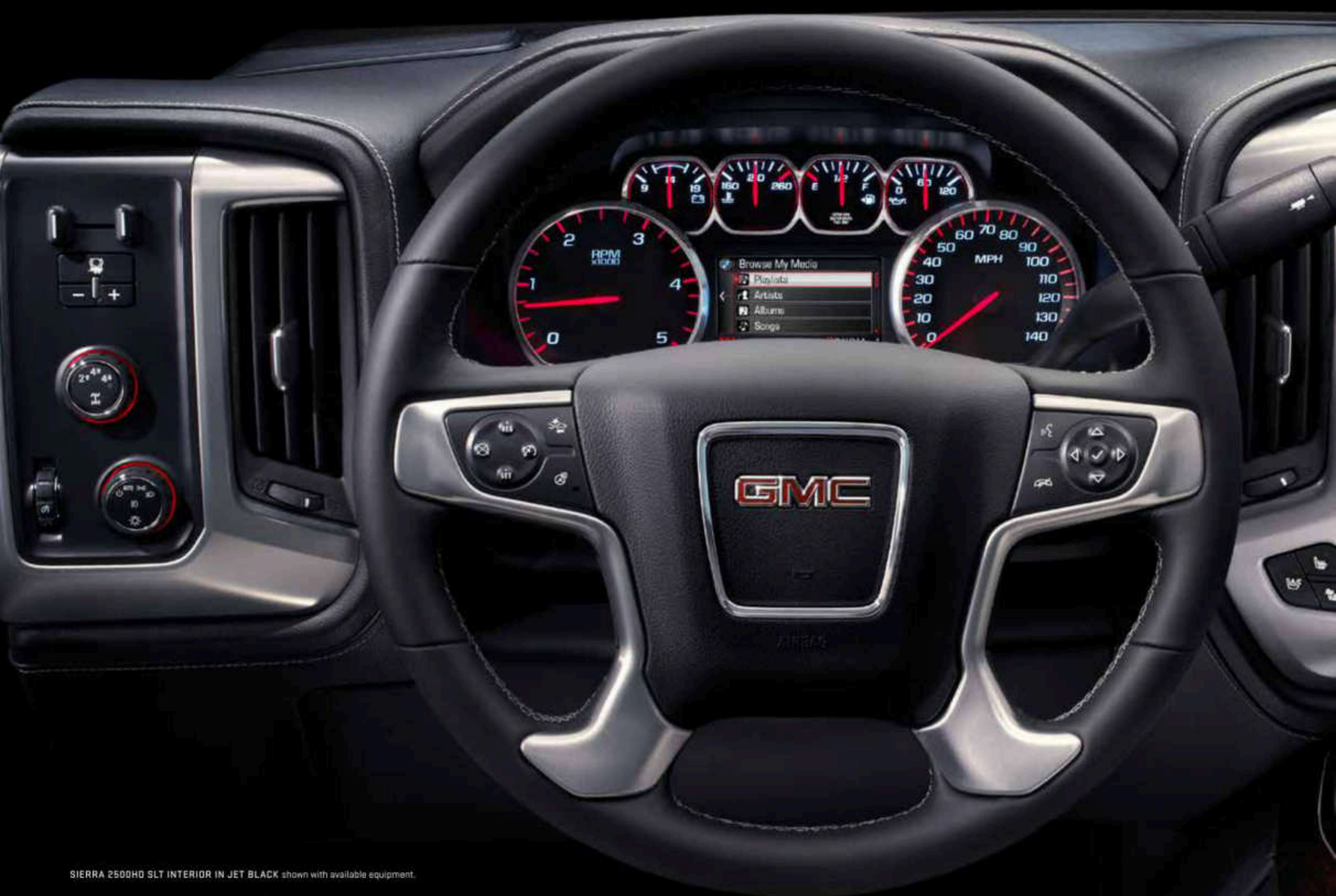
SIERRA 2500HD SLT INTERIOR IN JET BLACK shown with available equipment.