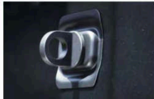
UPPER MOVABLE TIE-DOWN HOOKS