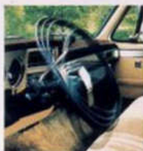
Comfortilt steering wheel