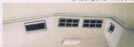
Rear air conditioning (requires front air conditioning)