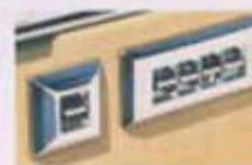
Power door locks and/or power windows