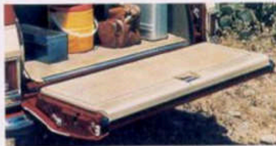
Wagon-type tailgate offers available power drop glass, with or without electric defogger.