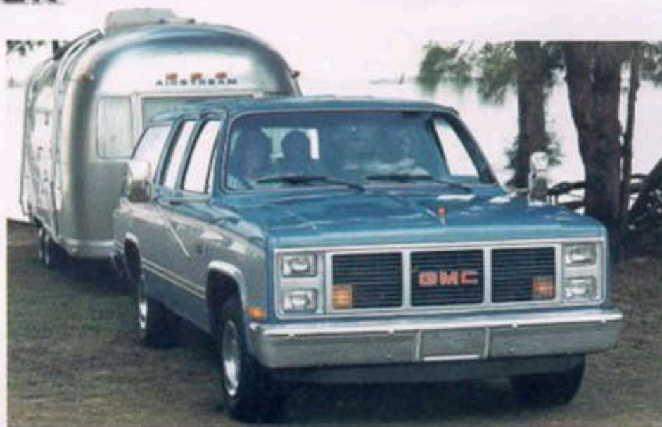
C-2500 Suburban with 7.4 Liter V8 gas engine is in a trailering class by itself! (See below)