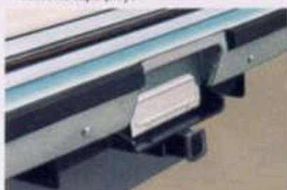
Platform trailer hitch (requires Trailering Special Equipment)