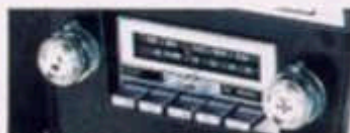
Delco radios: AM, AM/FM, AM/FM stereo, AM/FM stereo with cassette tape player