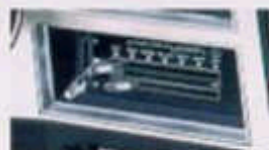
Front air conditioning