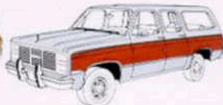
Available Exterior Decor Package