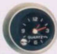
Quartz electric clock