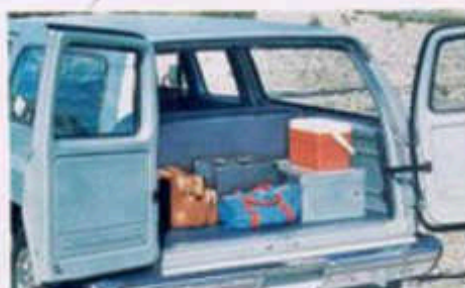
Panel type rear doors have fixed, tinted glass; opening is 37" high by 59.6" wide. Power door lock available.