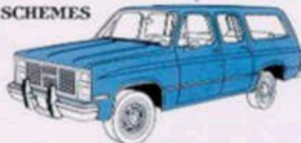
Standard Solid Paint Scheme