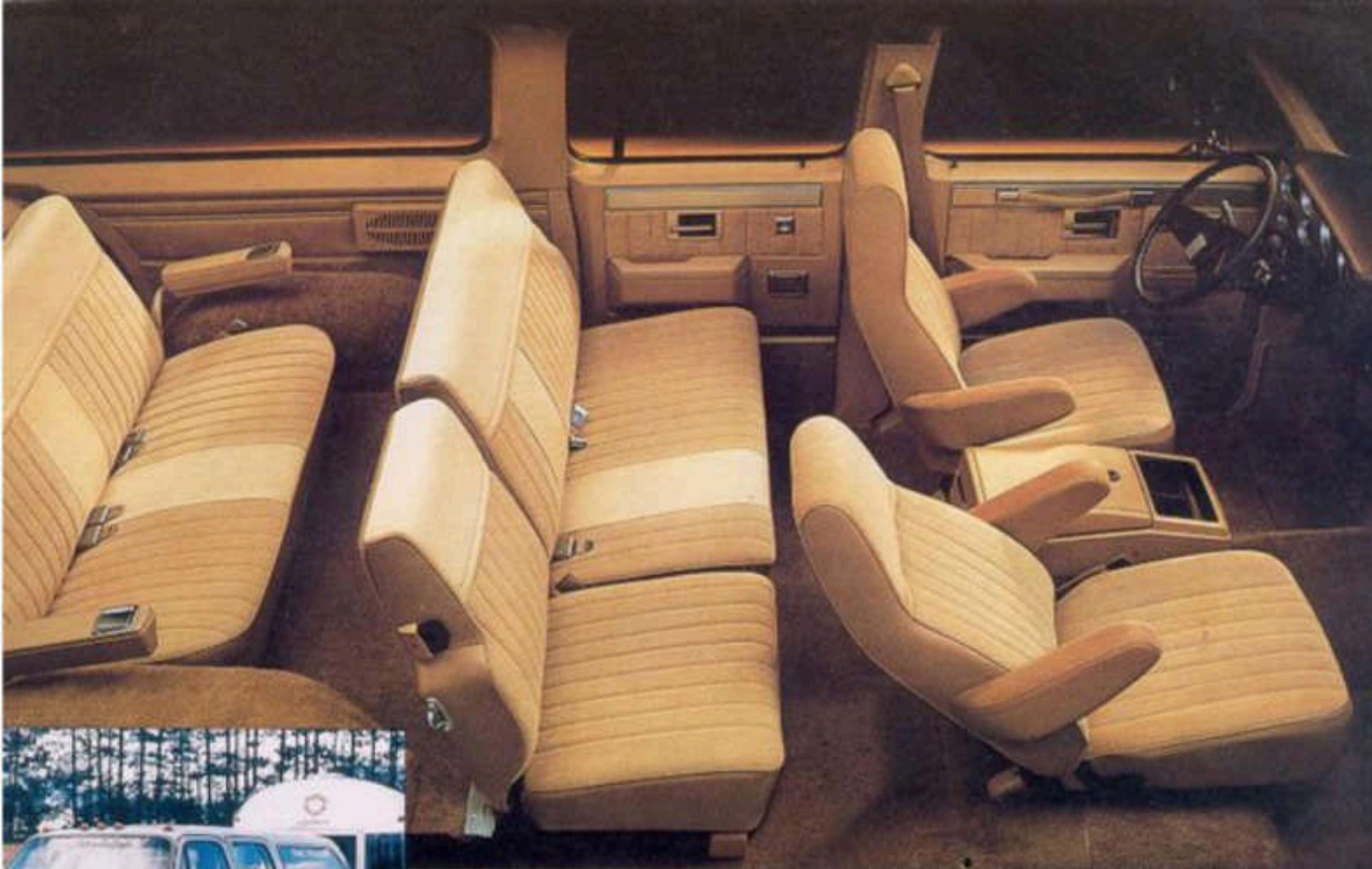
Sierra Classic with available seating