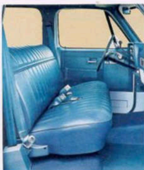
Sierra standard interior comes in Blue or Saddle Tan vinyl.

Beginning September, 1985 nearly 200 senior North Americans are planning to travel the backroads of mainland China on an unprecedented international friendship mission driving GMC Truck Suburbans pulling Airstream trailers.