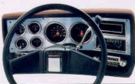
Sierra Classic instrument cluster with needle-type gauges for voltmeter, temperature, and oil pressure