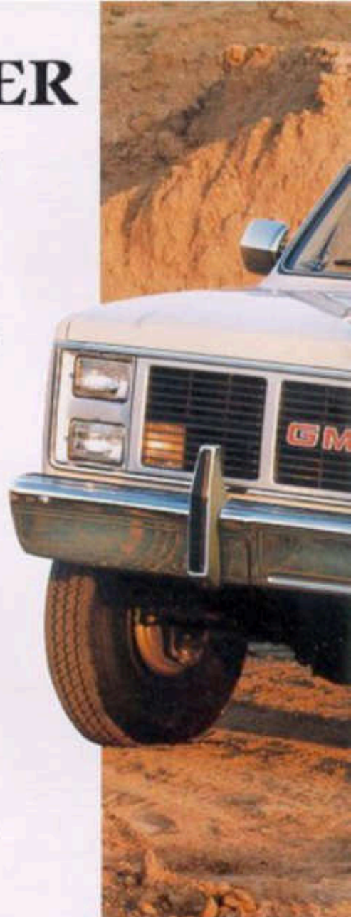
Sierra Classic 4-WD Suburban with exterior decor package and other available equipment

GMC anti-corrosion treatments use rust-resistant steels for many parts of the body and sheet metal. In addition, special Elpo-Dip priming coats the entire body. To ward off contaminants, aluminum wax preservative and special sealers are used in critical areas. A special sprayed-on anti-chip coating on lower body areas precedes the finish paint coat of baked-on lustrous acrylic enamel.