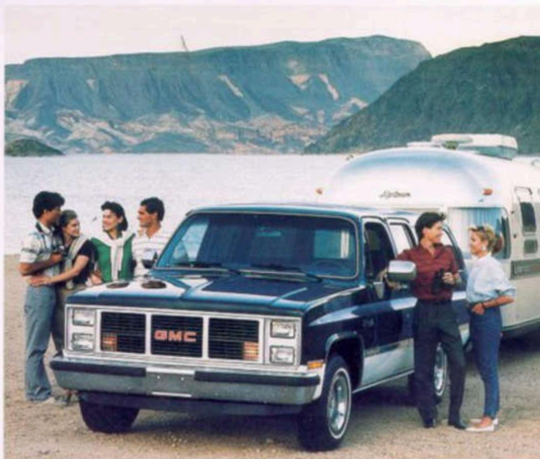
Sierra Classic Suburban with available equipment