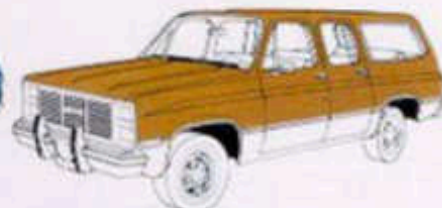
Available Special Two-Tone