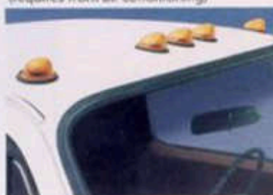
Roof marker lamps