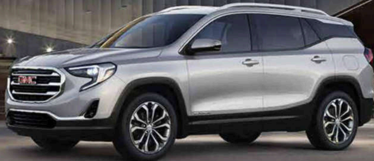
TERRAIN SLT IN QUICKSILVER METALLIC shown with available equipment.

Mighty defeats size. It conquers the odds. Mighty is how pros perform. The all-new 2018 Terrain is the compact SUV reimagined with you in mind. Expressive design, relentless engineering and purposeful technologies are the latest reminders that the same passion and purpose that drive you also drive us. We're setting our own standards and proving that Professional Grade isn't merely a label, it's a way of life. Terrain is the newest example that we're all pros. We take a bold, mighty stance for what we believe in and pursue it like a pro.