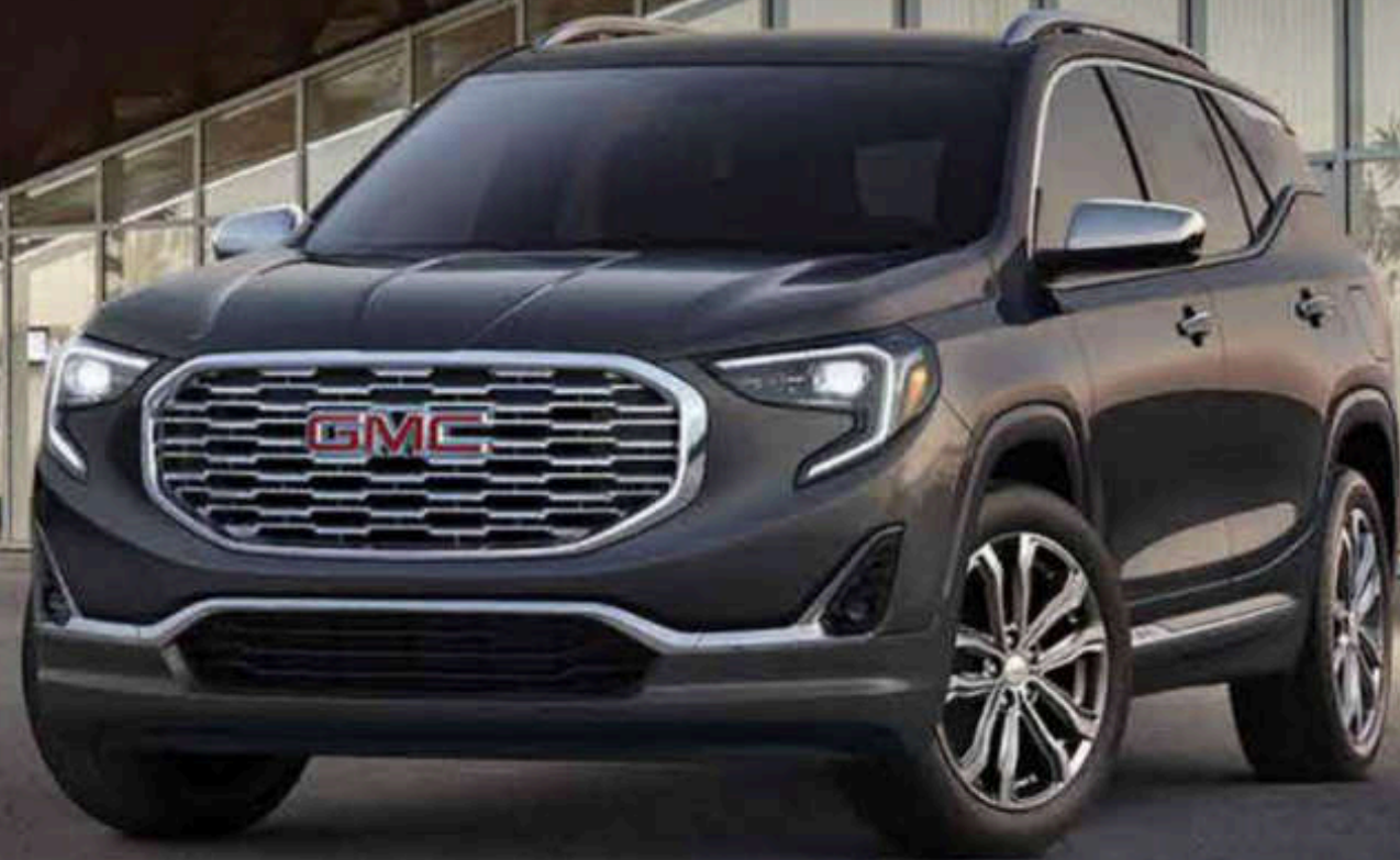
TERRAIN DENALI IN GRAPHITE GRAY METALLIC shown with available equipment.

Preproduction models shown throughout. Actual production models may vary.