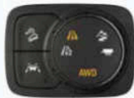
TRACTION SELECT SYSTEM