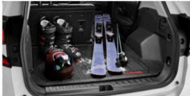
INTEGRATED CARGO LINER WITH GMC EMBLEM