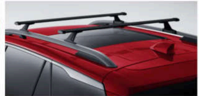
ROOF RACK CROSSRAIL PACKAGE IN BLACK