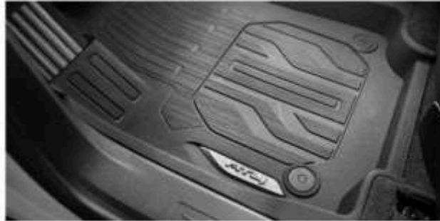
PREMIUM ALL-WEATHER FLOOR LINERS