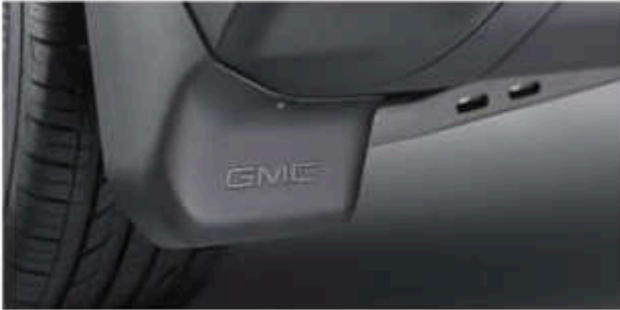
REAR SPLASH GUARD IN BLACK