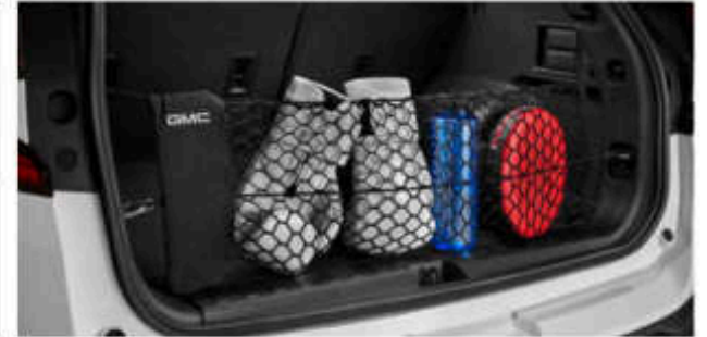
VERTICAL CARGO NET