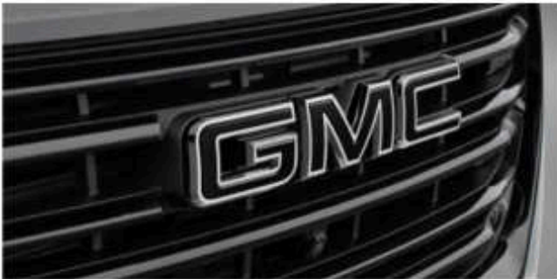
GMC EMBLEM IN BLACK