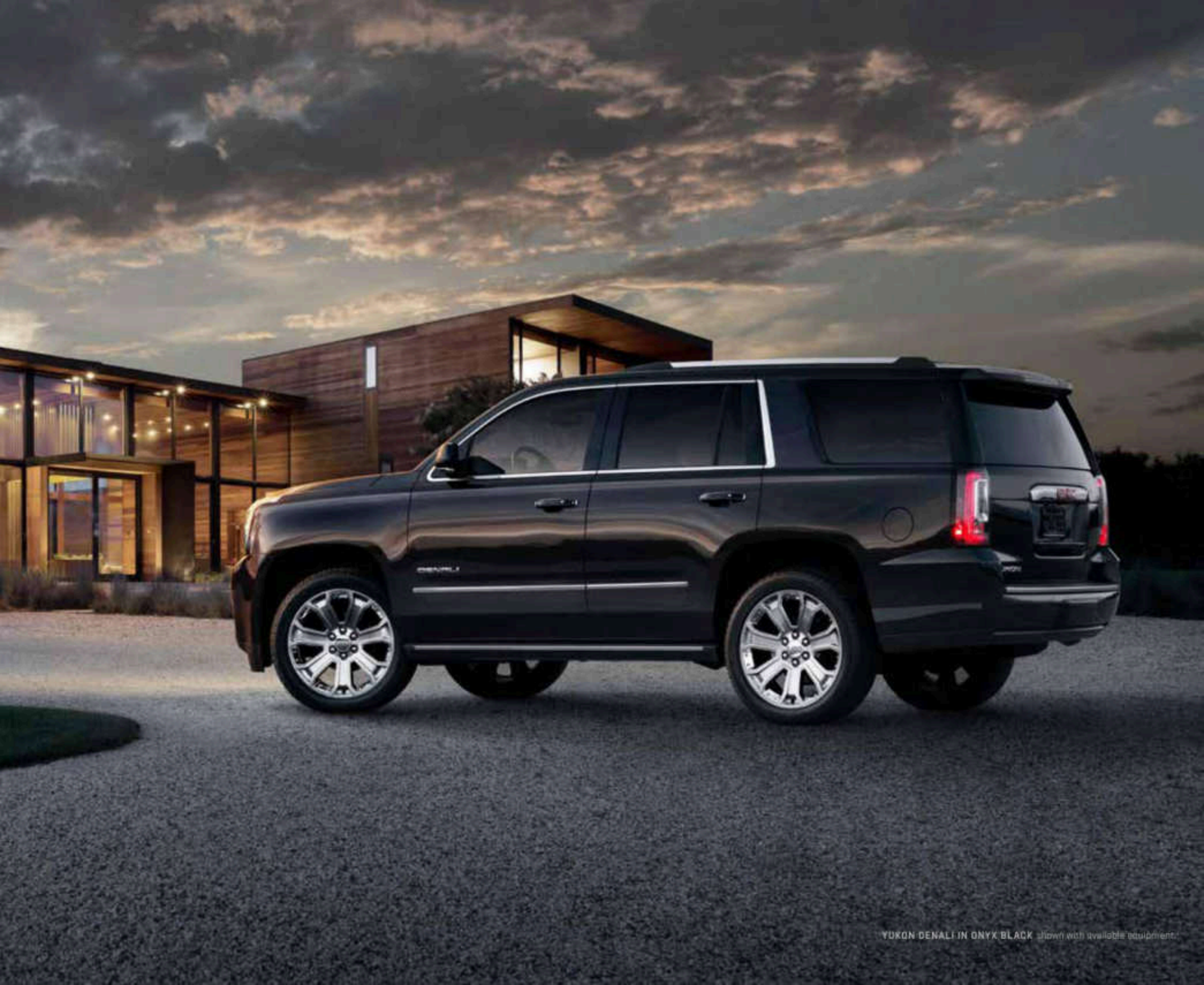
YUKON DENALI IN ONYX BLACK shown with available equipment.