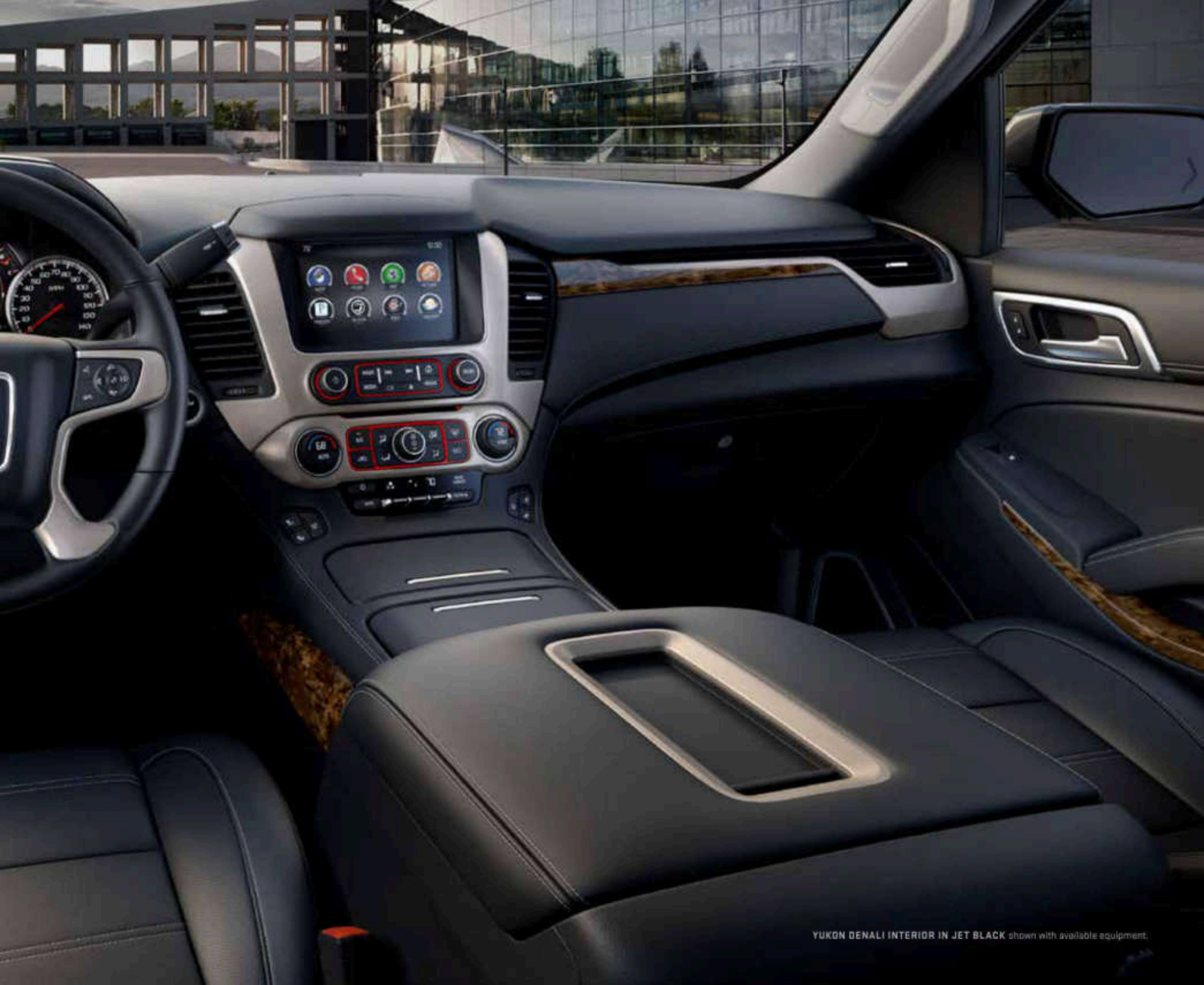
YUKON DENALI INTERIOR IN JET BLACK shown with available equipment.