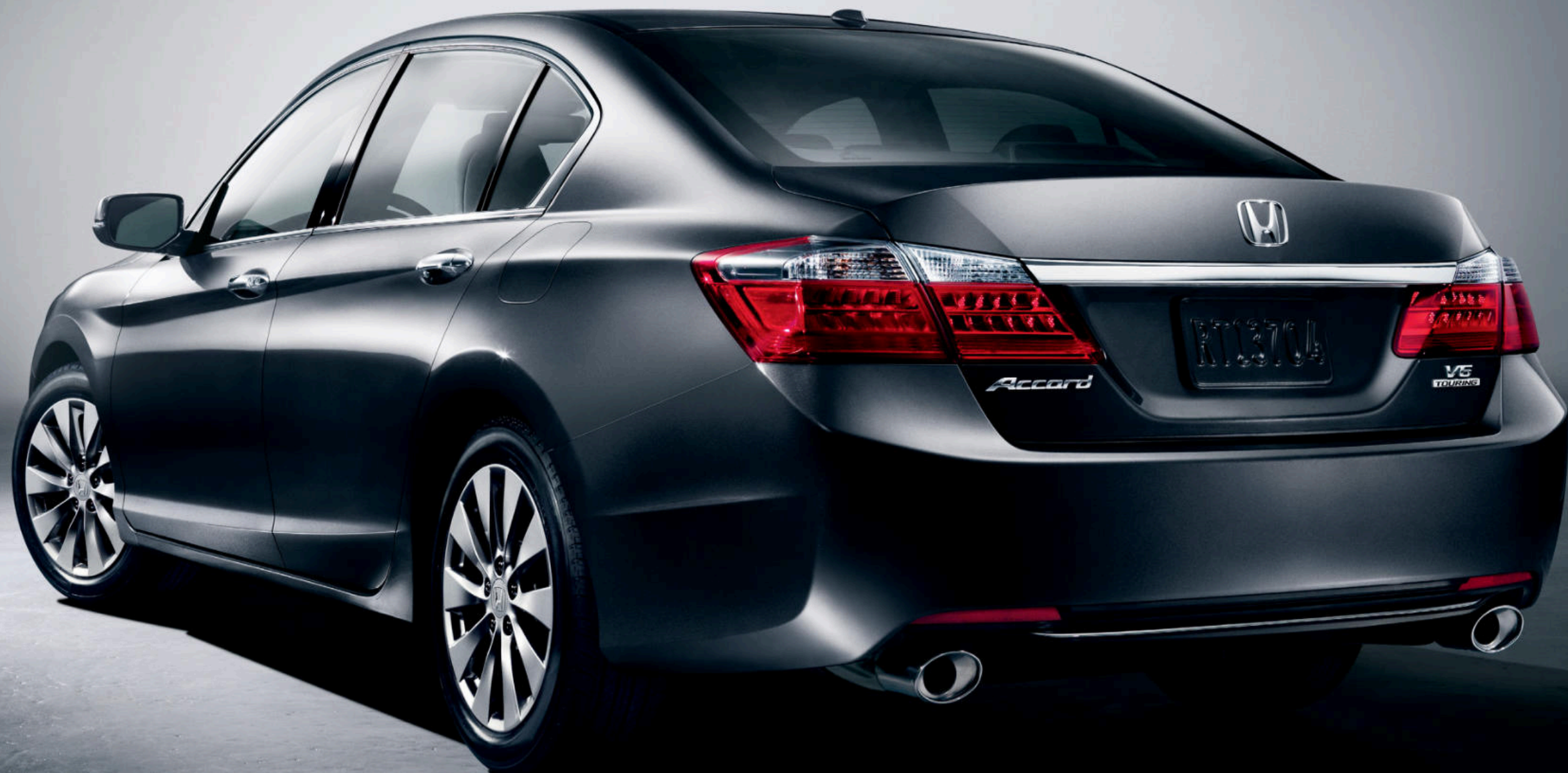
Accord Touring Sedan shown in Modern Steel Metallic.