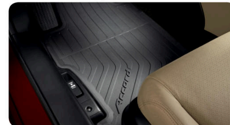
ALL-SEASON FLOOR MATS