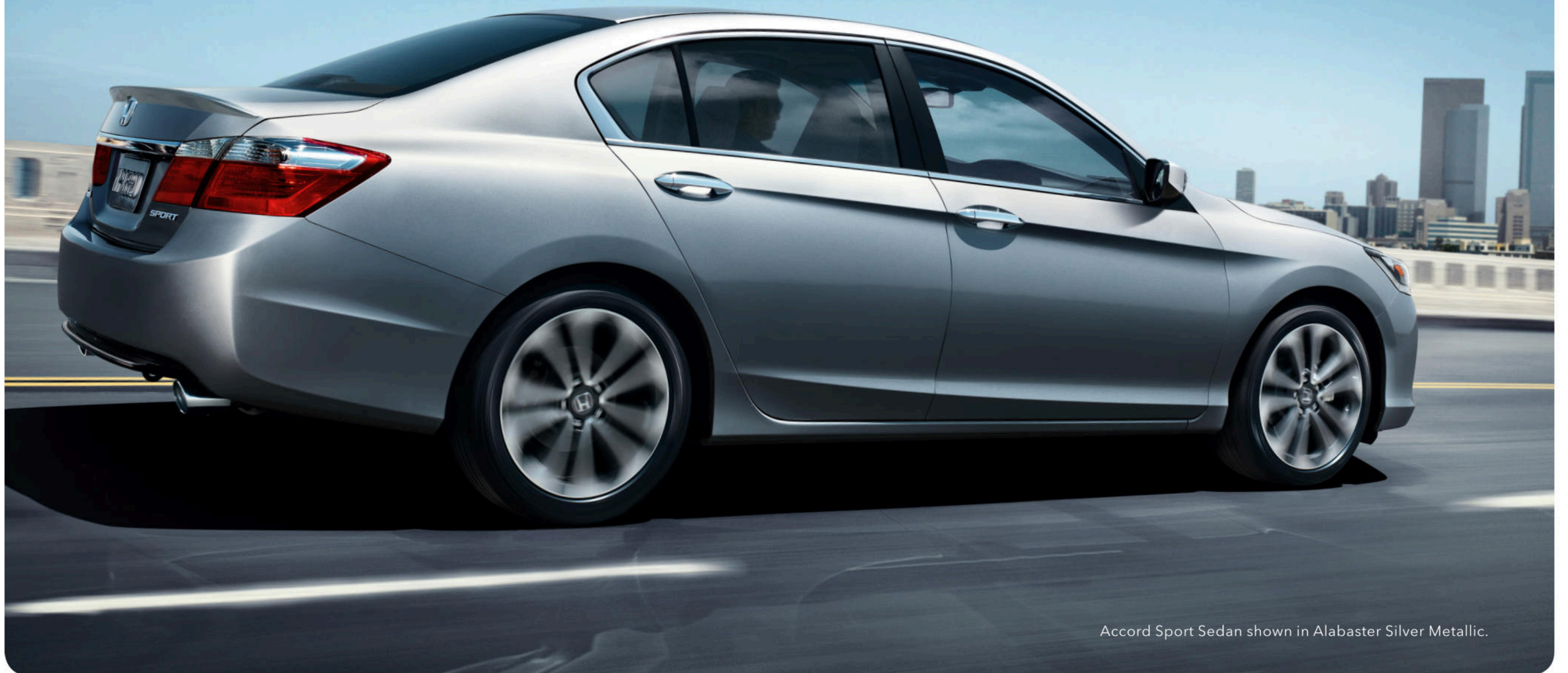
Accord Sport Sedan shown in Alabaster Silver Metallic.

How about an Accord with a little more attitude? Discover the Accord Sport Sedan. It features all the little details you love that make a big difference on the road. Like 18-inch alloy wheels, fog lights, a decklid spoiler and a dual exhaust system. On the inside, paddle shifters (with CVT) and a 10-way power driver's seat make any drive that much better.