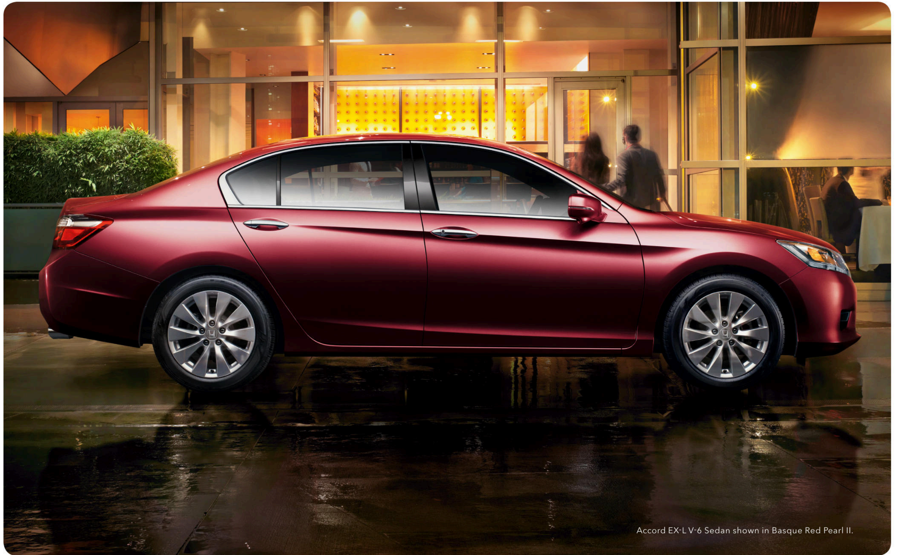
Accord EX-L V-6 Sedan shown in Basque Red Pearl II.