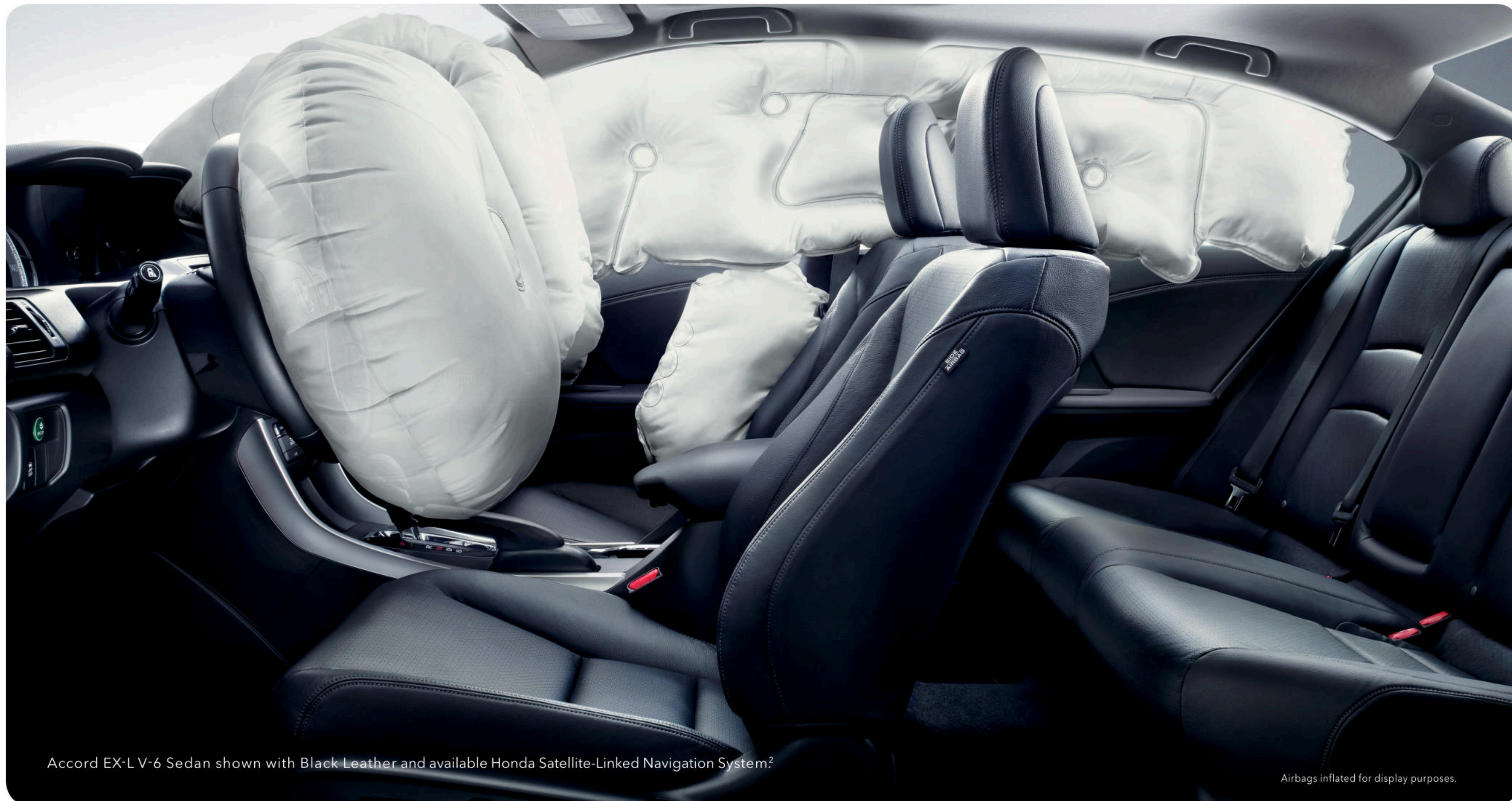
Accord EX-L V-6 Sedan shown with Black Leather and available Honda Satellite-Linked Navigation System. 2