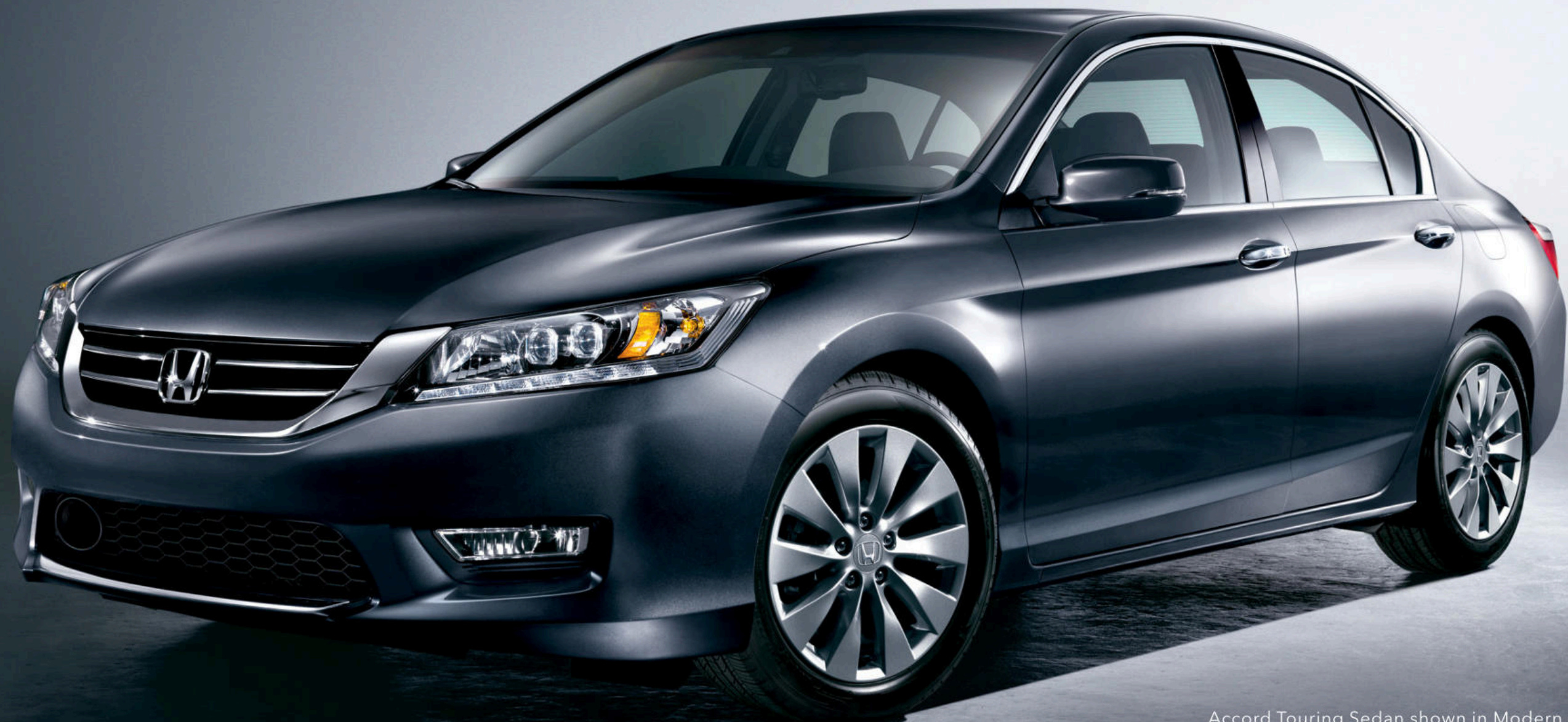
Accord Touring Sedan shown in Modern Steel Metallic.

When does a car become more than just a car? That question has inspired us from the beginning, and for over three decades, the Accord has been our answer. Now in its ninth generation, our signature vehicle continues to evolve with drivers and all of their humanity in mind. And the relationship between an Accord and its owner continues to be something very special.