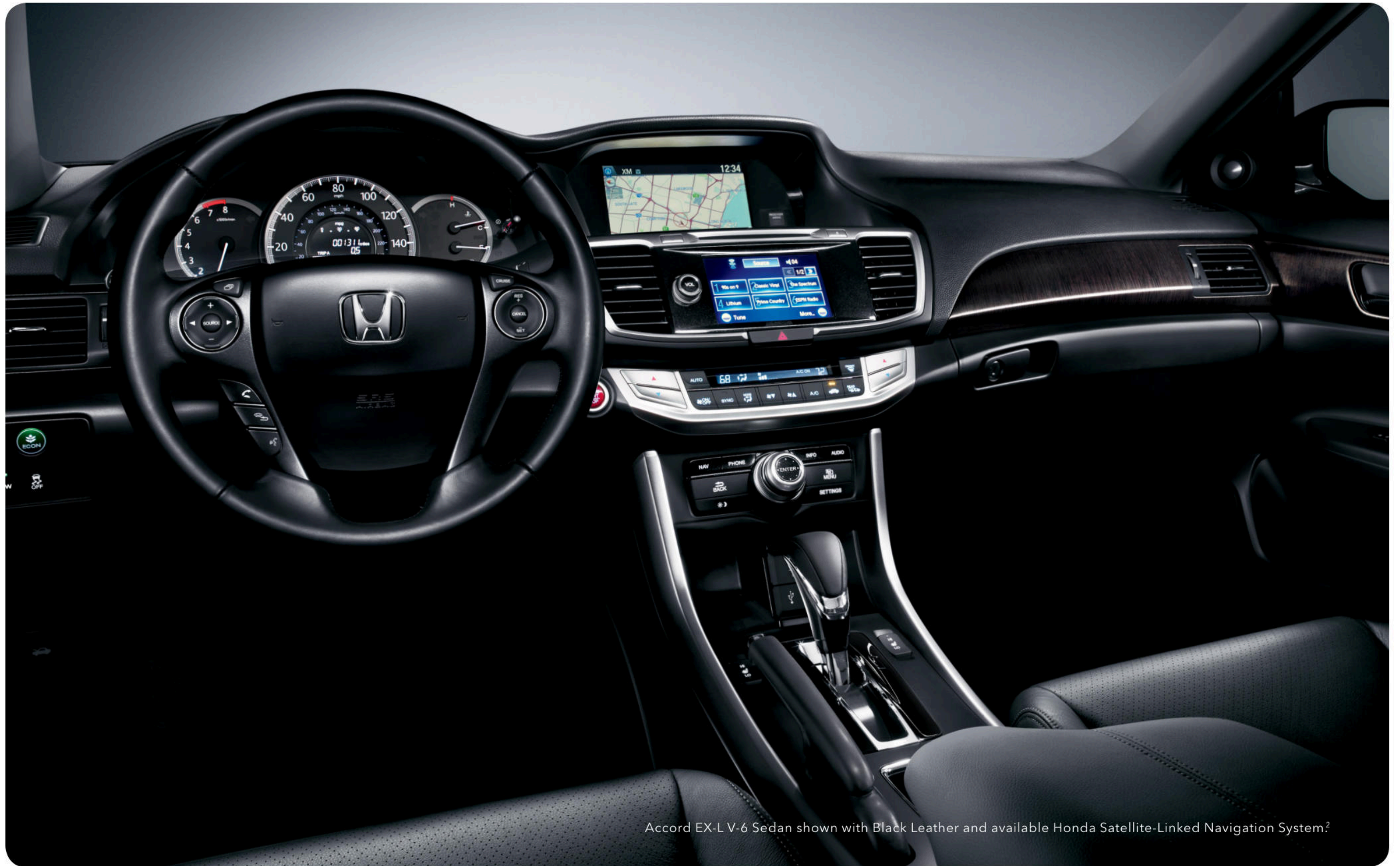
Accord EX-L V-6 Sedan shown with Black Leather and available Honda Satellite-Linked Navigation System. 2