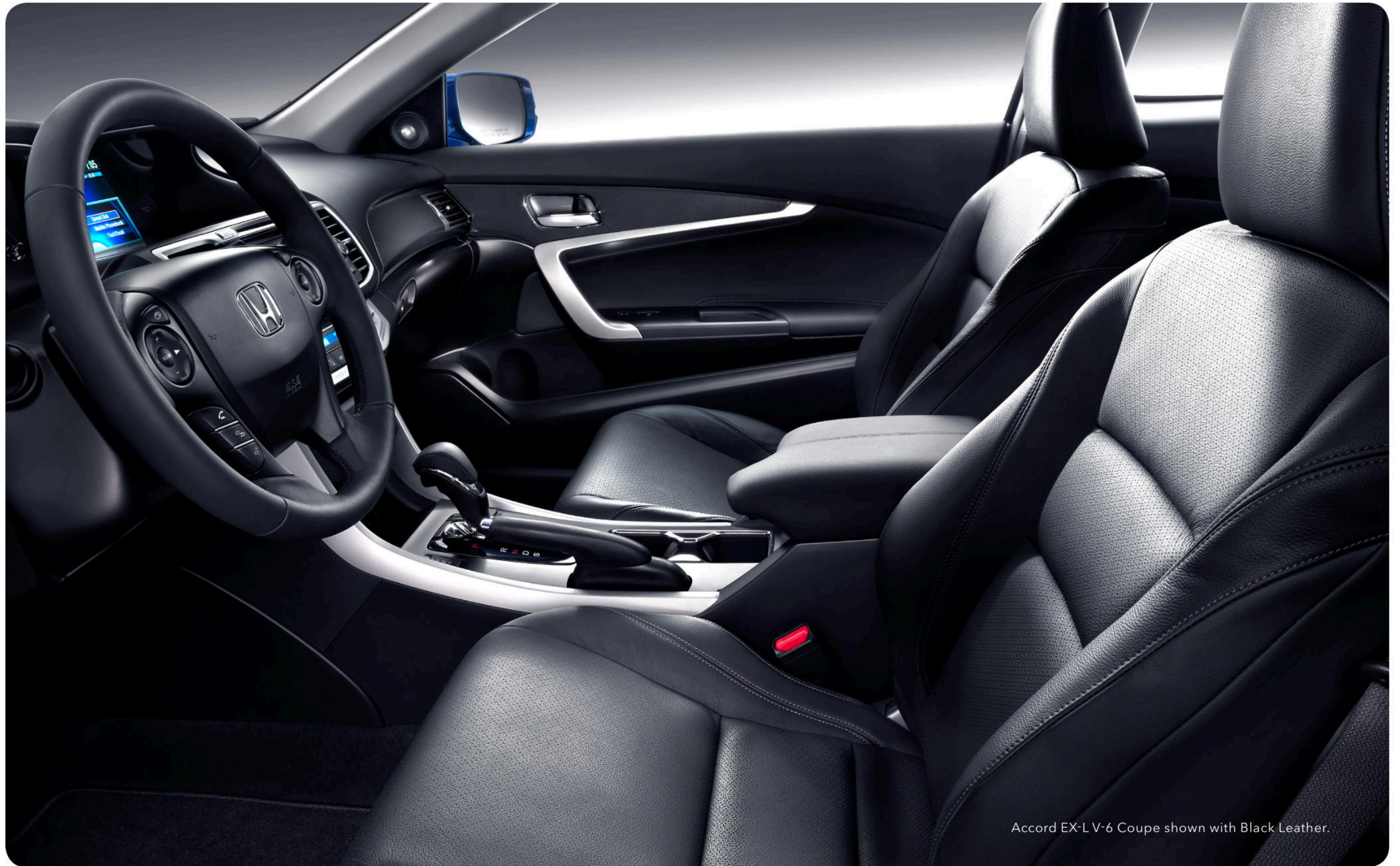
Accord EX-L V-6 Coupe shown with Black Leather.