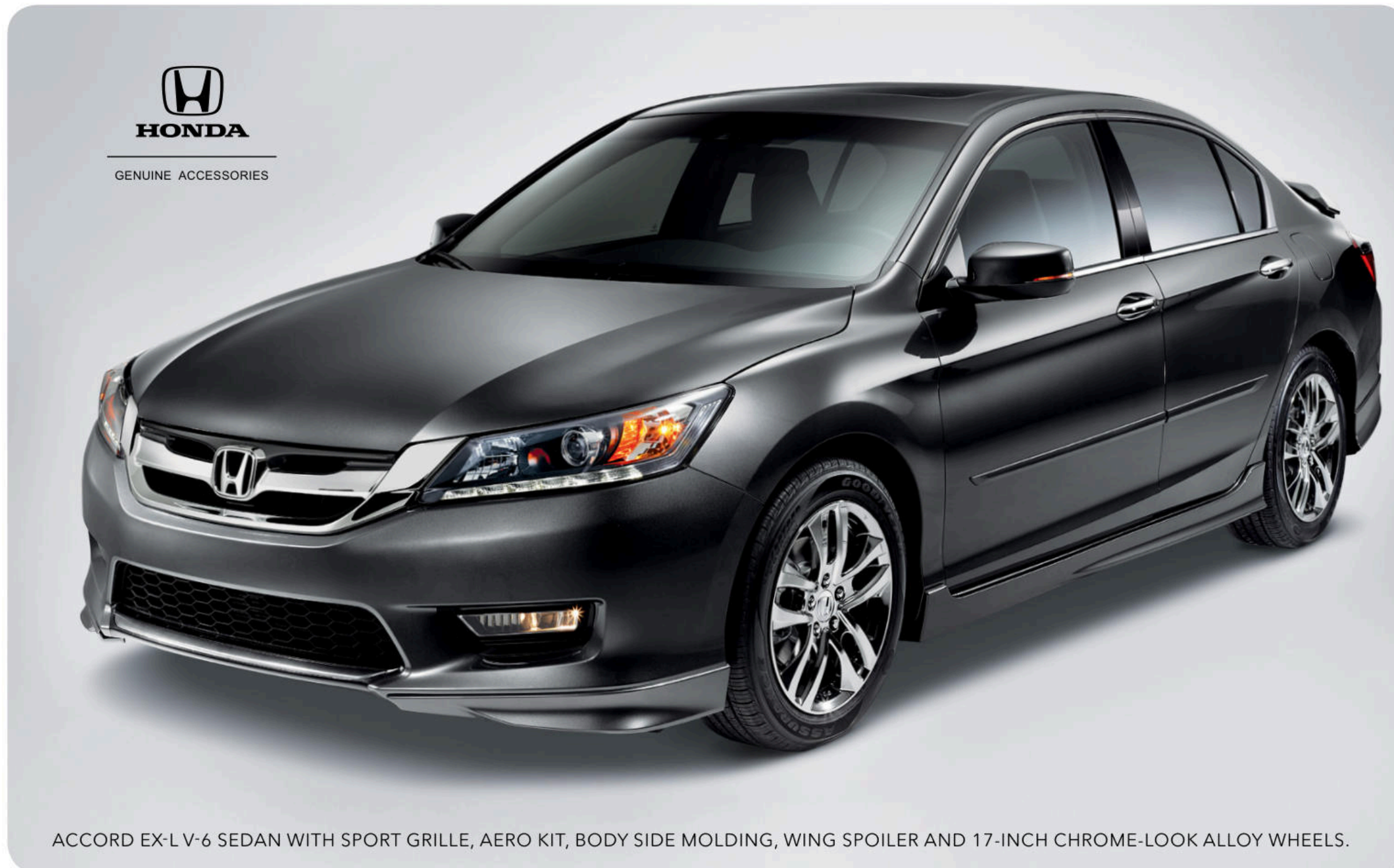
ACCORD EX-L V-6 SEDAN WITH SPORT GRILLE, AERO KIT, BODY SIDE MOLDING, WING SPOILER AND 17-INCH CHROME-LOOK ALLOY WHEELS.

Manufactured to the same strict standards as Honda vehicles, Honda Genuine Accessories are the perfect way to personalize and protect your vehicle. Please see your Honda dealer for details.