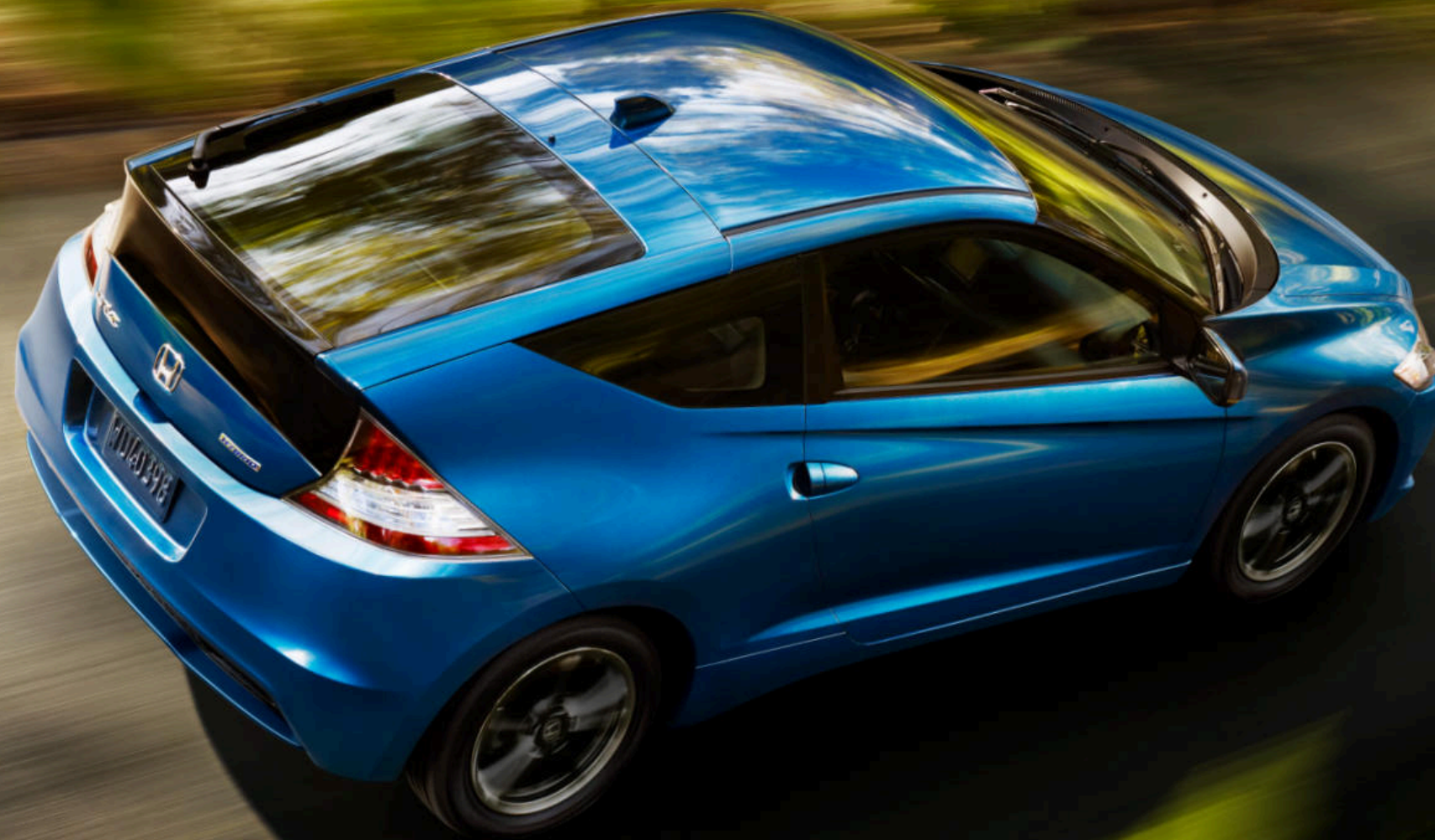
CR-Z EX shown in North Shore Blue Pearl.