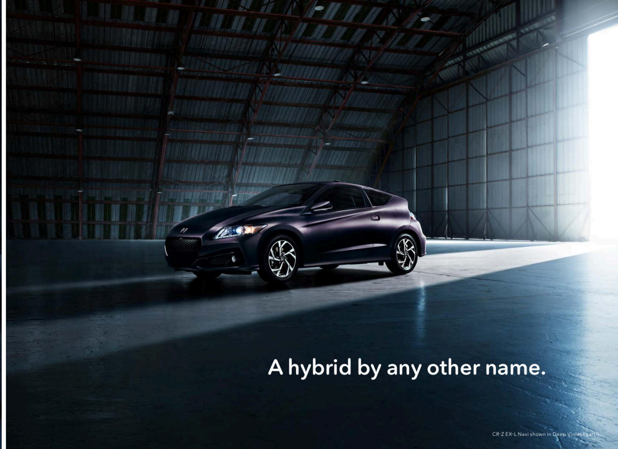
CR-Z EX-L Navi shown in Deep Violet Pearl II.