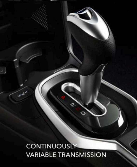
CONTINUOUSLY VARIABLE TRANSMISSION