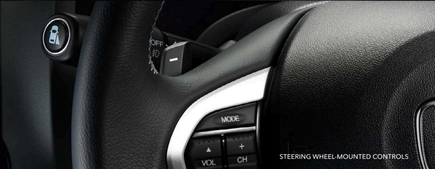
STEERING WHEEL-MOUNTED CONTROLS