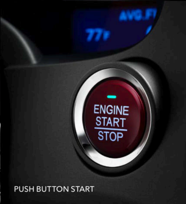
PUSH BUTTON START