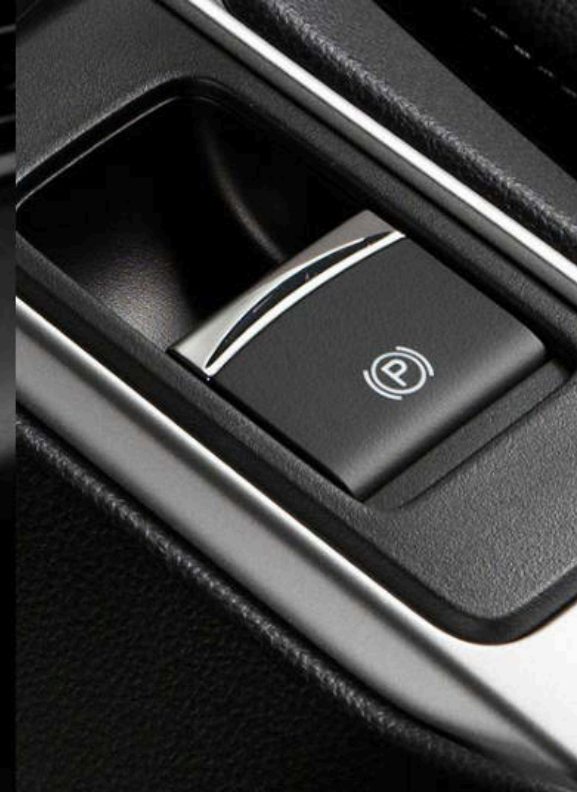
ELECTRIC PARKING BRAKE