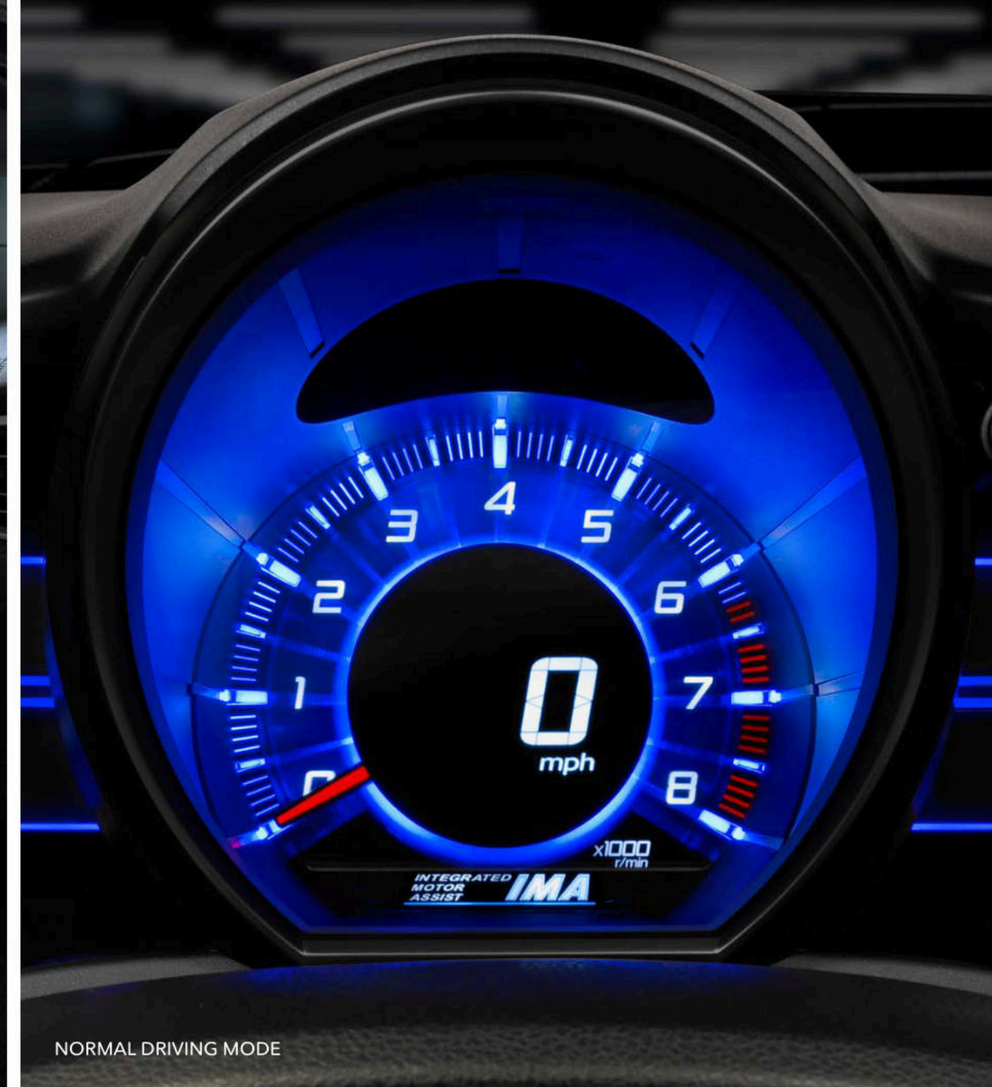
NORMAL DRIVING MODE