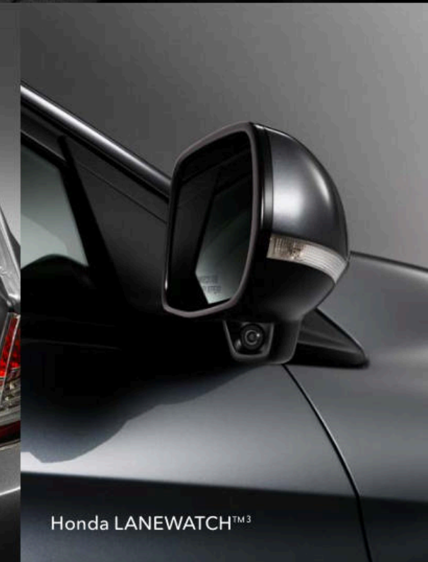
Honda LANEWATCH™ 3

Honda reminds you to properly secure cargo items.