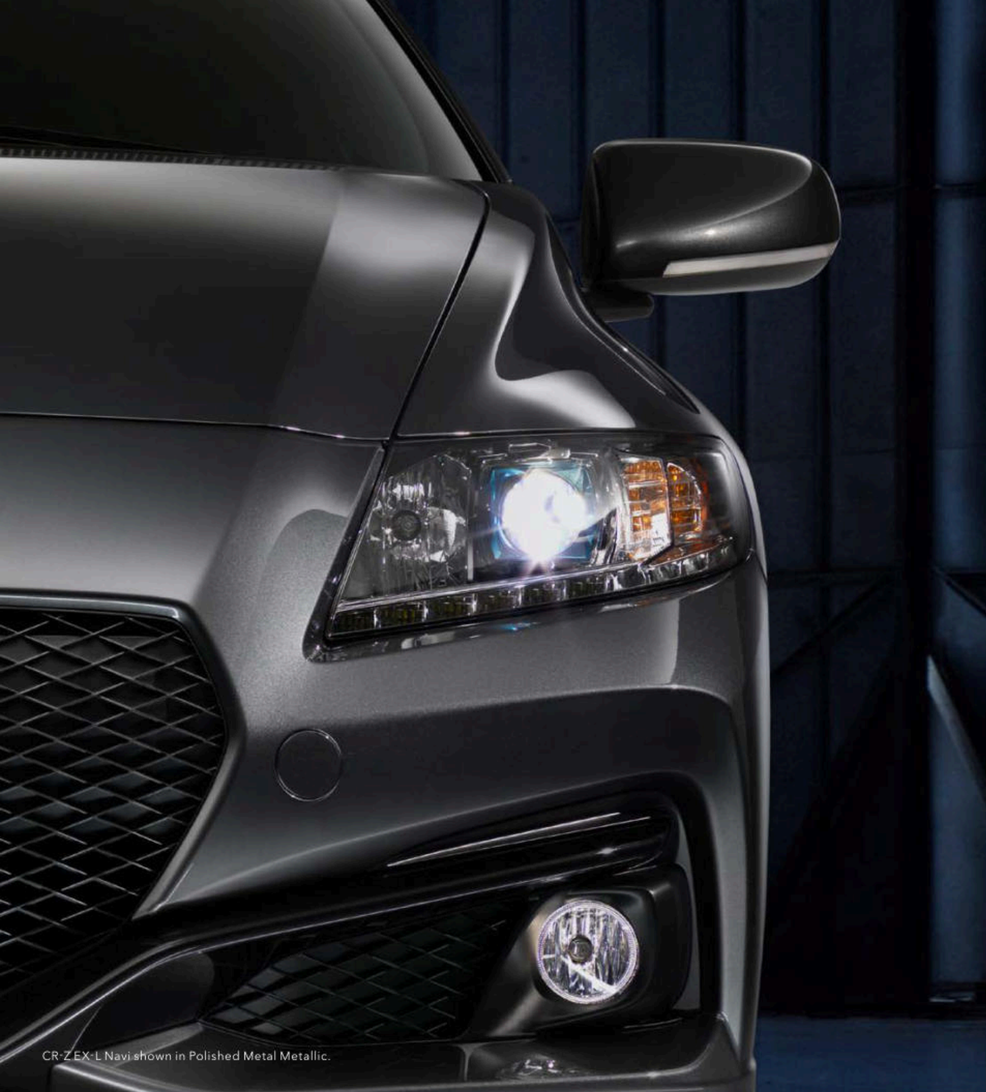
CR-Z EX-L Navi shown in Polished Metal Metallic.