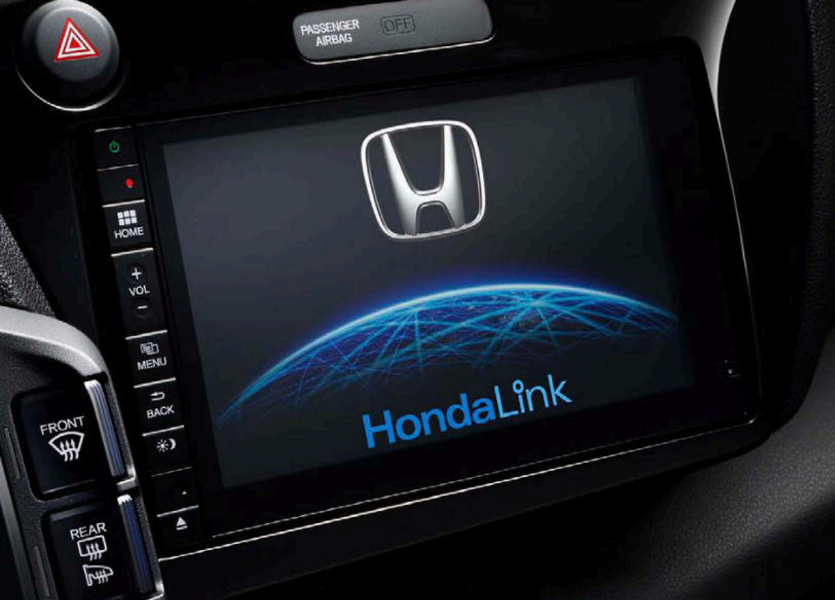
HondaLINK ®1 NEXT GENERATION