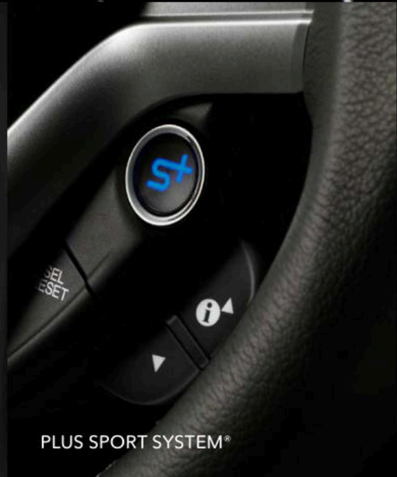
PLUS SPORT SYSTEM ®