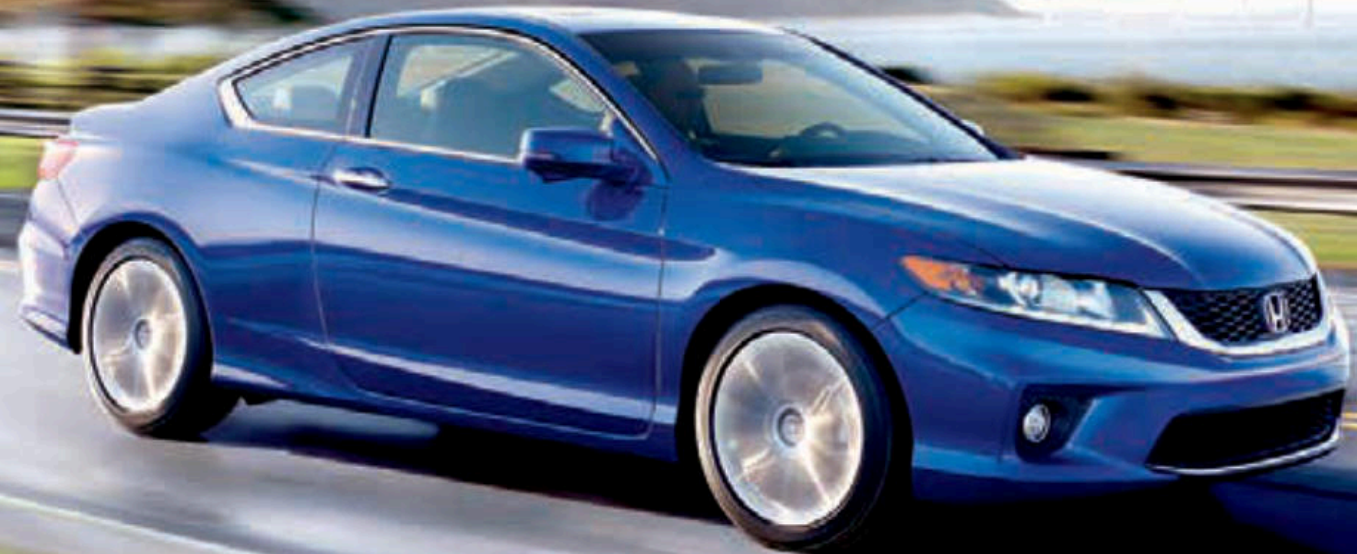
Accord EX-L V-6 Coupe shown in Still Night Pearl.