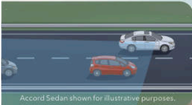
Accord Sedan shown for illustrative purposes.

The Accord Coupe is a driver's car, born from our legendary racing heritage. Start the ignition, and you're seconds away from 278 horsepower 4 (EX-L V-6). The Accord is also packed with high-tech features like the ingenious Honda LaneWatch 7MS which increases your view of passenger-side traffic nearly four times more than using the side mirror alone (EX and above).