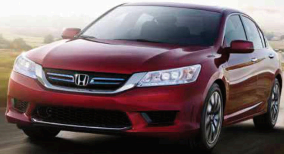
Accord Hybrid Touring shown in Basque Red Pearl II.