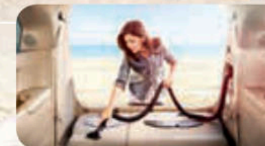
Odyssey Touring Elite shown in Obsidian Blue Pearl.

Its sleek, modern styling proves a minivan can be both practical and polished. Plus, it delivers groundbreaking technology that keeps you connected, and innovative conveniences that make life easier. Like the available HondaVAC, ® the first vacuum ever built into a minivan (Touring Elite ® ). And the Odyssey was the first minivan to earn the highest possible rating of "Good" from the IIHS in their small overlap front crash test. Its long list of safety features help make the Odyssey an IIHS 2015 TOP SAFETY PICK .