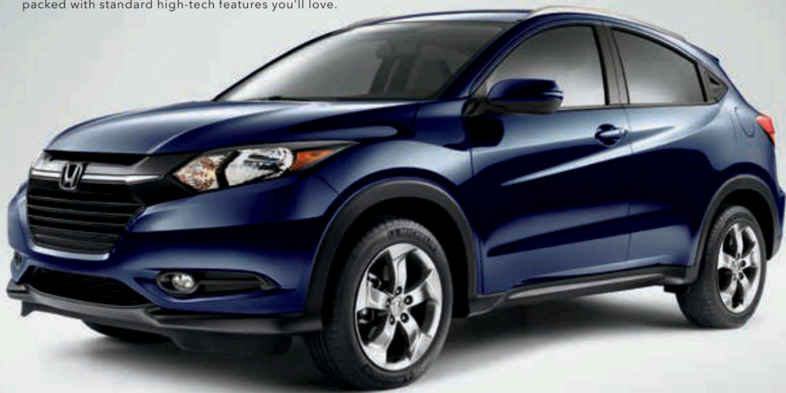
HR-V EX-L NAVI shown in Deep Ocean Pearl.

Introducing the all-new Honda HR-V Crossover. It's the perfect combination of advanced features, size and versatility, all in one extraordinary vehicle. The HR-V boasts three distinct interior configurations and it's packed with standard high-tech features you'll love.