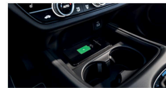
WIRELESS PHONE CHARGING 6