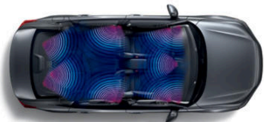
AVAILABLE 12-SPEAKER BOSE® PREMIUM SOUND SYSTEM

If it doesn't stir your soul, it's not a Civic. This is the standard we set for ourselves at Honda, and it's what brought the Civic Sedan to life. With a bold design, an available turbocharged engine and standard Honda Sensing,* it's ready to drive your fun without ever pressing pause.