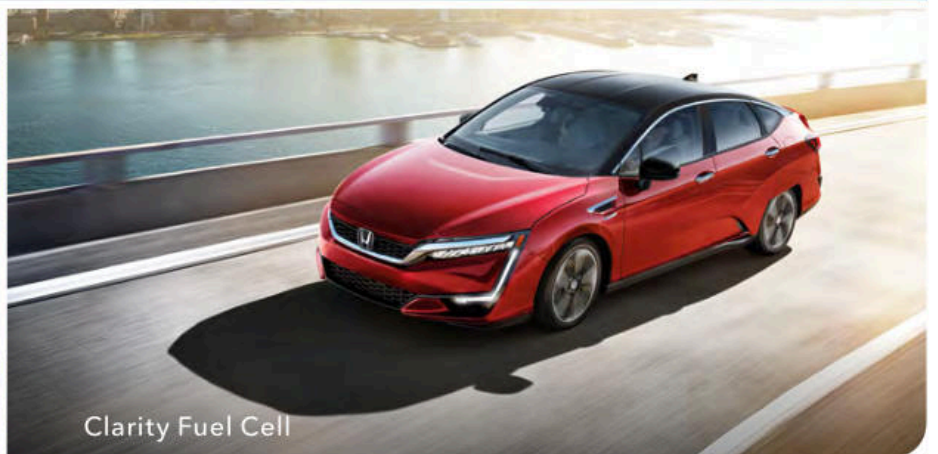
Clarity Fuel Cell