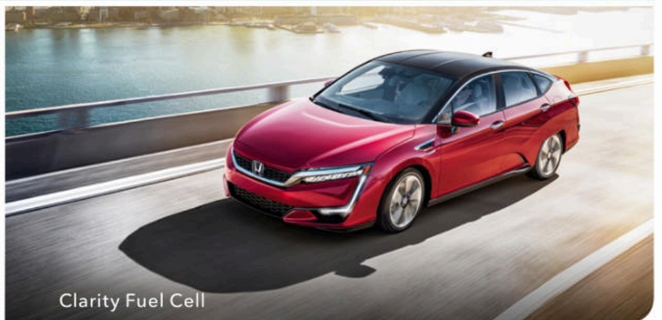
Clarity Fuel Cell