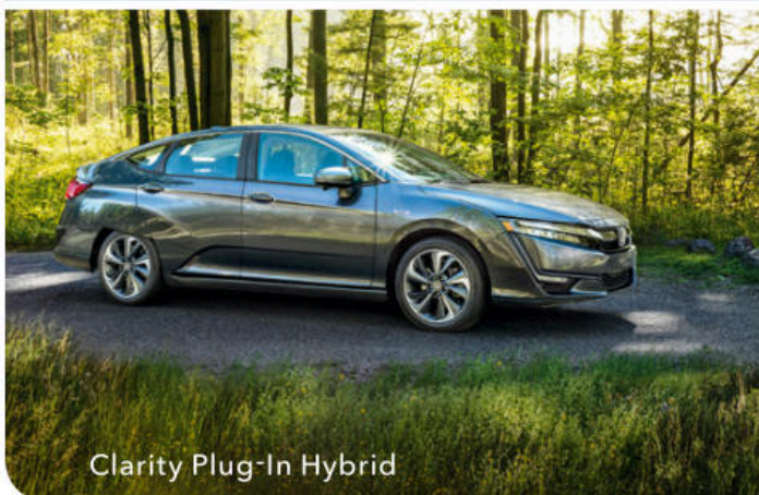
Clarity Plug-In Hybrid