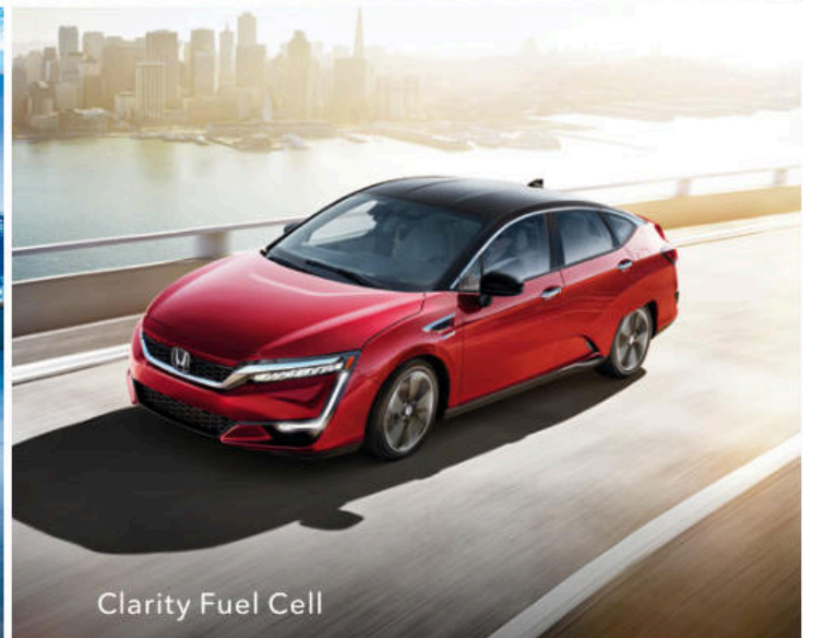
Clarity Fuel Cell