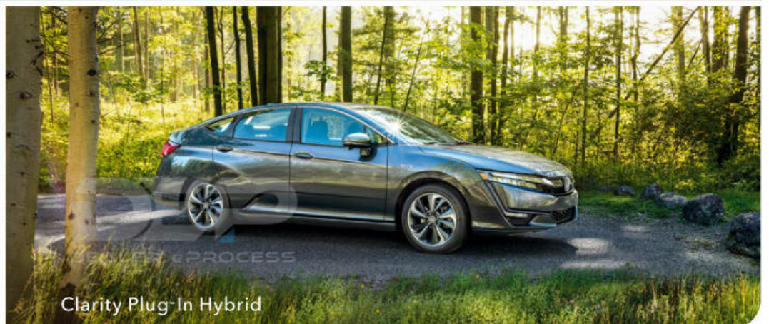
Clarity Plug-In Hybrid