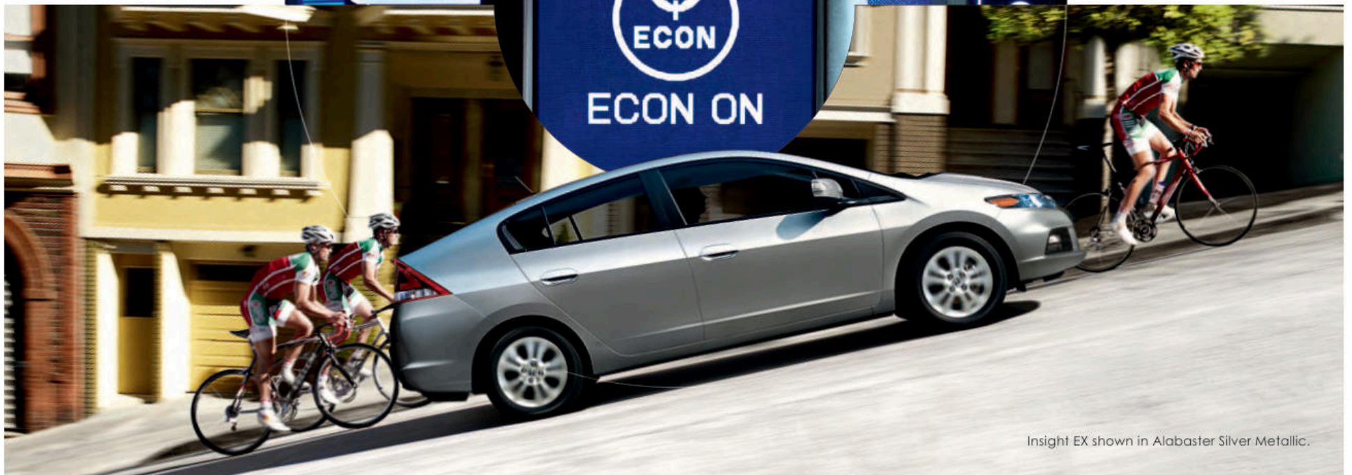
Insight EX shown in Alabaster Silver Metallic.

EPA numbers are important, but how you drive also affects your fuel economy.* The Insight features the remarkable Eco Assist™ system so you can monitor your driving habits, make adjustments and help boost your efficiency.*