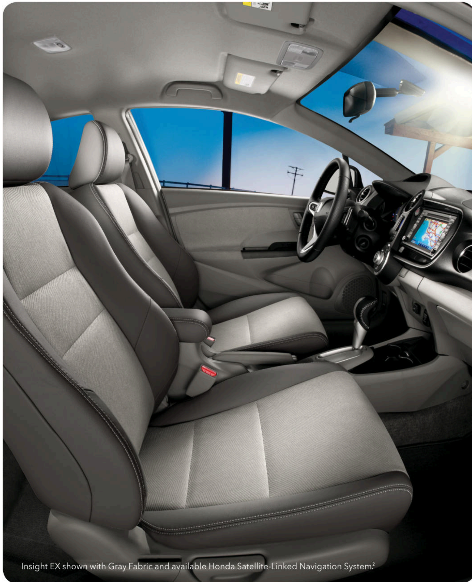
Insight EX shown with Gray Fabric and available Honda Satellite-Linked Navigation System. 2