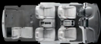
5-passenger cargo mode*

5 passengers and still plenty of cargo space.