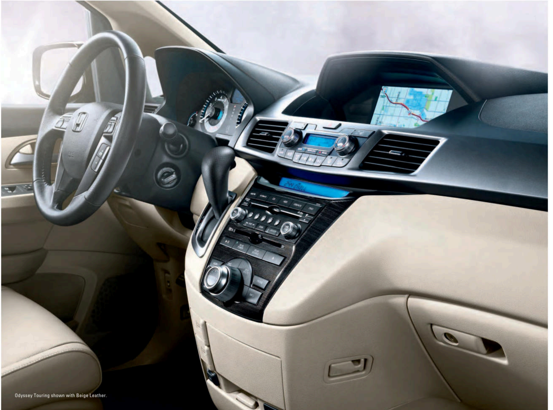
Odyssey Touring shown with Beige Leather.