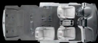
3-passenger cargo mode

The incredibly versatile interior easily adjusts to meet your needs.