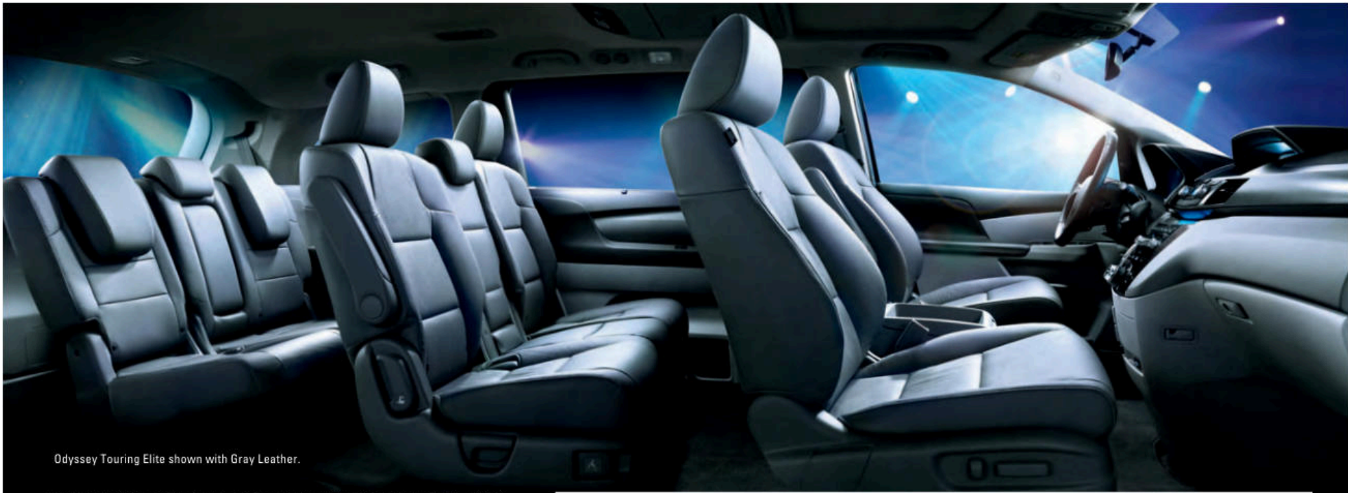
Odyssey Touring Elite shown with Gray Leather.