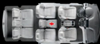
Multi-function center seat slides forward*

Quite possibly the perfect combination of cargo and passenger space.