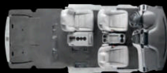
3-passenger cargo mode 2*

With 3 passengers, there's still plenty of room for a surfboard or ladder.