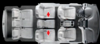
2nd-row "wide mode"

More space for passengers, or more room for 2 child seats in the 2nd row.