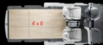
2-passenger cargo mode

4' x 8' sheets of plywood are a breeze to transport.