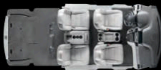
4-passenger cargo mode*

Party of 4? Stow the 3rd row for more cargo space.