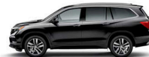
TOURING & ELITE