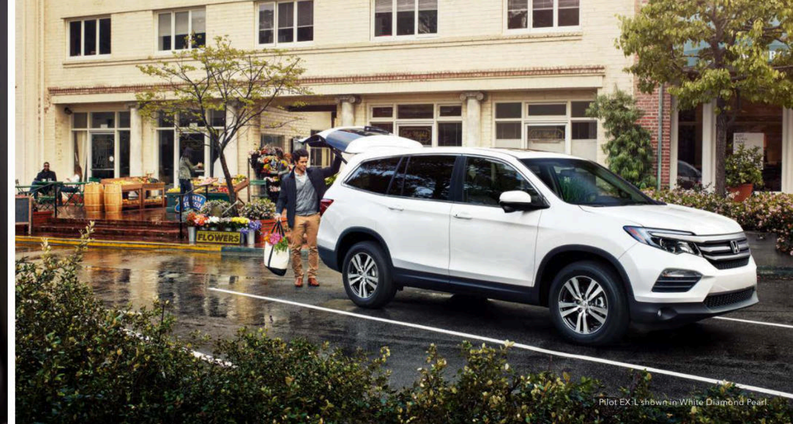
Pilot EX-L shown in White Diamond Pearl.