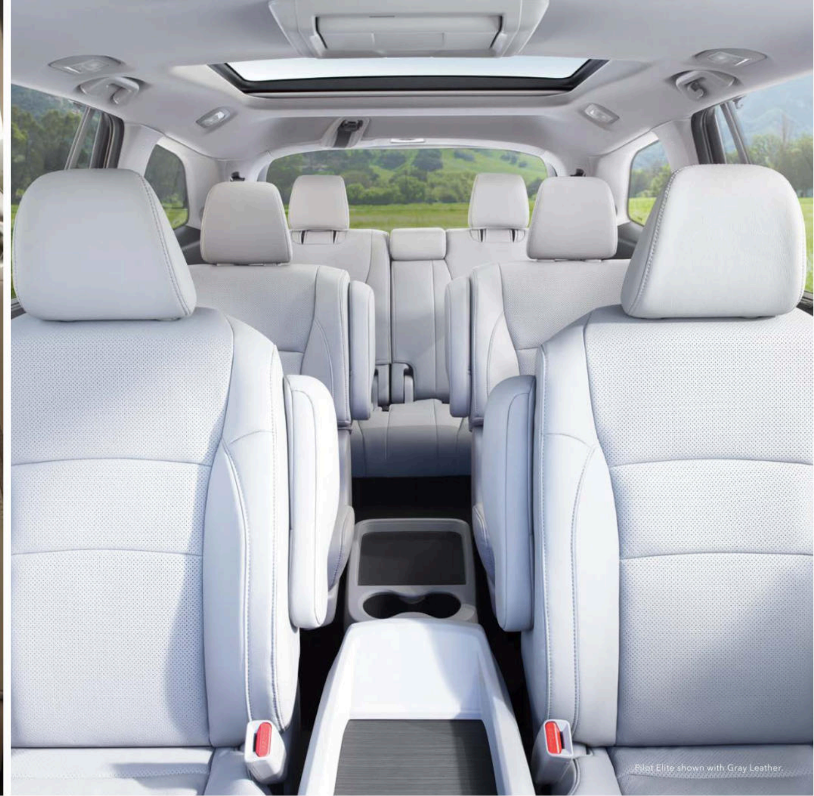
Pilot Elite shown with Gray Leather.