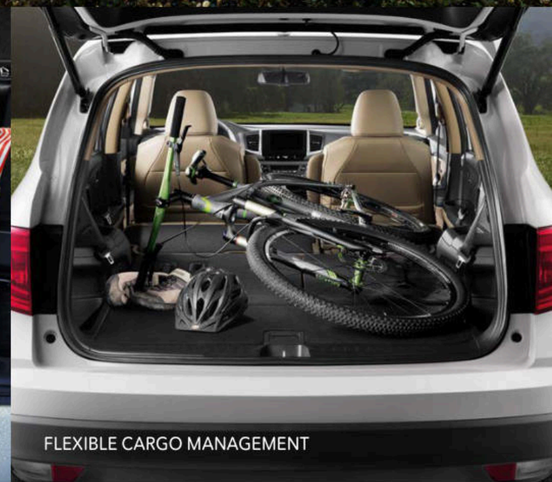
FLEXIBLE CARGO MANAGEMENT