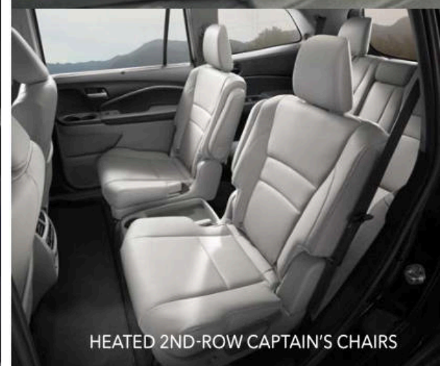
HEATED 2ND-ROW CAPTAIN'S CHAIRS