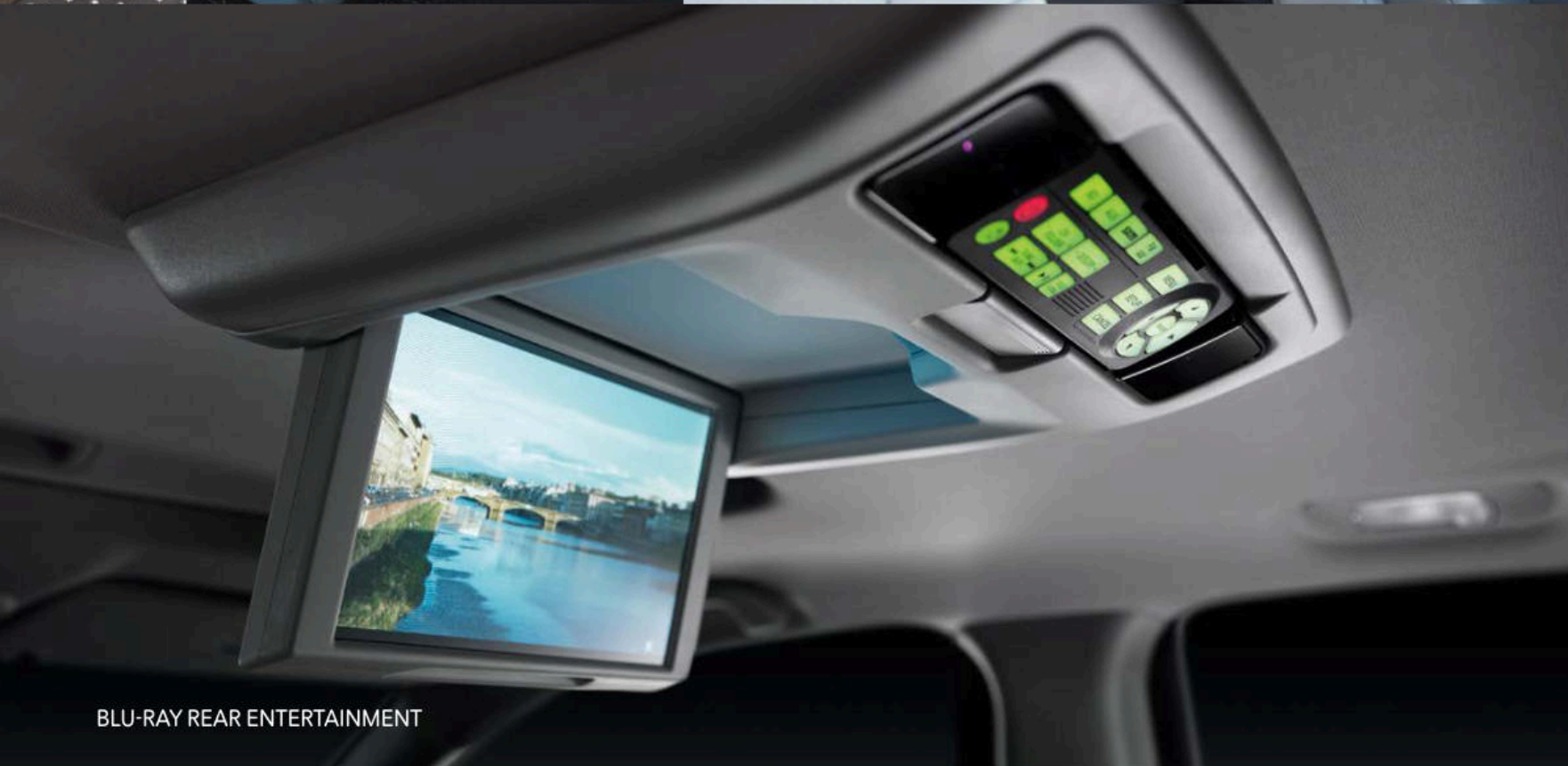
BLU-RAY REAR ENTERTAINMENT