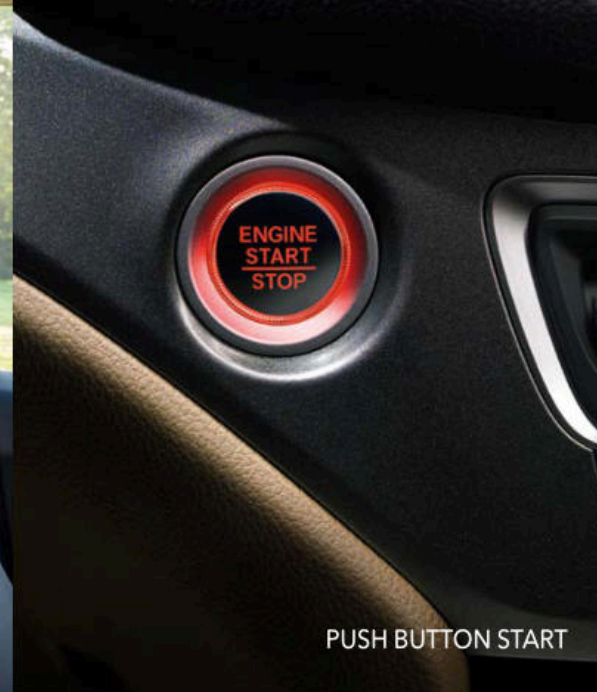
PUSH BUTTON START