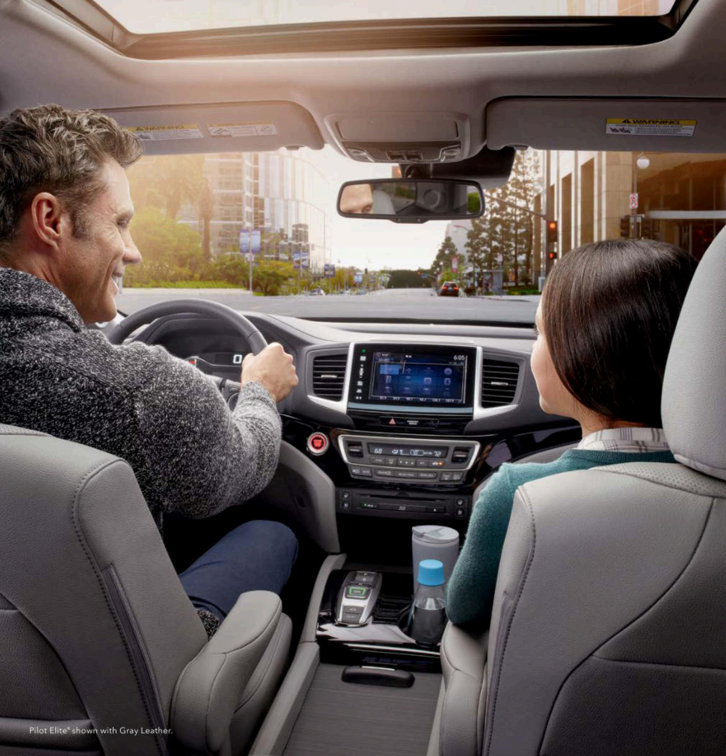
Pilot Elite® shown with Gray Leather.