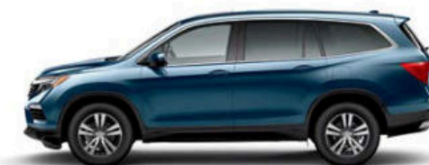
EX & EX-L