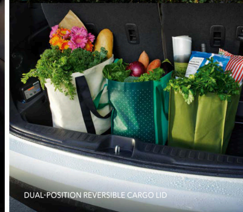
DUAL-POSITION REVERSIBLE CARGO LID