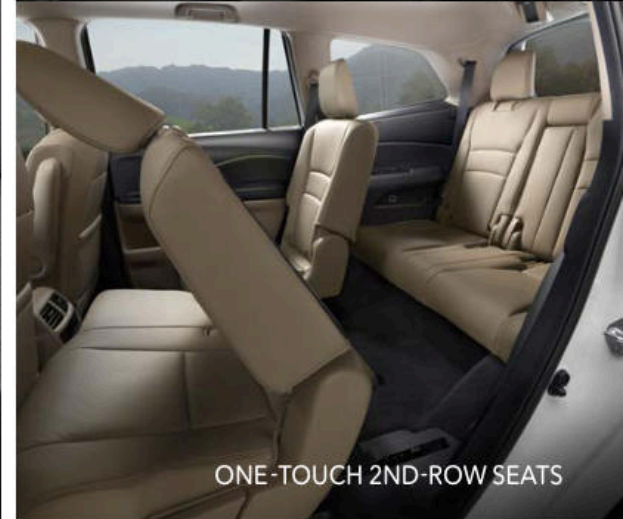
ONE-TOUCH 2ND-ROW SEATS