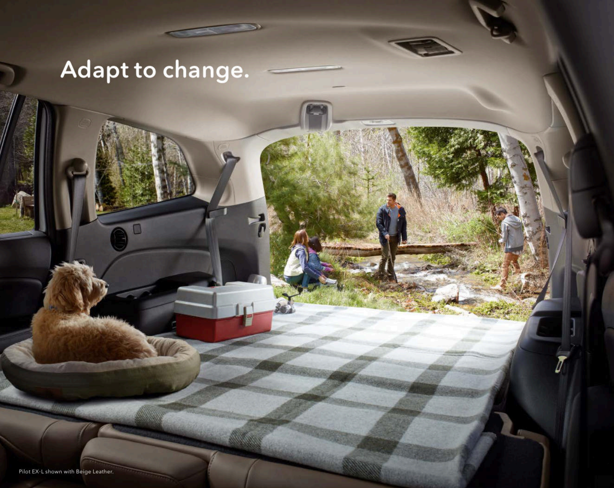
Pilot EX-L shown with Beige Leather.