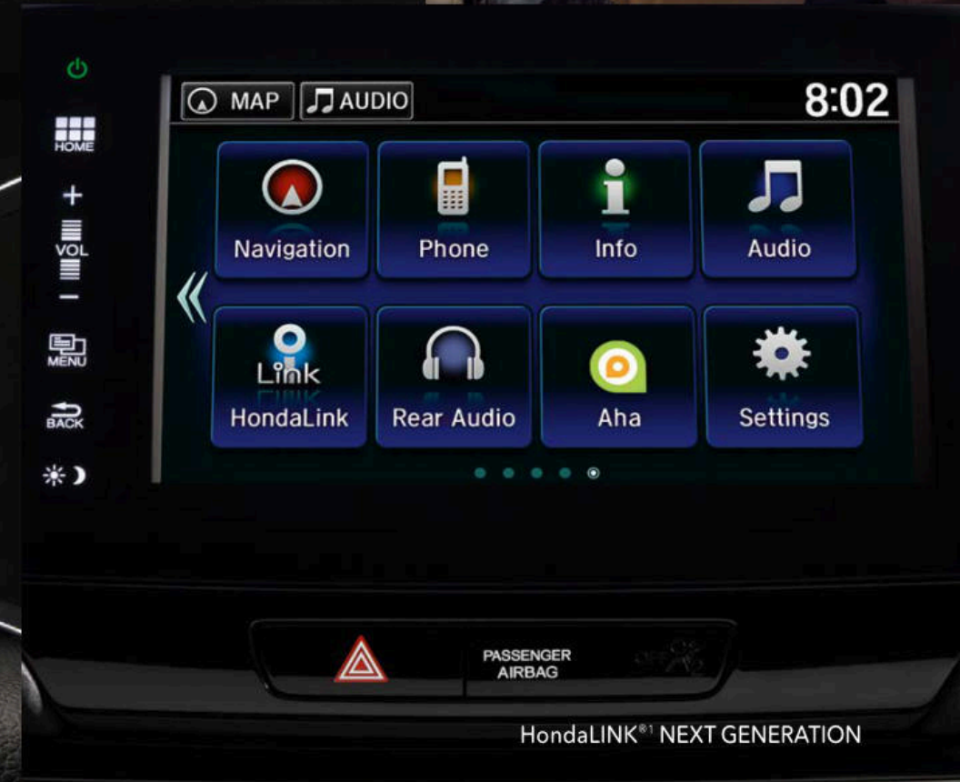
HondaLINK ®1 NEXT GENERATION