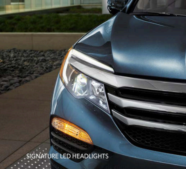
SIGNATURE LED HEADLIGHTS