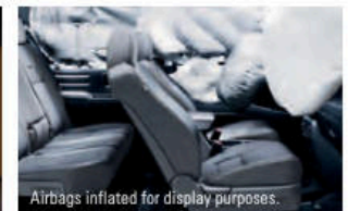
Airbags inflated for display purposes.

The Ridgeline's first line of defense is a reinforced unit body that incorporates a closed-box frame with internal high-strength steel frame stiffeners. Both the frame rails and all seven crossmembers feature box-section construction. The result is a remarkably high torsional rigidity.