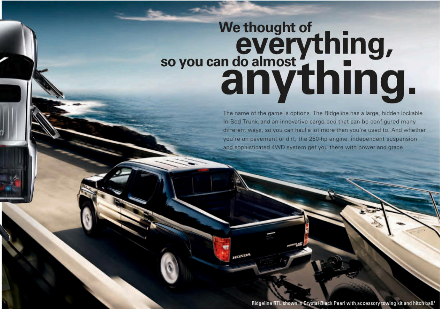
Ridgeline RTL shown in Crystal Black Pearl with accessory towing kit and hitch ball. 4

Honda reminds you to properly secure items stored in the cargo area.