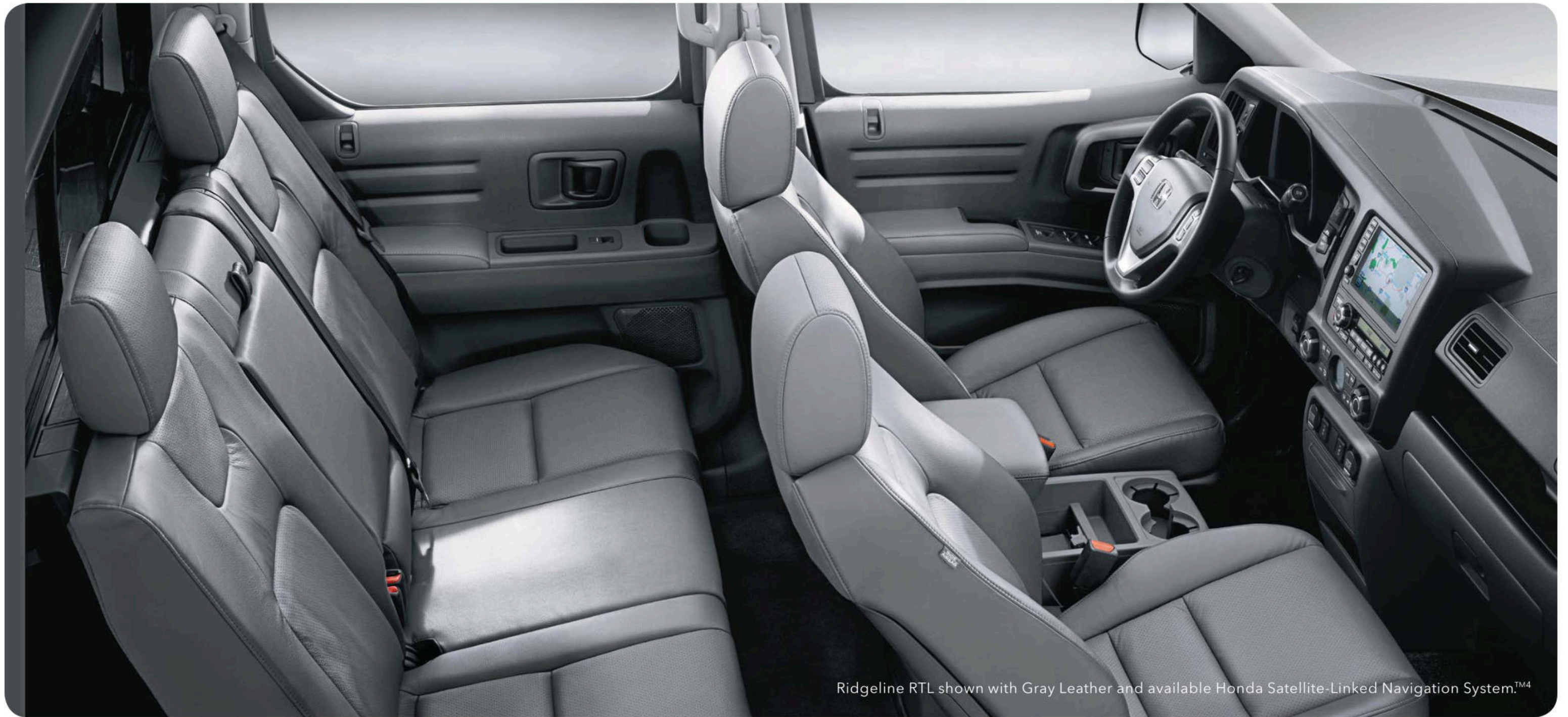
Ridgeline RTL shown with Gray Leather and available Honda Satellite-Linked Navigation System. TM4