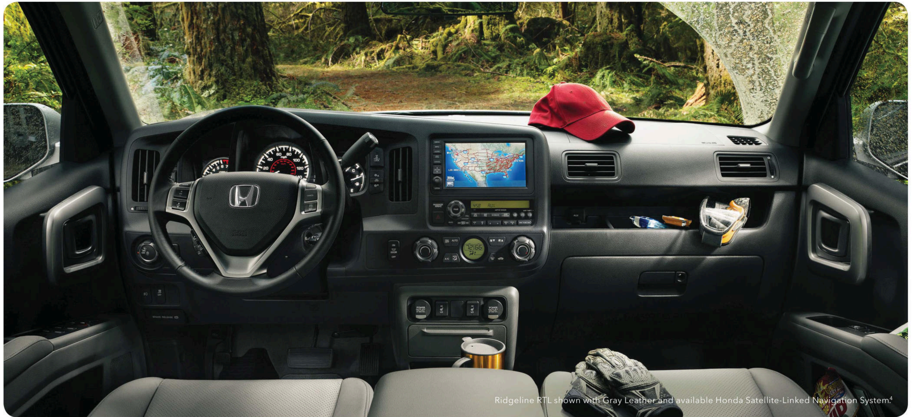
Ridgeline RTL shown with Gray Leather and available Honda Satellite-Linked Navigation System. 4