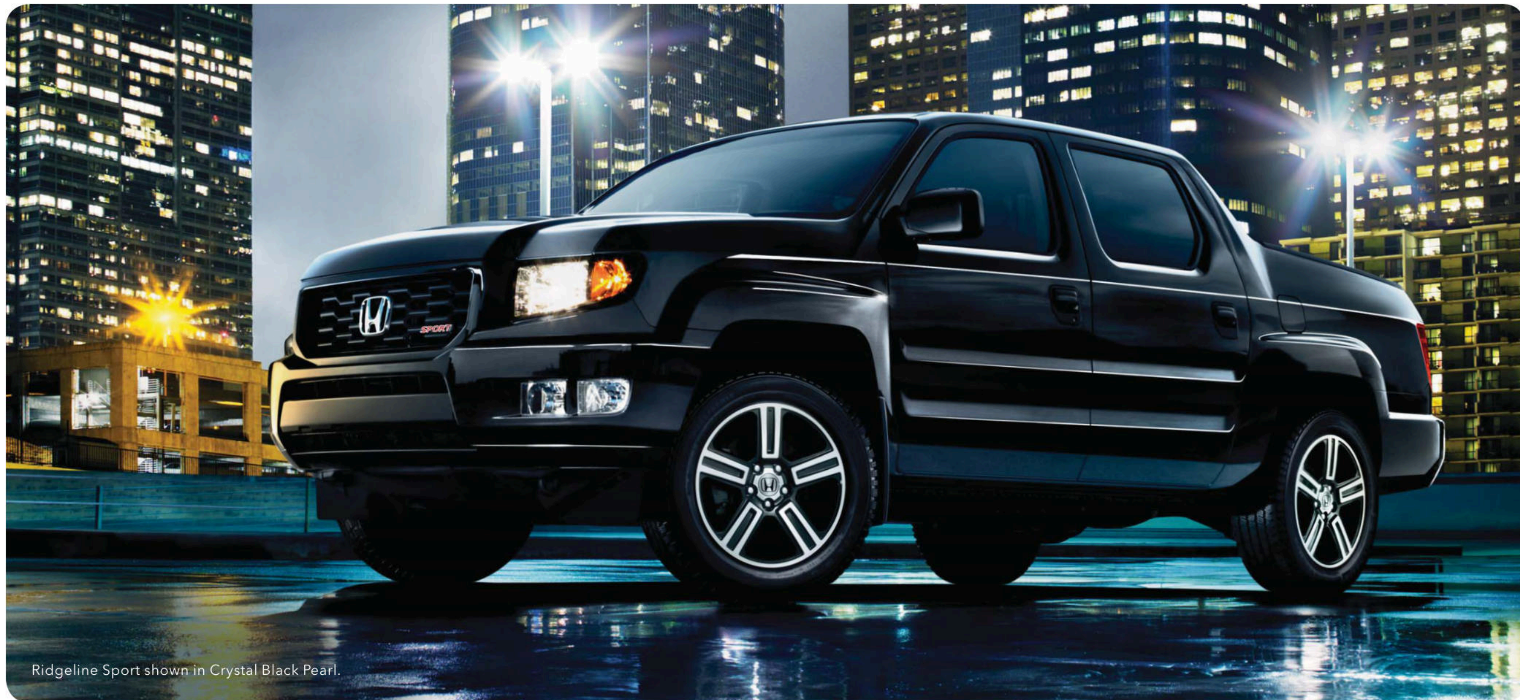
Ridgeline Sport shown in Crystal Black Pearl.