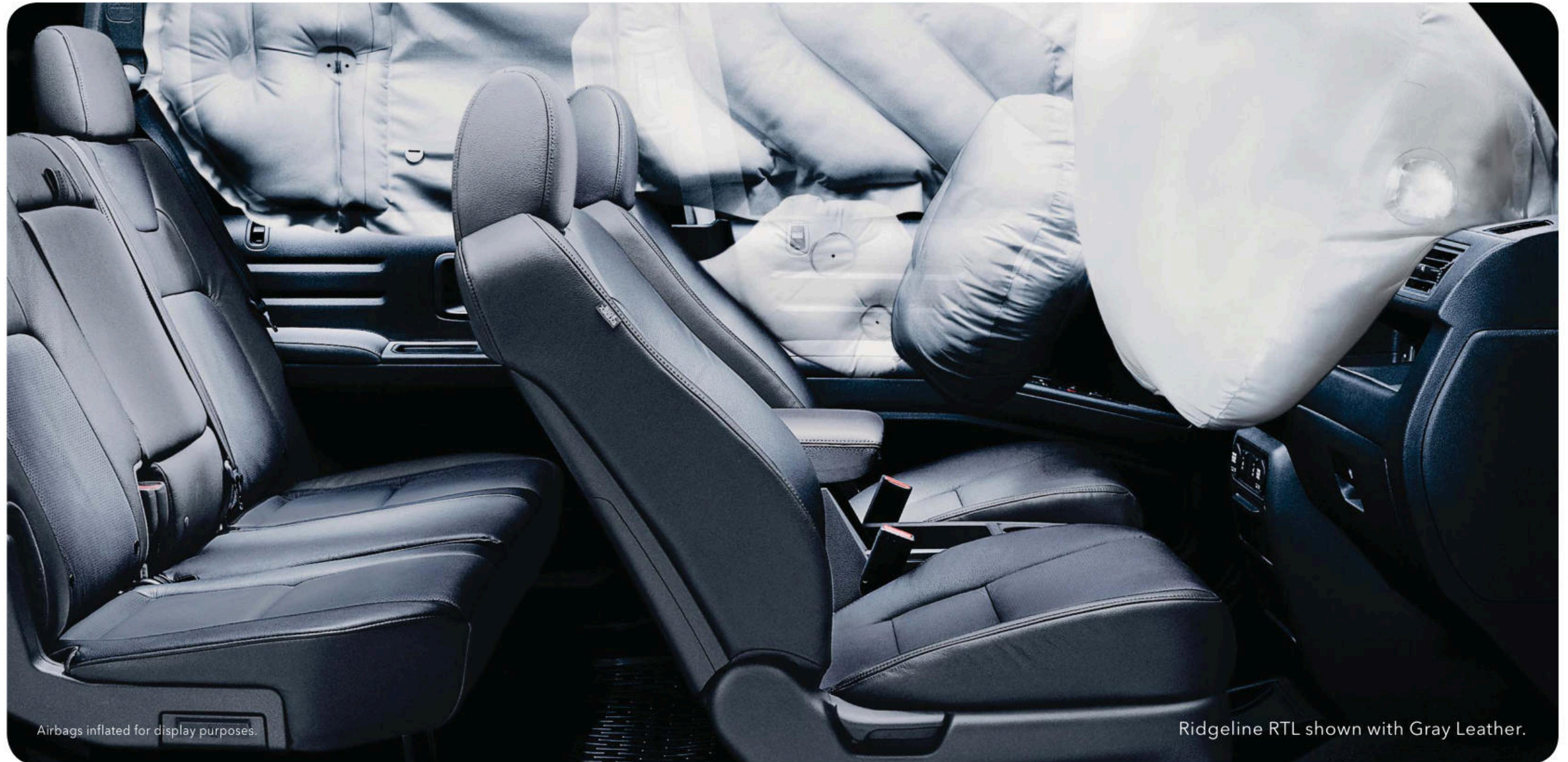
Airbags inflated for display purposes.

*Honda reminds you and your passengers to always buckle up. Children 12 and under are safest when properly restrained in the rear seat.