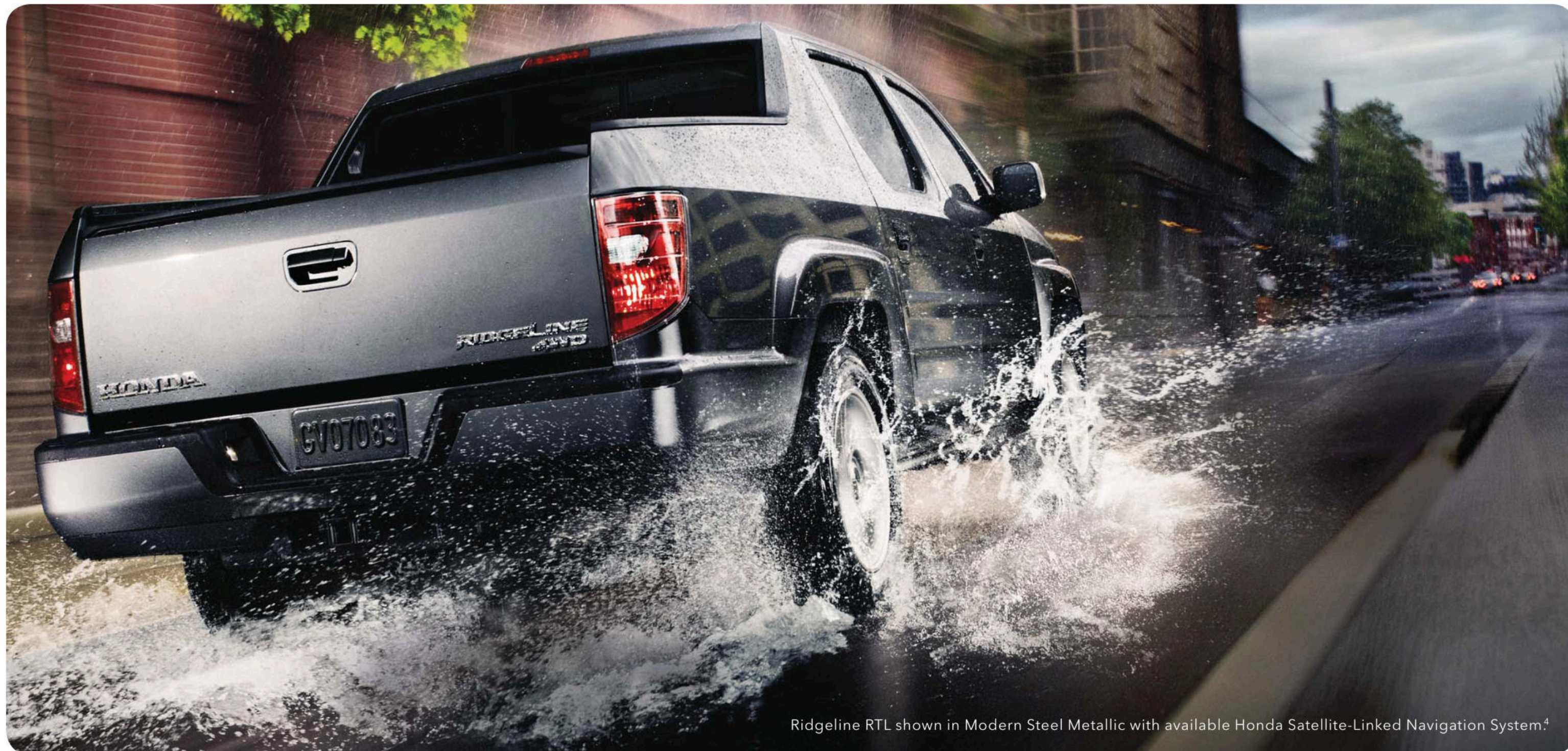
Ridgeline RTL shown in Modern Steel Metallic with available Honda Satellite-Linked Navigation System. 4