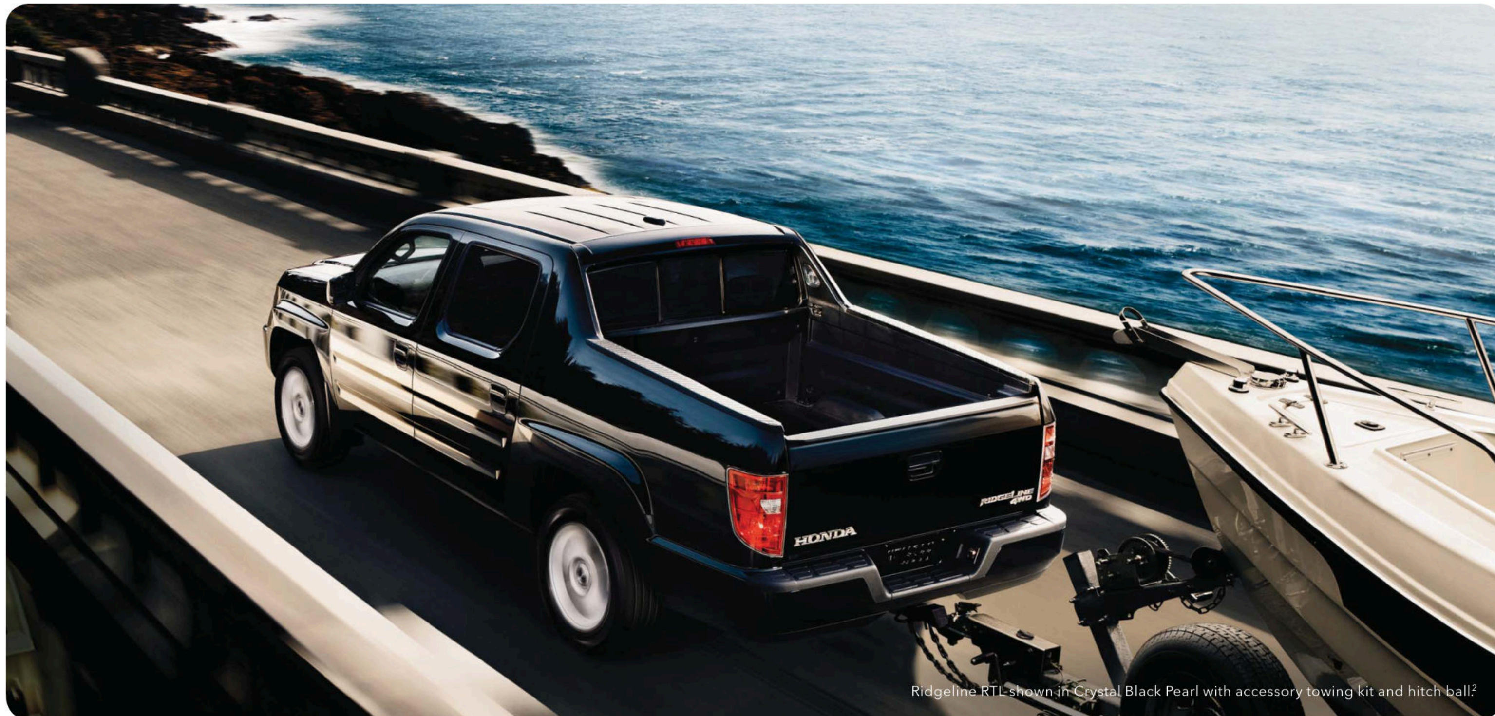
Ridgeline RTL shown in Crystal Black Pearl with accessory towing kit and hitch ball. 2