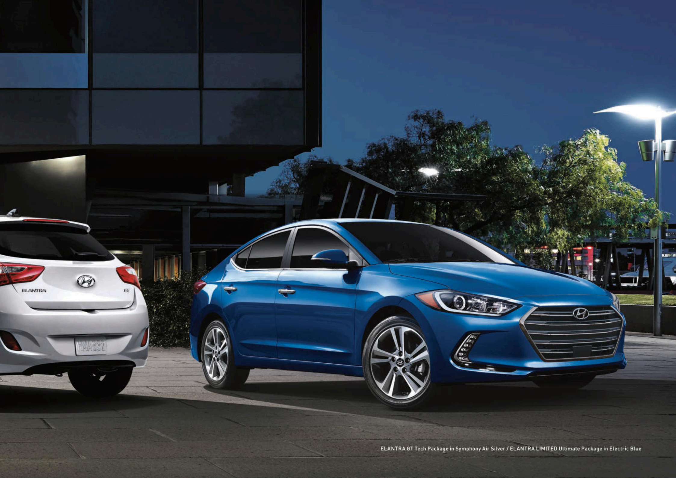
ELANTRA GT Tech Package in Symphony Air Silver / ELANTRA LIMITED Ultimate Package in Electric Blue