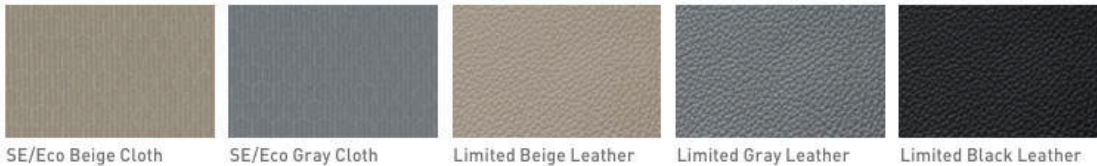
SE/Eco Beige Cloth SE/Eco Gray Cloth Limited Beige Leather Limited Gray Leather Limited Black Leather