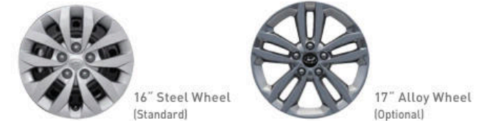
16" Steel Wheel [Standard]