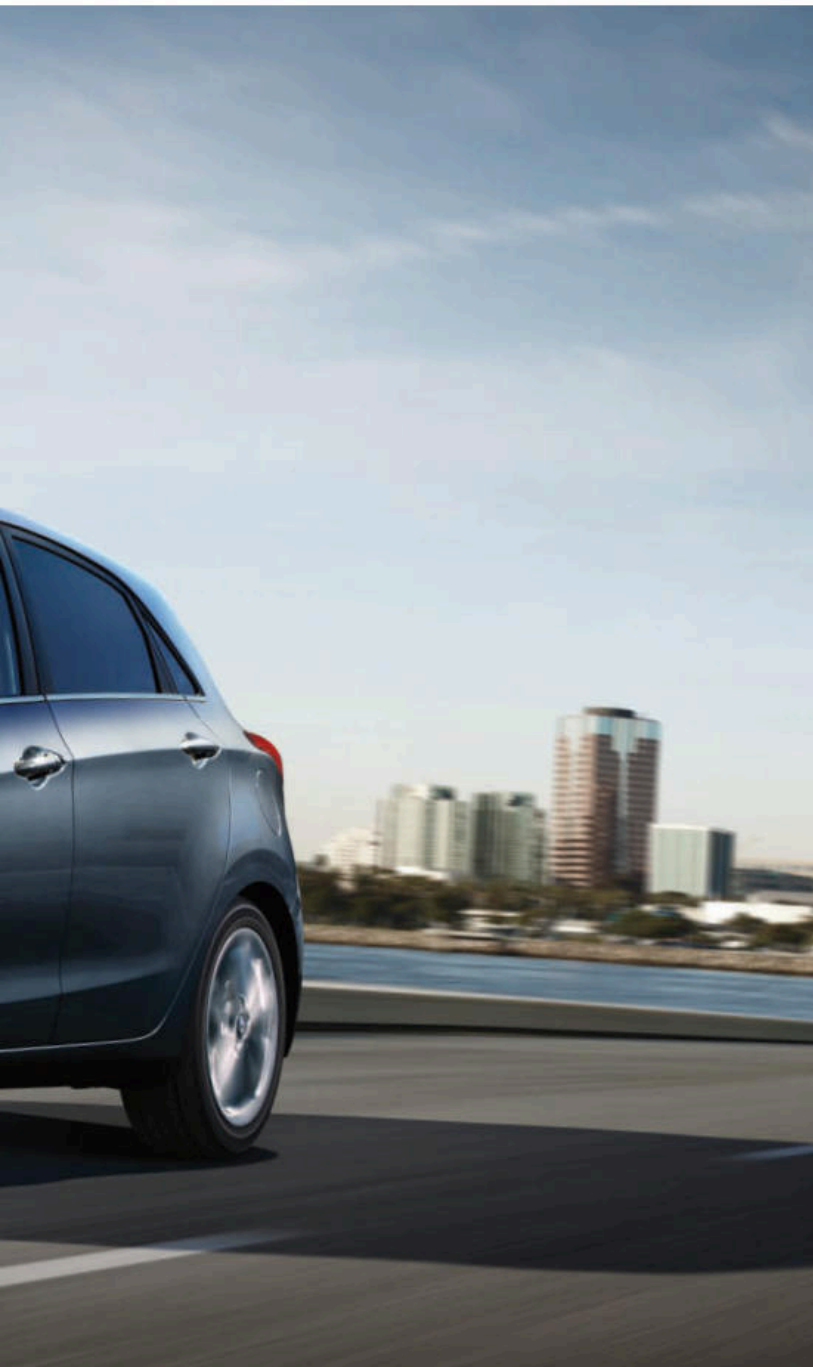
ELANTRA GT Tech Package in Galactic Gray