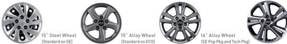
15" Steel Wheel [Standard on SE]