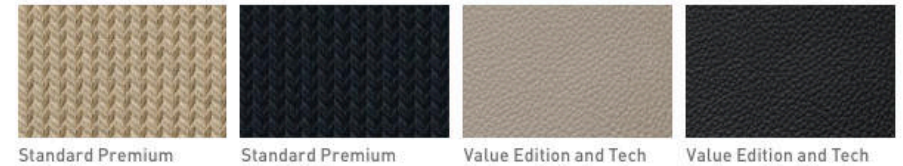
Standard Premium Beige Cloth Standard Premium Black Cloth Value Edition and Tech Package Beige Leather Value Edition and Tech Package Black Leather