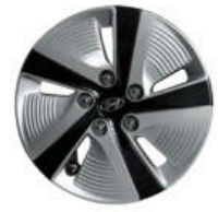
15" Alloy Wheel Hybrid Blue