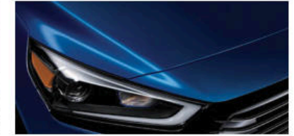
Electric Blue Metallic