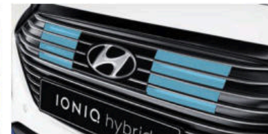
Active Air Flap – Integrated w/ Grille Ioniq Hybrid