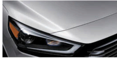
Symphony Air Silver