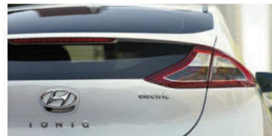
Integrated Rear Spoiler w/ Split-View Window Ioniq Hybrid & Electric