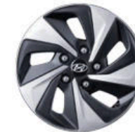
15" Alloy Wheel Hybrid SEL