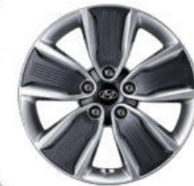
17" Alloy Wheel Hybrid Limited