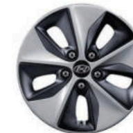
16" Alloy Wheel Electric