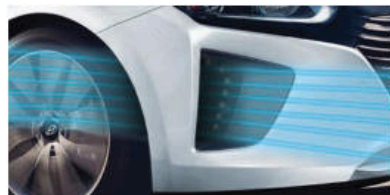
LED Daytime Running Lights & Wheel Air Curtain Ioniq Hybrid & Electric