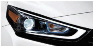
HID Headlights w/ Dynamic Bending Light Ioniq Hybrid & Electric