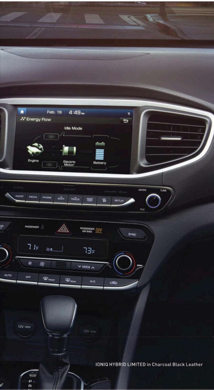
IONIQ HYBRID LIMITED in Charcoal Black Leather