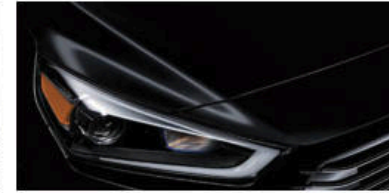
Black Noir Pearl