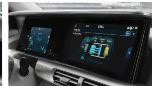
LED headlights 12.3" touchscreen display with energy flow chart