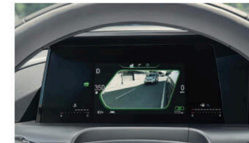
Shift-by-Wire push-button gear selector Blind-Spot View Monitor