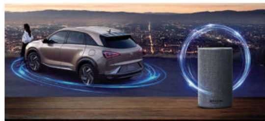
Amazon Echo ® integration

Of course, Blue Link is just one of the ways NEXO makes life easier. With Android Auto ™ and Apple CarPlay, ® NEXO connects to your compatible smartphone and displays your familiar icons, apps, playlists and content on a very wide 12.3" touchscreen display. 6 NEXO also offers the convenience of wireless device charging. 7 Like Apple CarPlay and Android Auto, it's standard on NEXO. And like NEXO itself, it'll quickly recharge your compatible devices to keep you on the move.