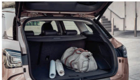
Hands-free smart liftgate with height adjustment