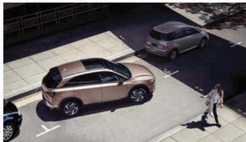
Remote Smart Parking Assist