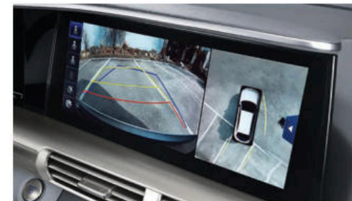
Rearview camera with parking guidelines