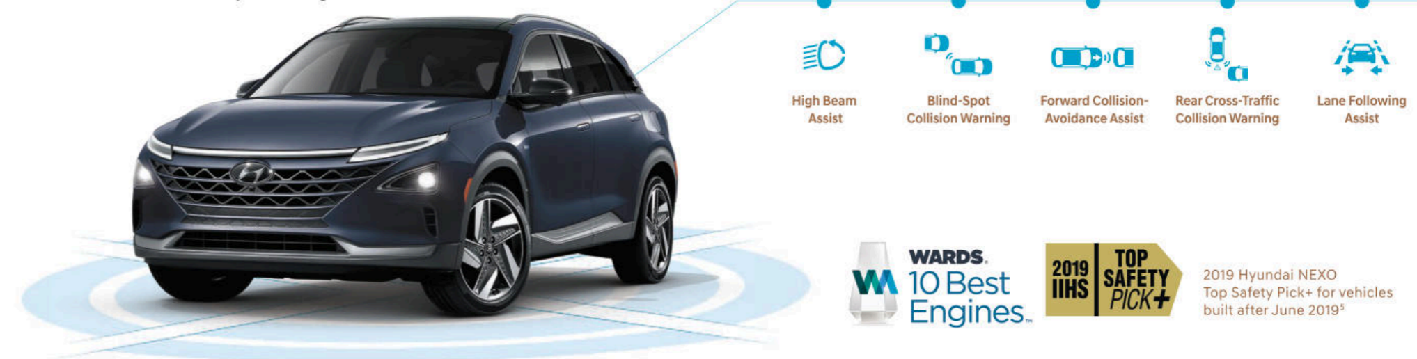
High Beam Assist