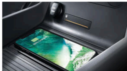
Wireless device charging