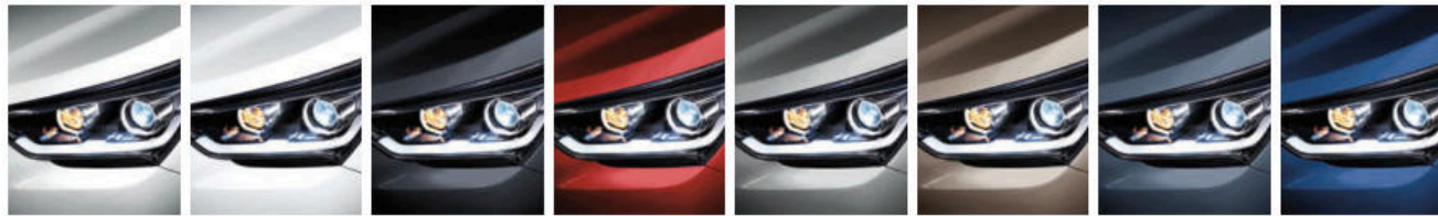
Circuit Silver Monaco White Becketts Black Regal Red Pearl Iron Frost Java Espresso Night Sky Pearl Storm Blue