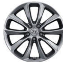
18" Alloy Wheel (Santa Fe Standard)