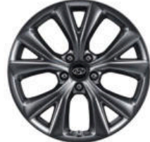
19" Alloy Wheel (2.0T Santa Fe Sport Optional)