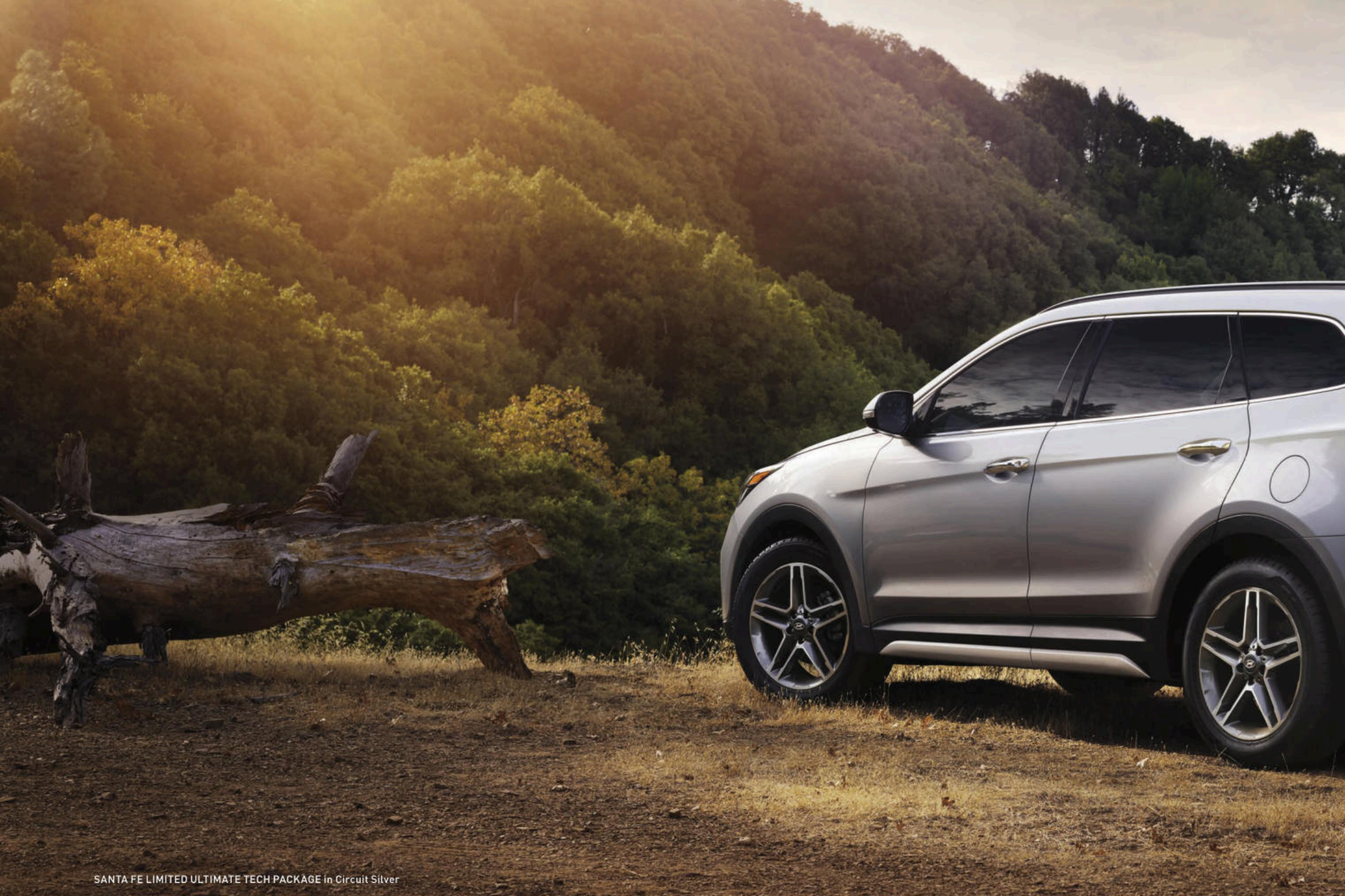
SANTA FE LIMITED ULTIMATE TECH PACKAGE in Circuit Silver