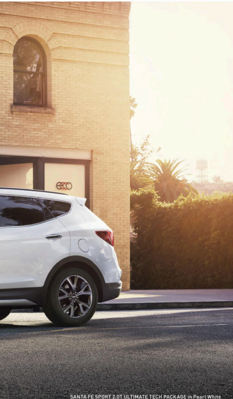
SANTA FE SPORT 2.0T ULTIMATE TECH PACKAGE in Pearl White