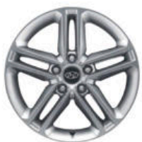
17" Alloy Wheel (2.4L Santa Fe Sport Standard)