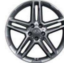
19" Alloy Wheel (Santa Fe Optional)