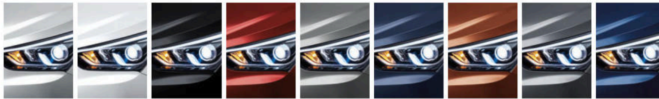
Sparkling Silver Pearl White Twilight Black Serrano Red Mineral Gray Martin Blue Canyon Copper Platinum Graphite Nightfall Blue