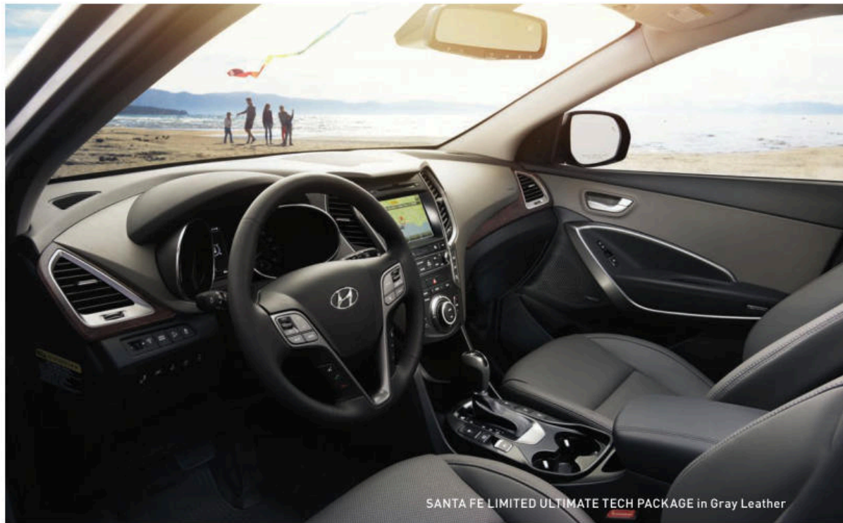
SANTA FE LIMITED ULTIMATE TECH PACKAGE in Gray Leather