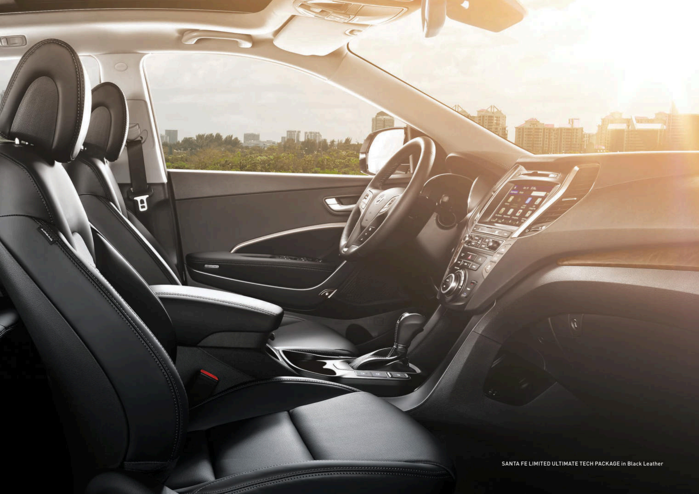
SANTA FE LIMITED ULTIMATE TECH PACKAGE in Black Leather