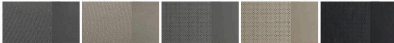
Gray Cloth Beige Cloth Gray Leather Beige Leather Black Leather