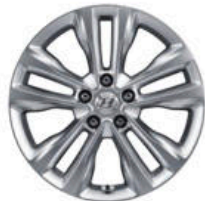
18" Alloy Wheel (2.0T Santa Fe Sport Standard)