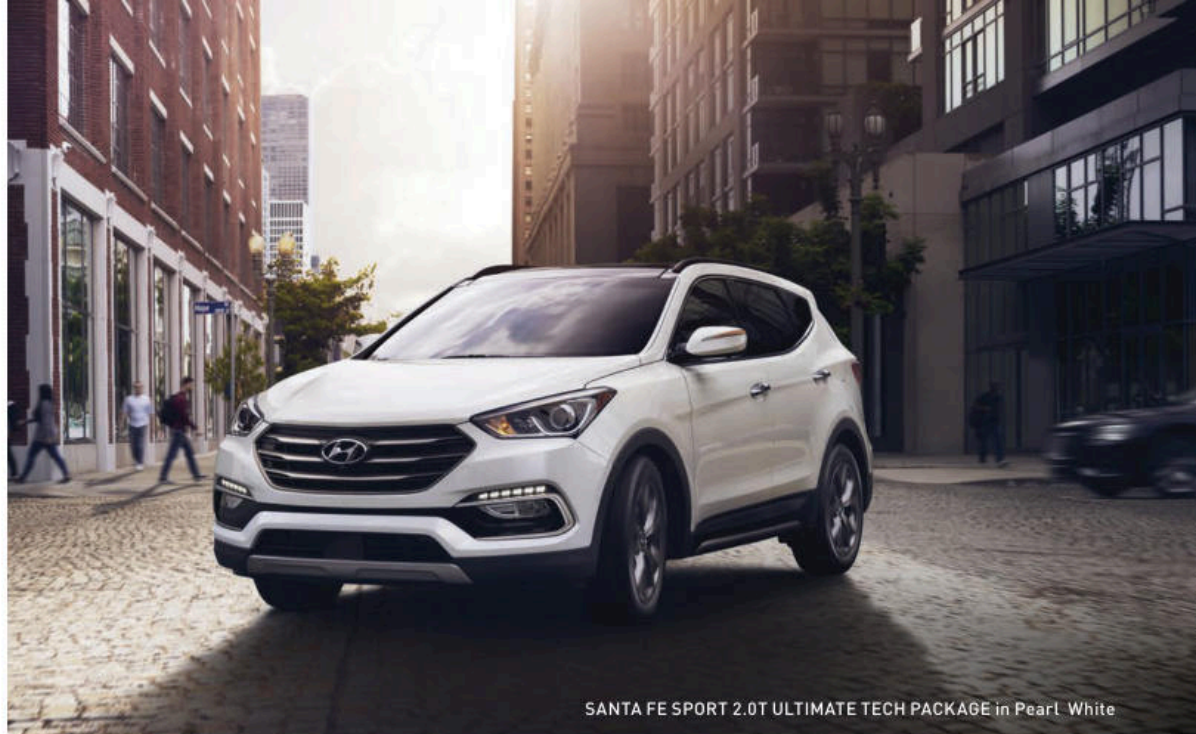
SANTA FE SPORT 2.0T ULTIMATE TECH PACKAGE in Pearl White