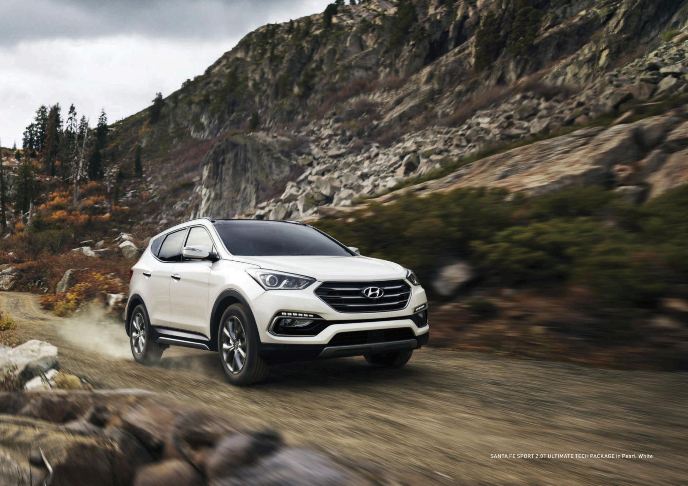
SANTA FE SPORT 2.0T ULTIMATE TECH PACKAGE in Pearl White