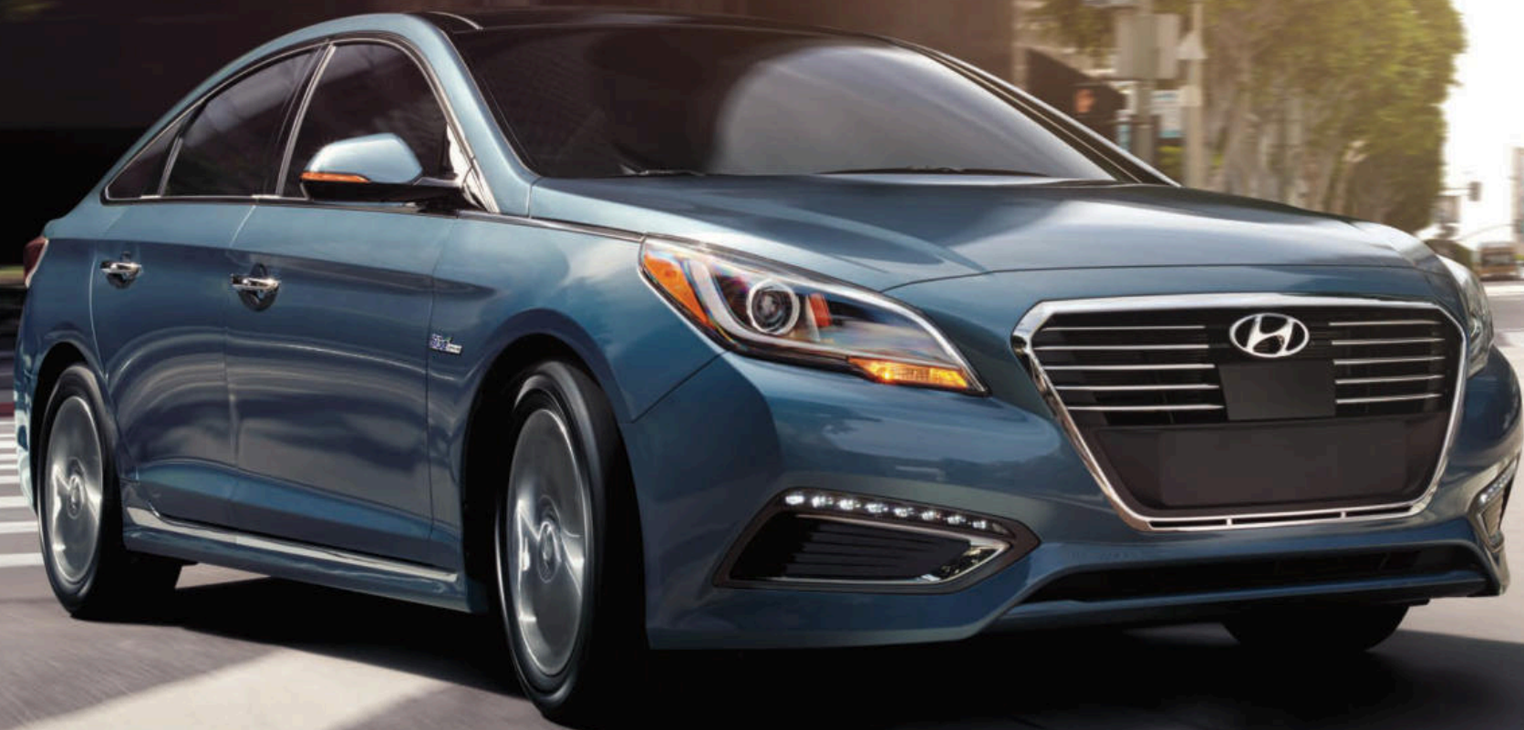
SONATA HYBRID LIMITED Ultimate Package in Graphite Blue Pearl