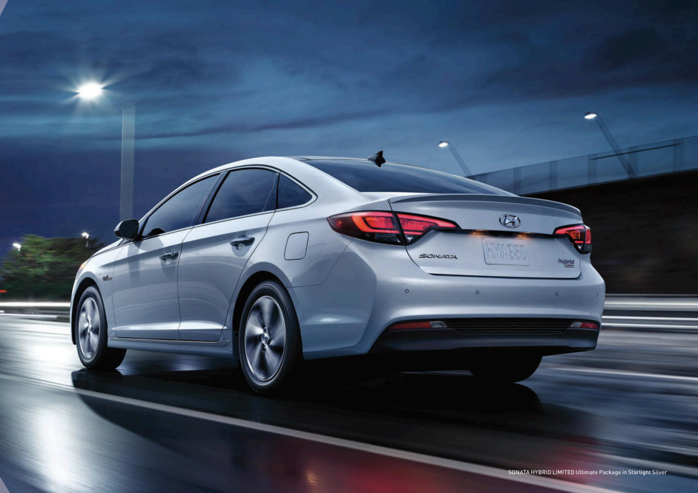
SONATA HYBRID LIMITED Ultimate Package in Starlight Silver