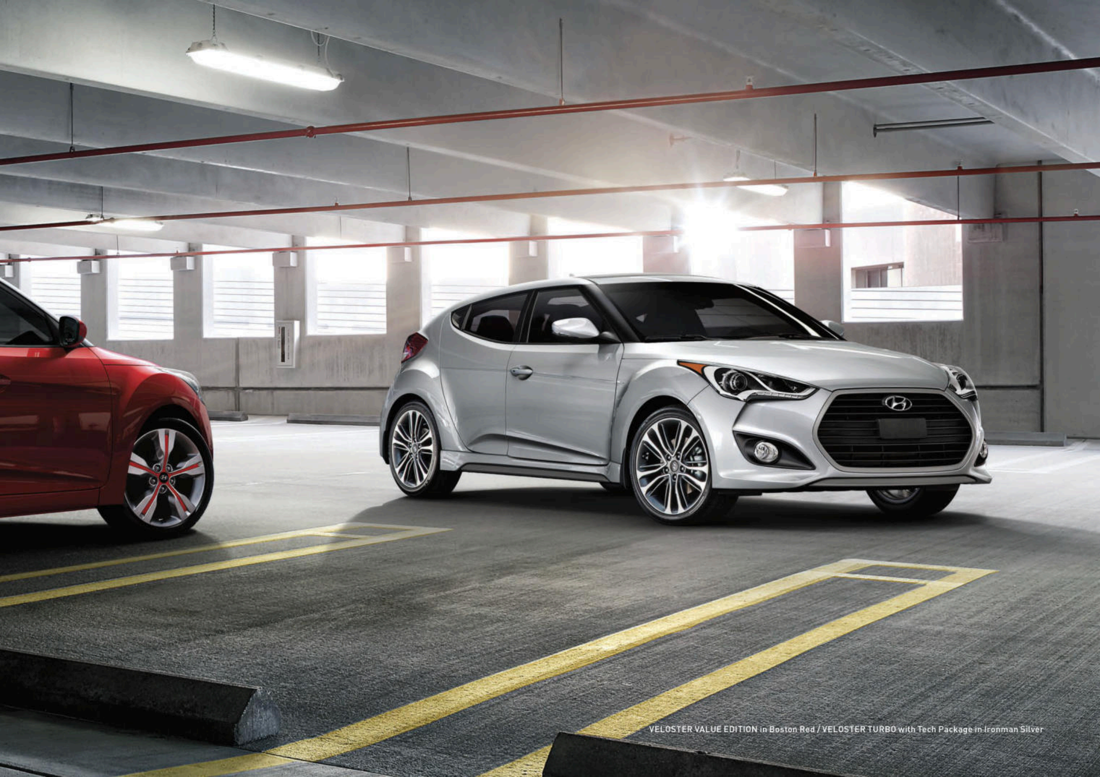
VELOSTER VALUE EDITION in Boston Red / VELOSTER TURBO with Tech Package in Ironman Silver