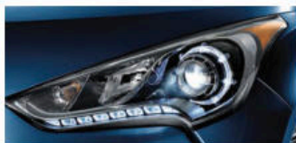
LED Headlight Accents