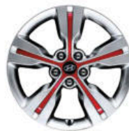
18" Alloy Wheel Value Edition