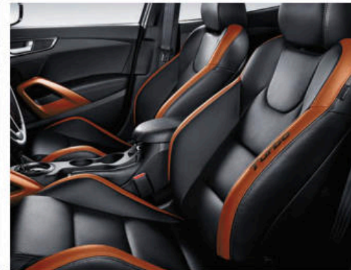
Black Leather with Orange Accents