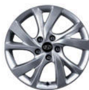
17" Alloy Wheel Standard