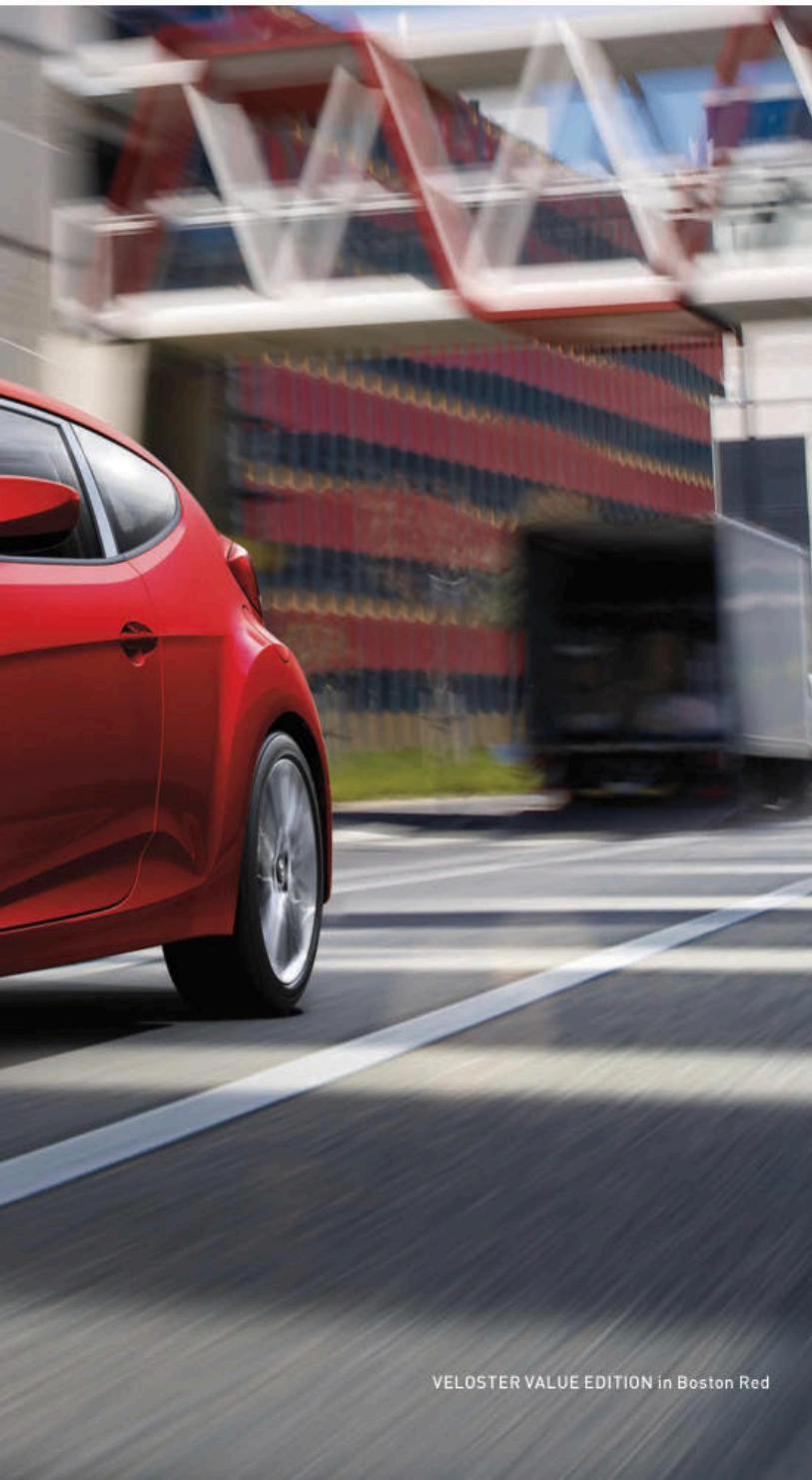
VELOSTER VALUE EDITION in Boston Red