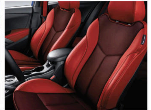
Black/Red Cloth + Red Leatherette