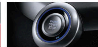
Push Button Start