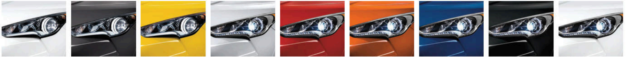
Century White Veloster