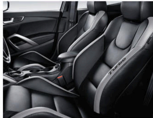
Black Leather with Silver Accents