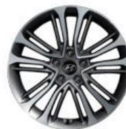
18" Alloy Wheel Turbo & R-Spec