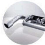
Active Sport Exhaust