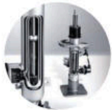
Electronically Controlled Suspension