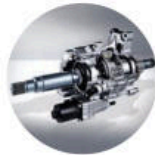
N Corner Carving Differential