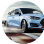
N Power Sense Axle