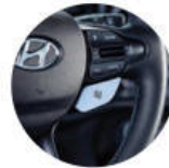
N Grin Control Drive Mode Select