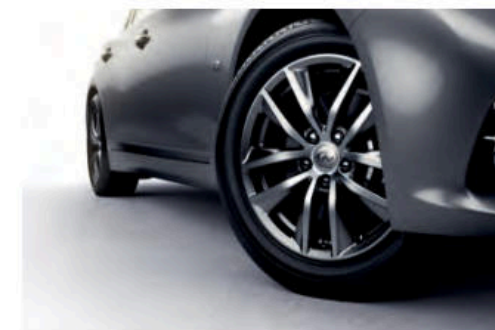
17 X 7.5-INCH, SPLIT 5-SPOKE ALUMINUM-ALLOY WHEELS WITH ALL-SEASON RUN-FLAT PERFORMANCE TIRES