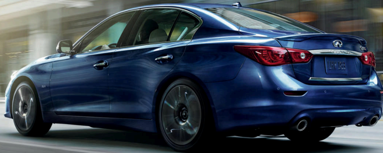
Vehicle shown with accessory rear decklid spoiler.

KEEP YOUR DISTANCE Distance Control Assist 1,7 looks ahead and warns you if your following distance becomes too short. If detected, and you do not take your foot off the accelerator pedal, the system will partially engage the brakes and push back on the accelerator pedal.