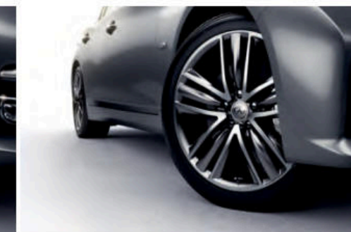
19 X 8.5-INCH, TRIPLE 5-SPOKE ALUMINUM-ALLOY WHEELS WITH ALL-SEASON OR SUMMER RUN-FLAT PERFORMANCE TIRES*