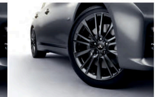
19 X 9-INCH FRONT, 19 X 9.5-INCH REAR STAGGERED UNIQUE ALUMINUM-ALLOY WHEELS*** WITH SUMMER RUN-FLAT PERFORMANCE TIRES**

Infiniti has taken care to ensure that the color swatches presented here are the closest possible representations of actual vehicle colors. Swatches may vary slightly due to the printing process and whether viewed in daylight, fluorescent or incandescent light. Please see the actual colors at your local Infiniti Retailer.