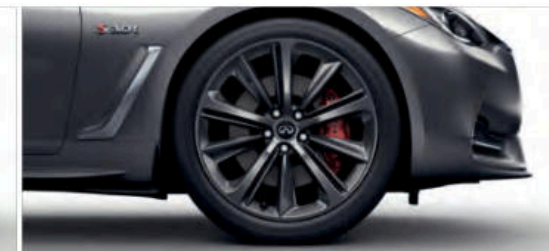
20 X 9.0-INCH FRONT, 20 X 9.5-INCH REAR STAGGERED ALUMINUM-ALLOY WHEELS***