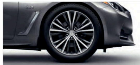
19 X 9.0-INCH ALUMINUM-ALLOY WHEELS