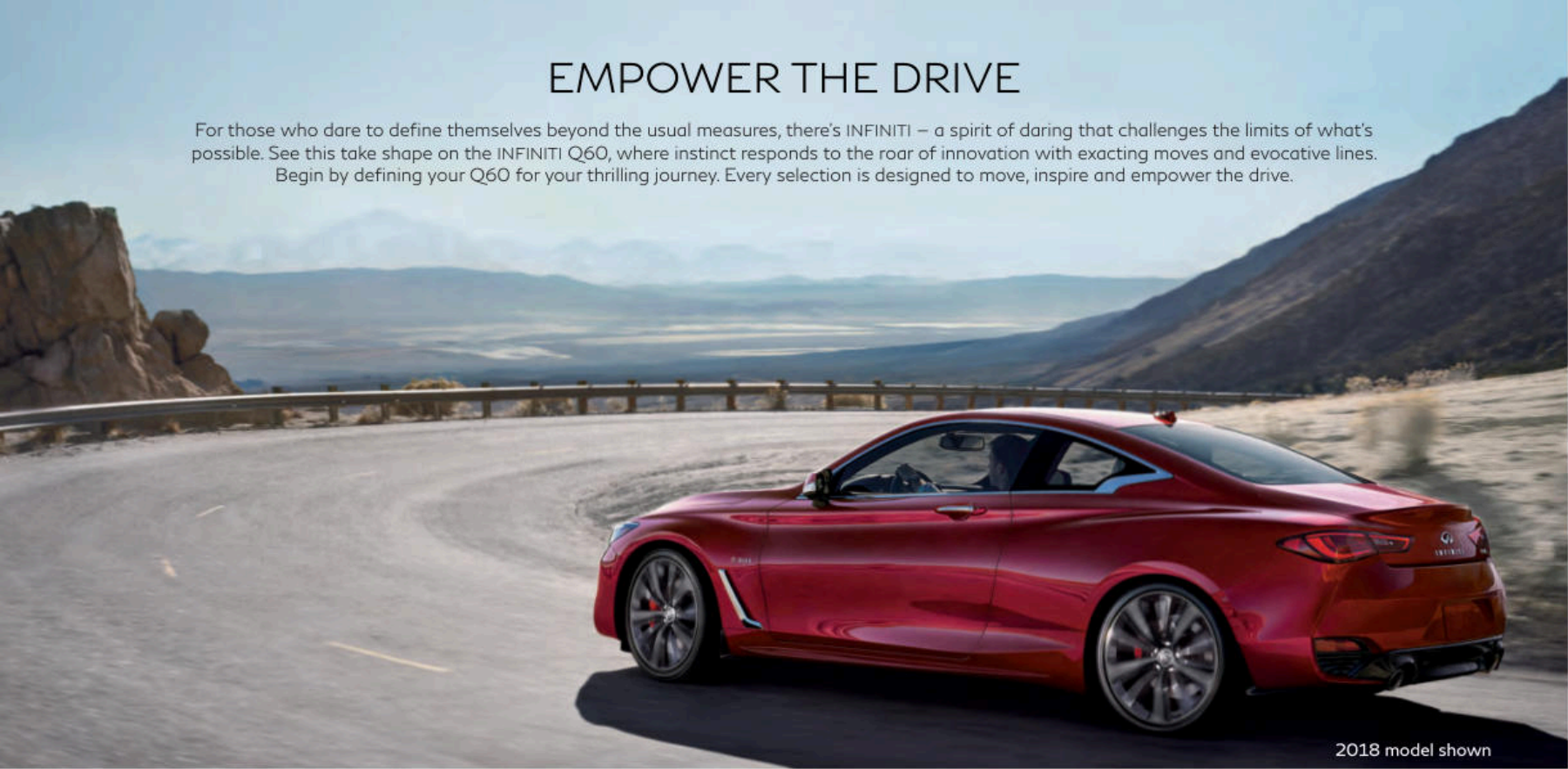
2018 model shown

For those who dare to define themselves beyond the usual measures, there's INFINITI – a spirit of daring that challenges the limits of what's possible. See this take shape on the INFINITI Q60, where instinct responds to the roar of innovation with exacting moves and evocative lines. Begin by defining your Q60 for your thrilling journey. Every selection is designed to move, inspire and empower the drive.