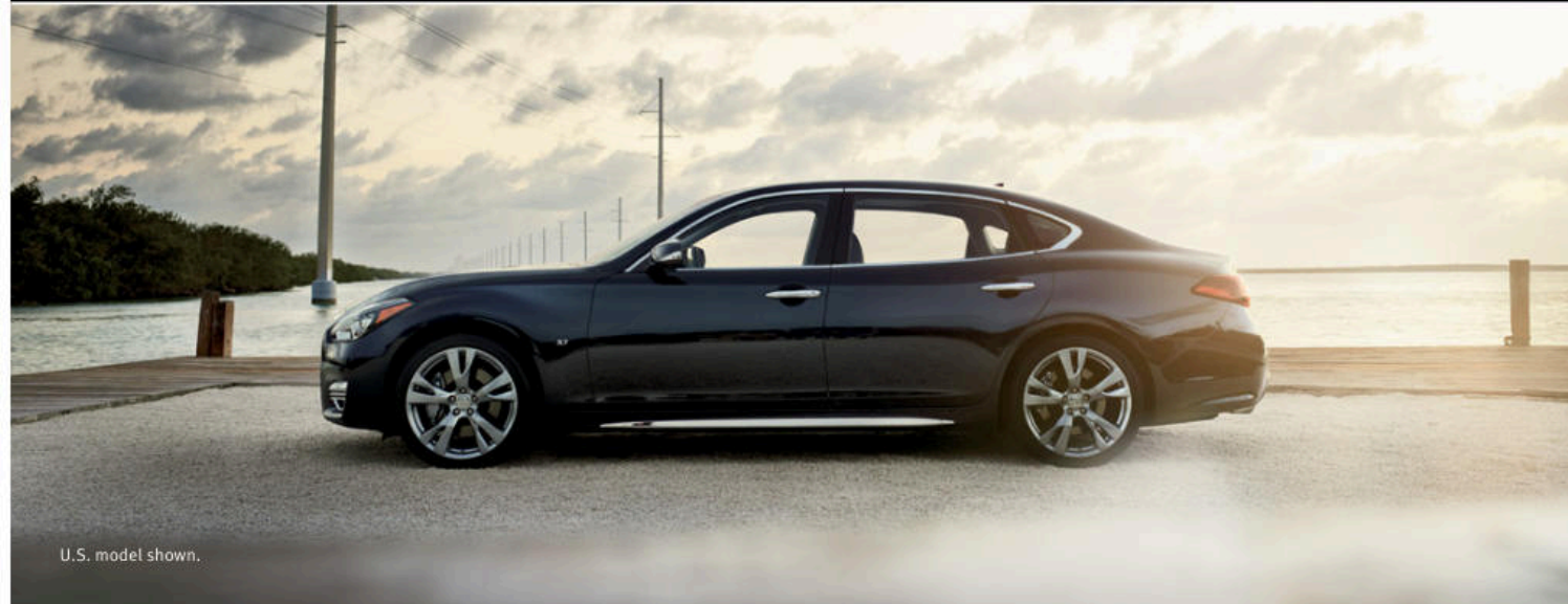
U.S. model shown.