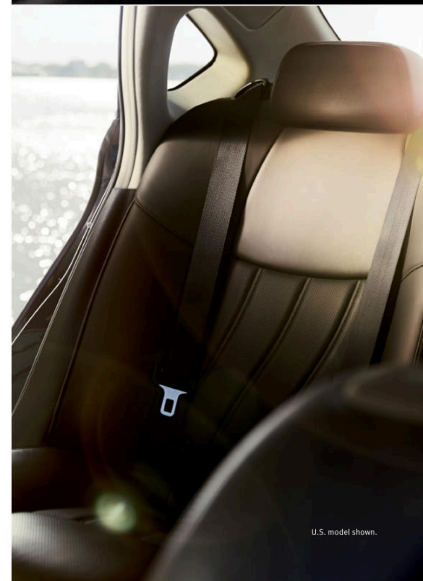
U.S. model shown.