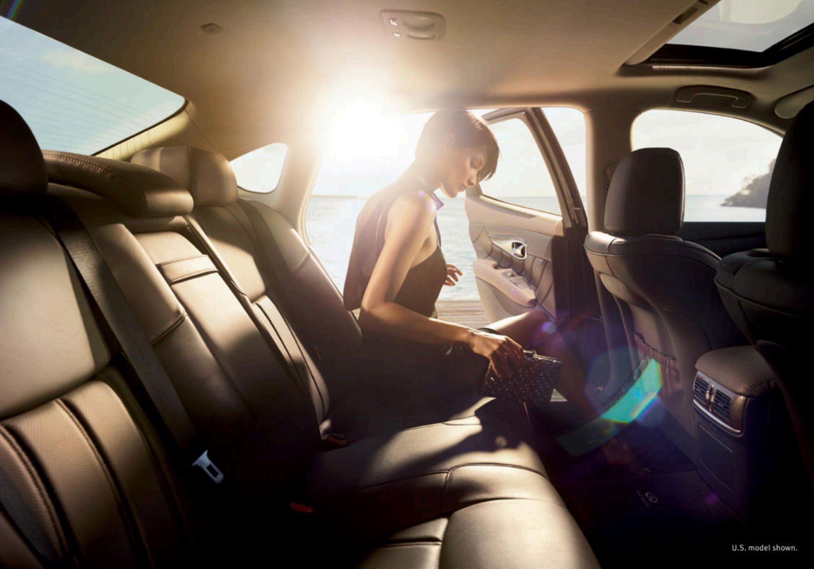
U.S. model shown.