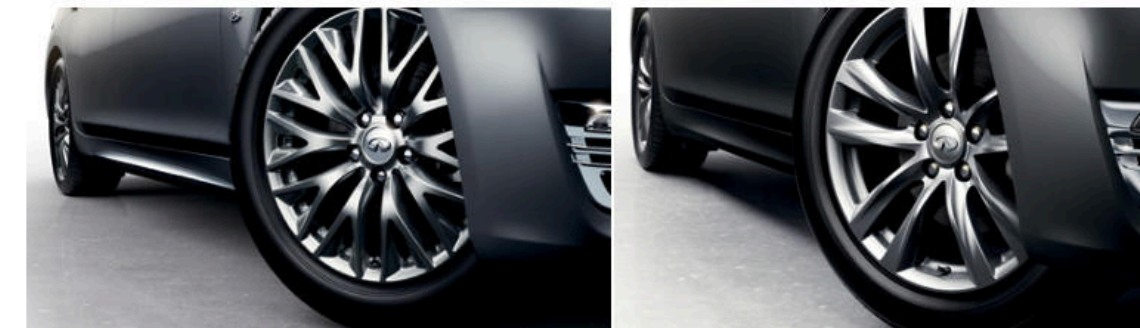
18 X 8.0-INCH ALUMINUM-ALLOY WHEELS