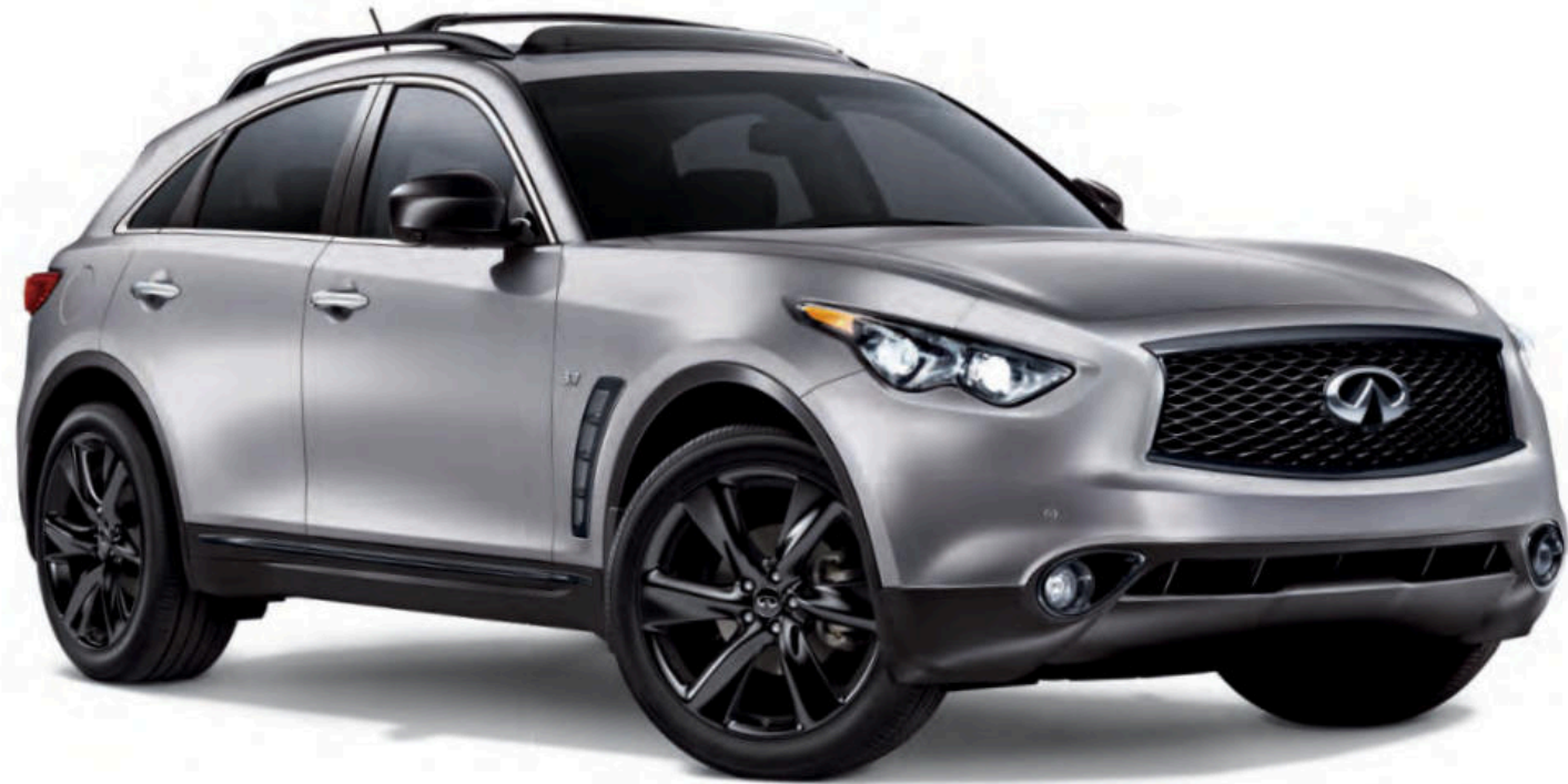
ACCESSORIES SHOWN Black roof rail crossbars, 18 splash guards and moonroof wind deflector.

The same exacting standards applied to the creation of an Infiniti vehicle go into designing and manufacturing Genuine Infiniti Accessories. With a wide array of quality products designed to integrate seamlessly, you can be assured of a custom fit and finish. 18 For more information and to shop online for Genuine Infiniti Accessories, go to parts.InfinitiUSA.com .