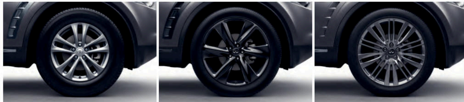
18 X 8.0-INCH ALUMINUM-ALLOY WHEELS