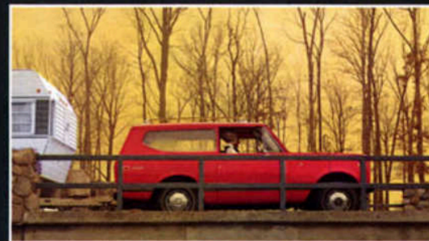
New Smoothie. Body and engine rest on rubber "cushions" to remarkably reduce vibration and noise.