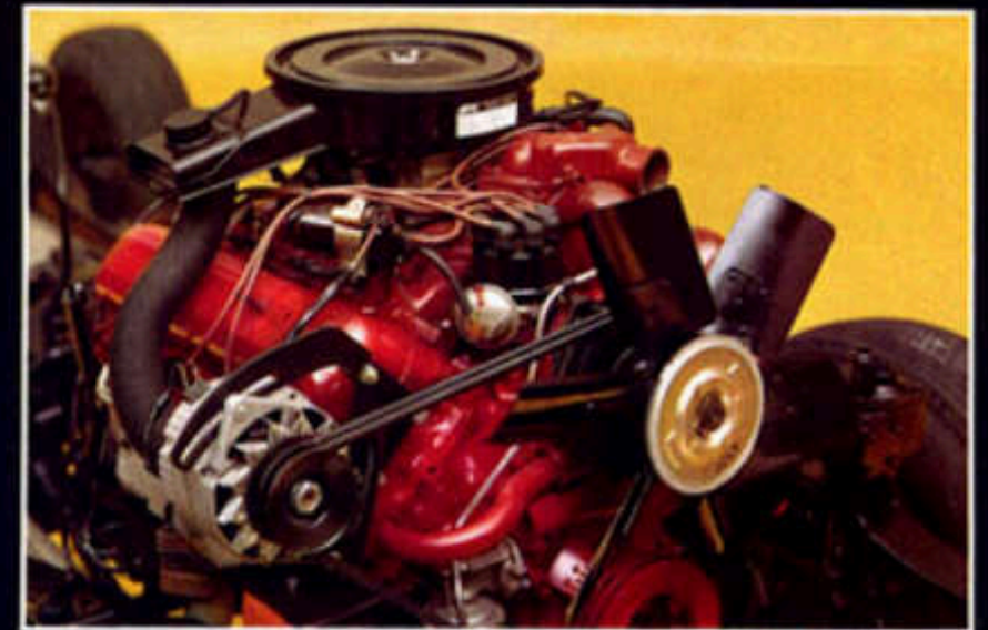
Power-packed V-8. A 345 cubic incher that delivers all the power you'll ever want. Meets all emission requirements. Available with automatic choke, and modulated fan to save gas.