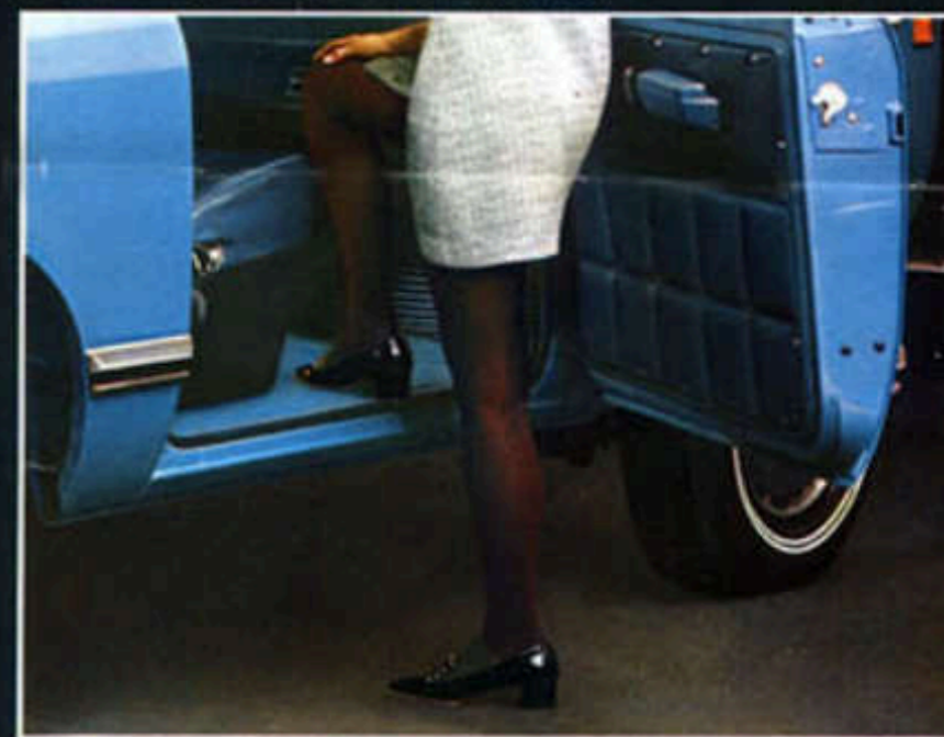
On the level. Floor and door frame are same height. No stepping down into a well or up to get into the back seat.