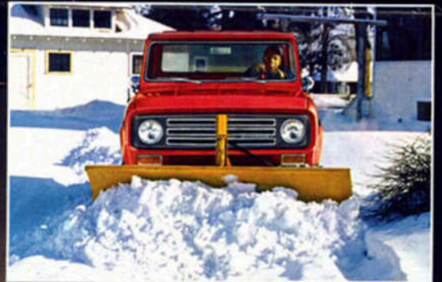
Muscles for moving. Scout II is a year 'round workhorse. It can be equipped with an electric or hydraulic snow plow, transfer case power take off, front tow hook and rear tow loop.