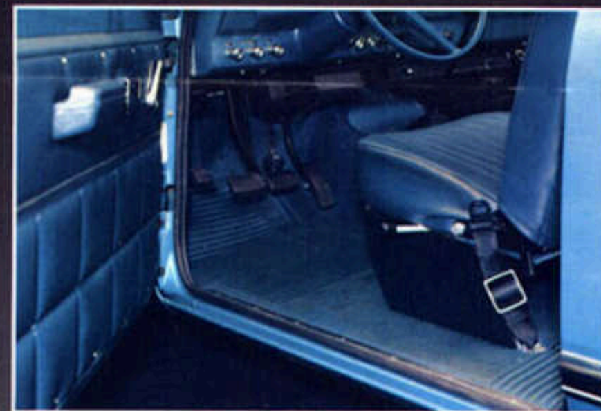
Full-size comfort. Extra-wide doors, smooth floor, lots of legroom end that "compact cramp" feeling.