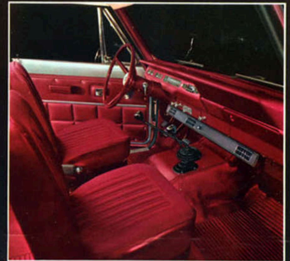
Luxurious interiors in choice of colors, with bucket seats or 1/2-3/4 split bench seat, and selection of comfort/convenience options.