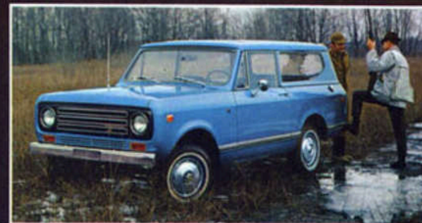
Sportsman's dream. Rugged off-road dependability with the driving refinements of a sports car.