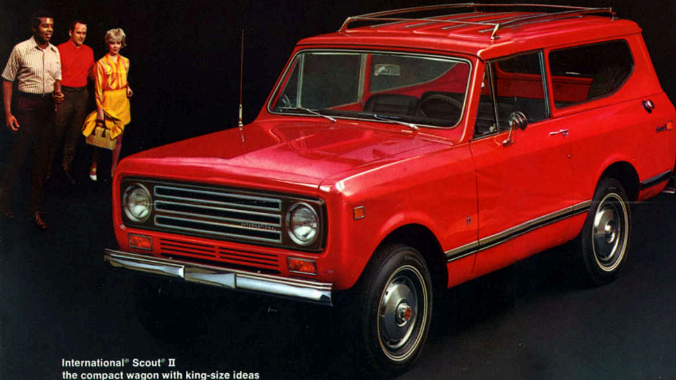
International® Scout® II the compact wagon with king-size ideas

Drive up to the country club in the morning for golf. Spend the afternoon cavorting across the boondocks. Then return in the evening for the big dance. Scout II belongs wherever you go. It's the most versatile "wagon" you can get. But watch out—you might find that your Scout has become your "favorite car."