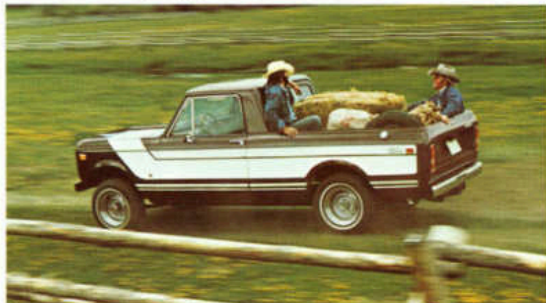
Having fun or hauling hands, Terra's 6-foot bed and 2,000-pound weight capacity let you carry a lot of cargo.