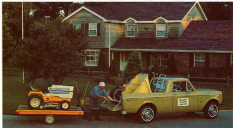
Terra has the versatility to be practical for work or off the road.