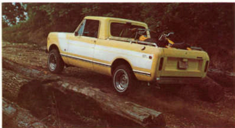
Let Terra's tough 4-wheel drive take you off the road to where the good trails begin.