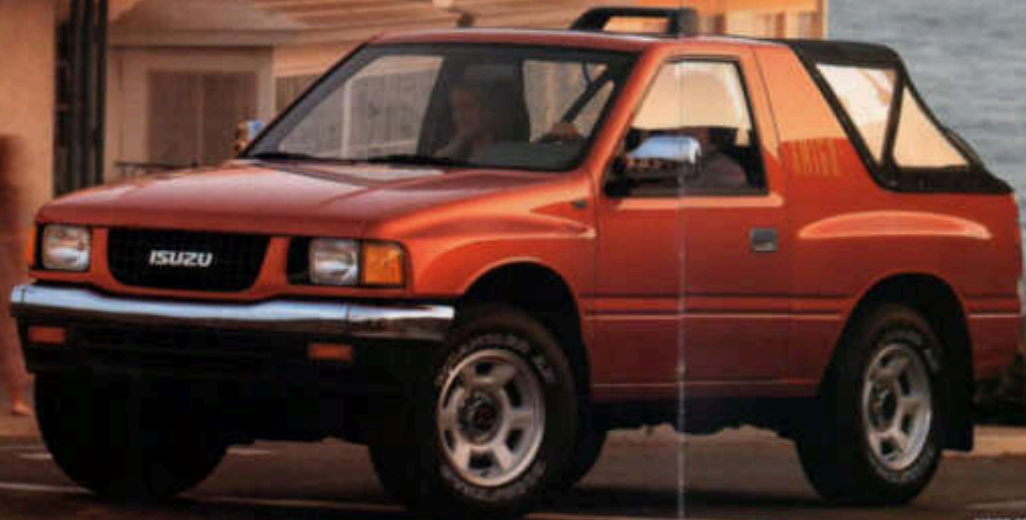
AMIGO XS 4WD

They'll probably never use Amigo to teach Driver's Ed. Don't get us wrong: Amigo's got a practical side. But what makes it amazing is how quickly an Amigo takes you to where the fun is. Whether it's the S or XS model, 2WD or 4WD, Amigo has the performance, comfort, style and versatility to get you anywhere you want to go. So long as your destination isn't Dulleville, U.S.A.