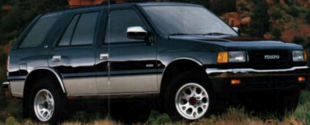
RODEO LS 4WD