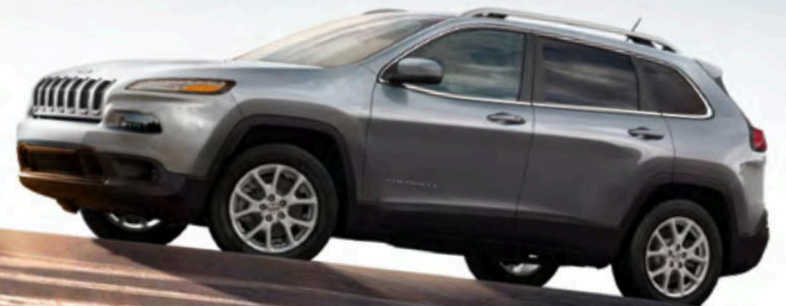
Latitude Plus in Billet Silver Metallic

LATITUDE PLUS Connect to great value. This all-new trim arrives with a standard Uconnect® 3C radio equipped with SiriusXM® Satellite Radio 5 and a large 8.4-inch full-color touchscreen. Other included features: Keyless Enter 'n Go™ ambient lighting, leather- and cloth-trimmed seating, a leather-wrapped steering wheel with audio controls, and an 8-way power driver's seat with 4-way lumbar control.