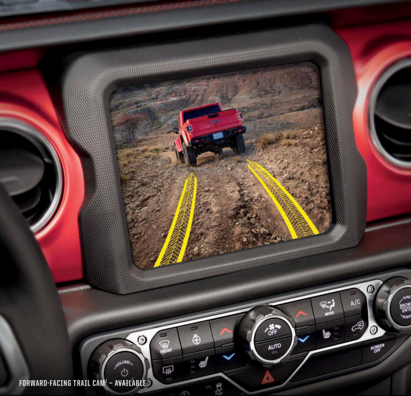
FORWARD-FACING TRAIL CAM 1 - AVAILABLE