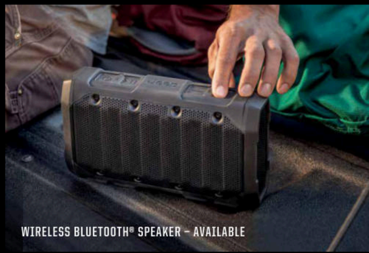
WIRELESS BLUETOOTH ® SPEAKER - AVAILABLE