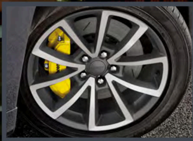
HIGH-PERFORMANCE 6-PISTON BREMBO® CALIPER

THE MORNING SKY OPENS. PRESS ON. TIME WILL NOT WAIT.