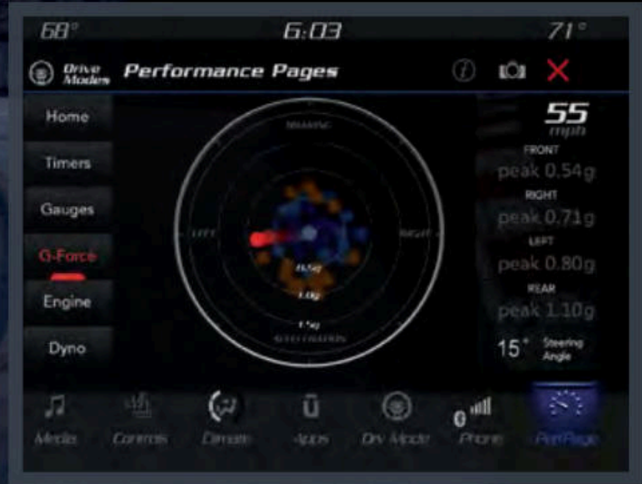
PERFORMANCE PAGES: G-FORCE HEAT MAP

SIMPLY EXHILARATING. LEAN IN. OWN EVERY CURVE.