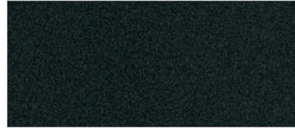
Interstellar Gray (Light, Wind)