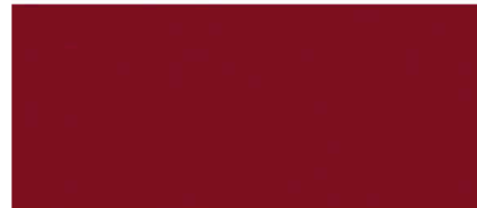
Runway Red (Wind, GT-Line)