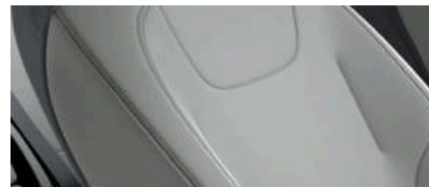
Misty gray vegan leather* (Wind)