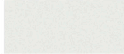
Snow White Pearl (Light, Wind, GT-Line)