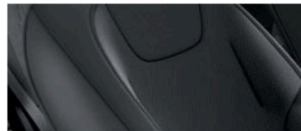
Black vegan leather (Wind)