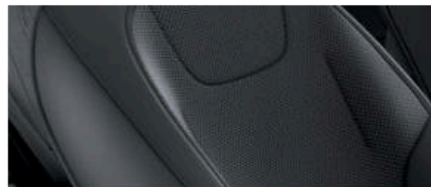
Black recycled fabric/vegan leather (Light)