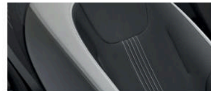
Black vegan leather w/white vegan leather trim (GT-Line)