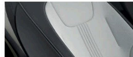
White vegan leather w/black suede trim* (GT-Line)