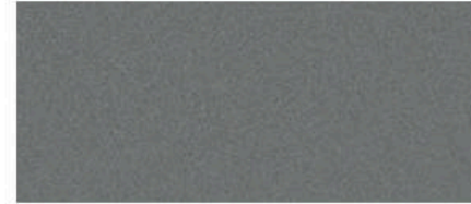
Steel Gray (Wind)