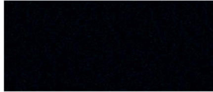
Aurora Black Pearl (Wind, GT-Line)