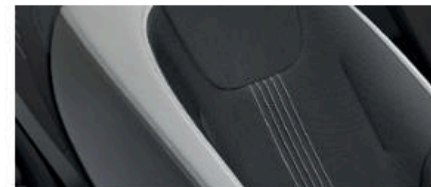
Black vegan leather w/white vegan leather trim (GT-Line)