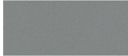
Steel Matte Gray* (GT-Line)