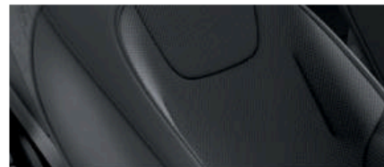
Black vegan leather (Wind)